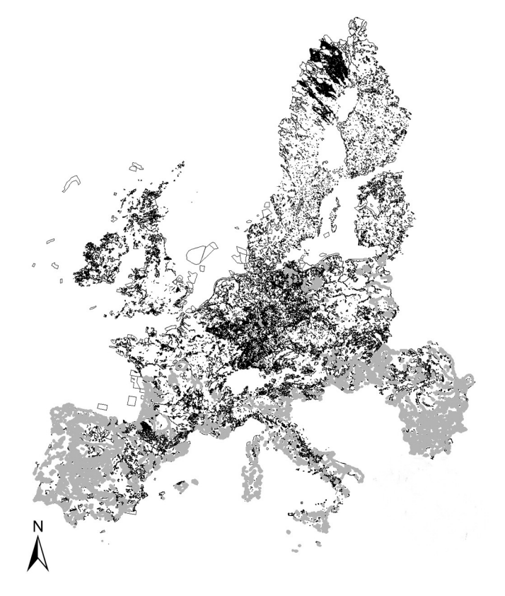
Fig. 2. In the Natura 2000 network of protected areas, most Special Areas of Conservation (all polygons represent SACs) that were created for Annex II reptile species at above-average risk by pesticide use (gray polygons) are situated in the southern parts (Mediterranean region) or the south-eastern parts (Pannonian and Continental region) of Europe compared to others (black surrounded polygons). Note that the Azores, the Canary Islands and Cyprus are excluded for better graphic representation.

species. Finally, Romanian SACs have usually low LPA, but the SACs that were created for V. ursinii are nearly half-covered by %LPA (Fig. 3).