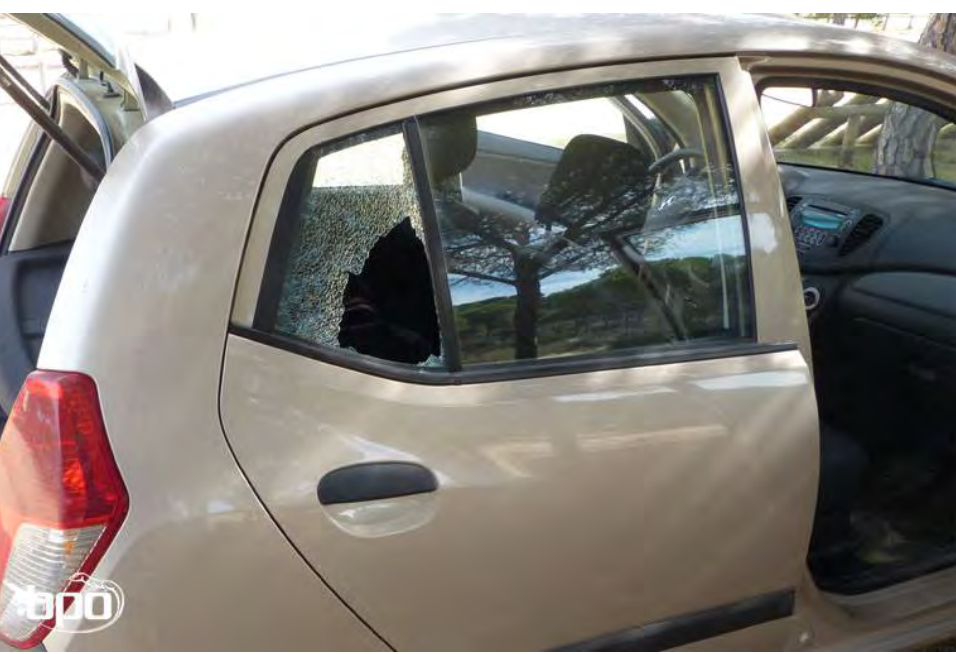
Meanwhile others were interested in our ca