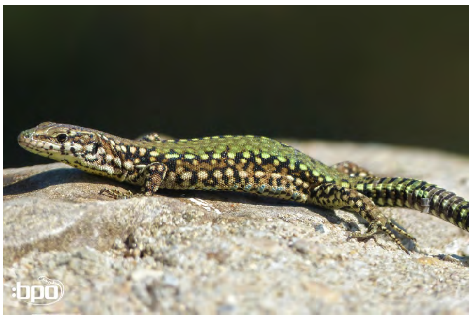
A remarkably pretty colored female