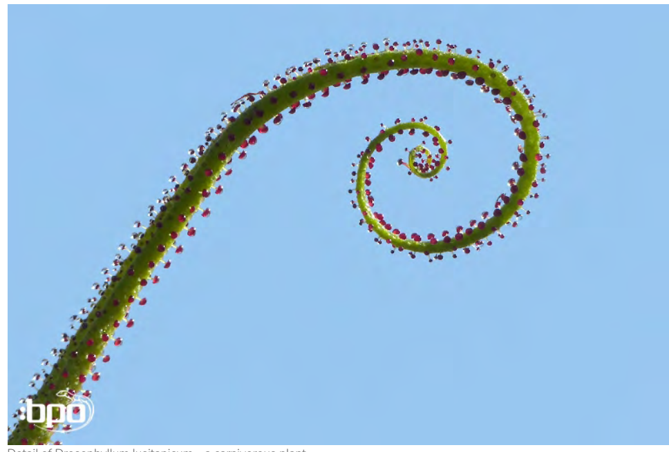
tail of Drosophyllum lusitanicum - a carnivorous plant