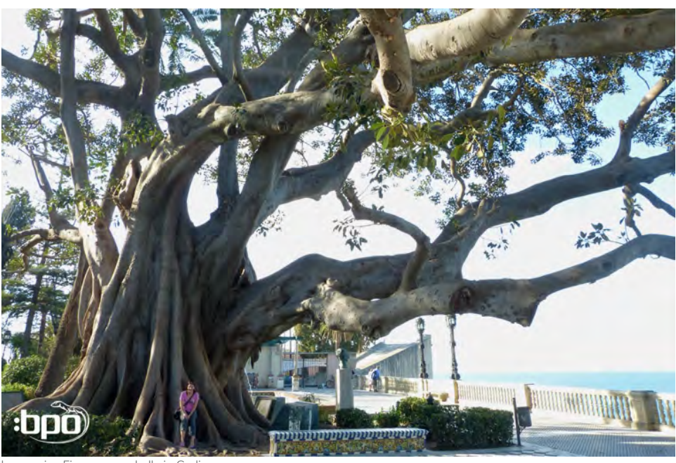
Impressive Ficus macrophylla in Cadi: