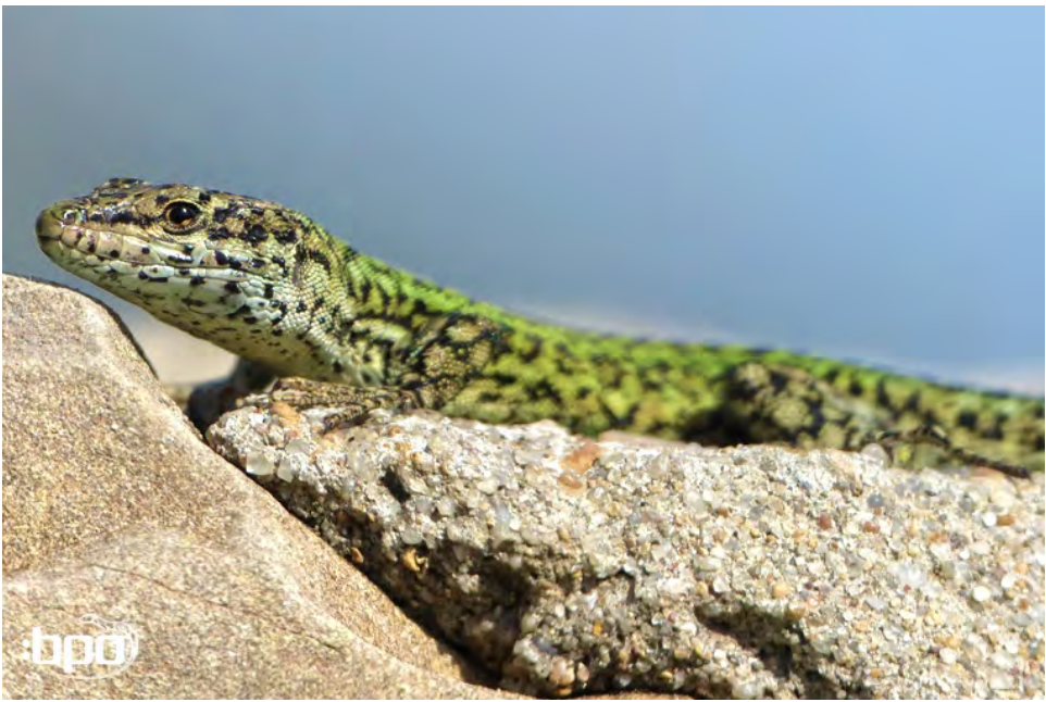
Male Podarcis vaucheri - one of the "must haves" of this trip