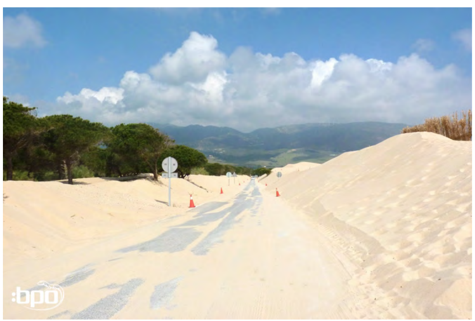
Road in the dunes..