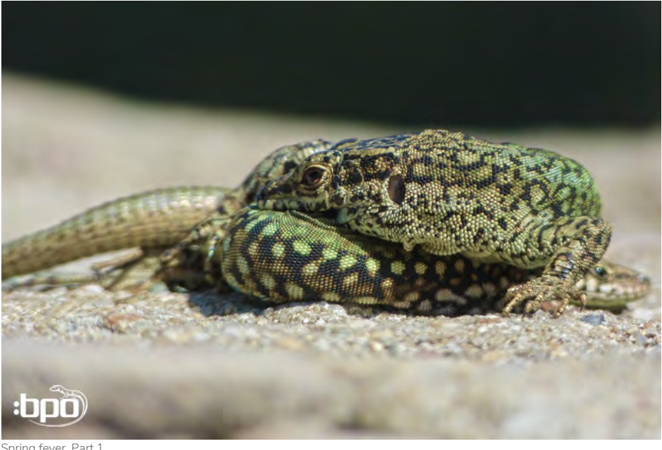
Spring fever, Part 1