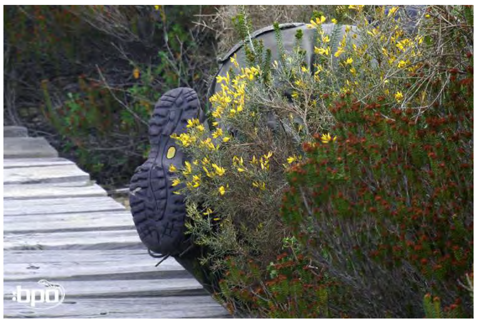
... and the photographer