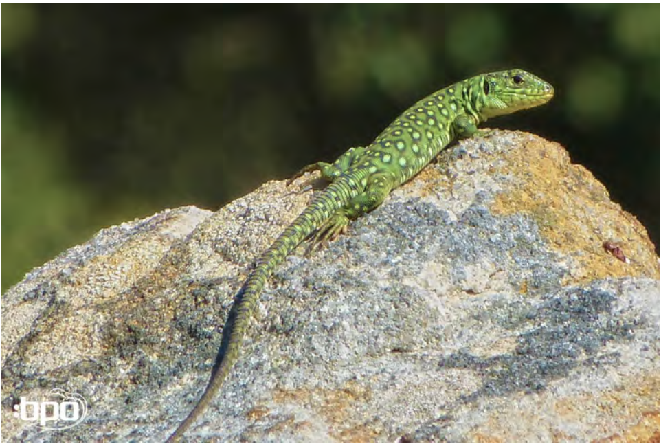
Subadult Timon lepidus - the only ocellated lizard of our journey

We visited another chameleon habitat which unfortunately was full of litter. No chameleons but at least some Acanthodactylus. In the evening: Return flight to Dusseldorf.