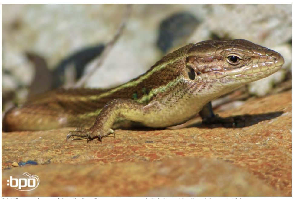
Adult Psammodromus algirus: the juveniles are very common but photographing the adults can be tricky.