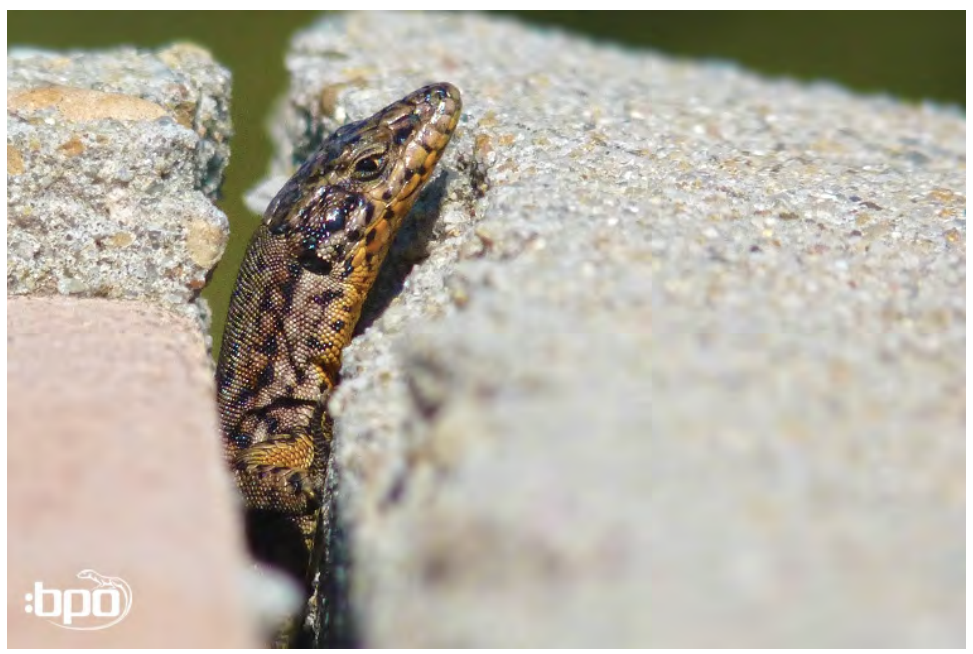
The first Podarcis vaucheri spotting out of a crevice - an animal with orange throat