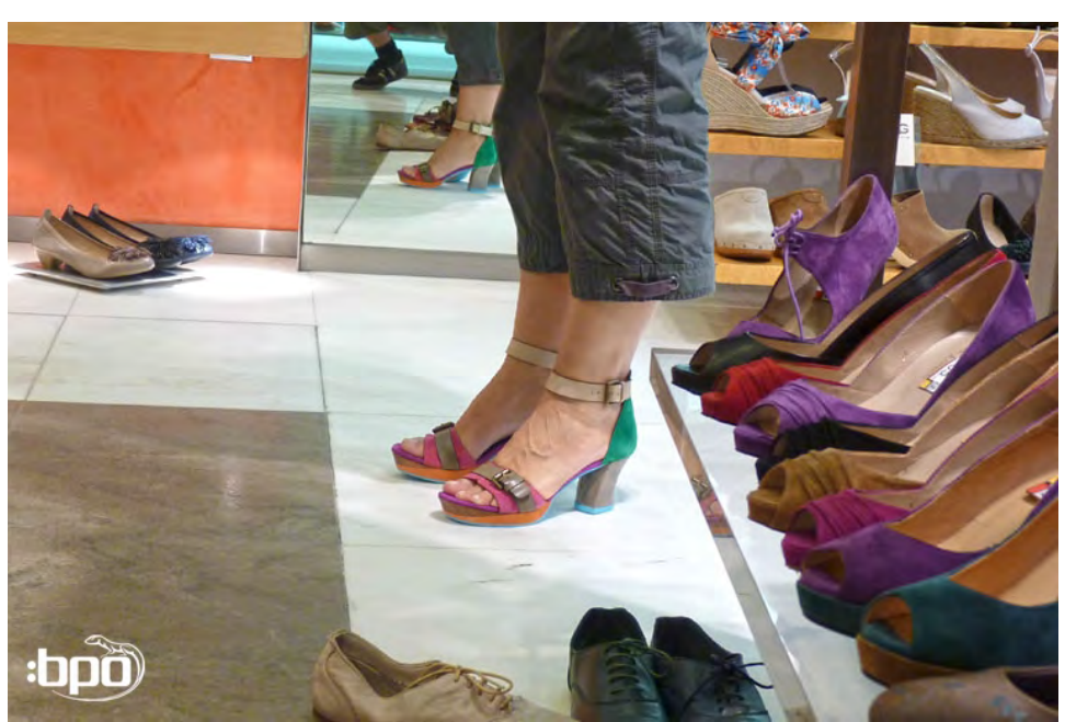
"Sightseeing" in Seville