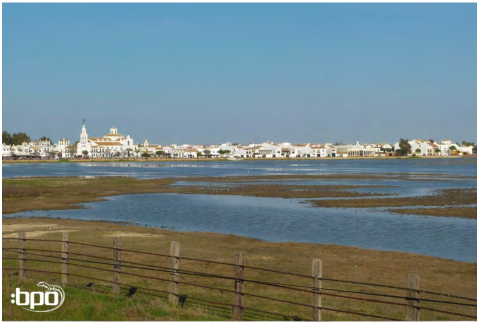
Southeastern Spain, 10.2016