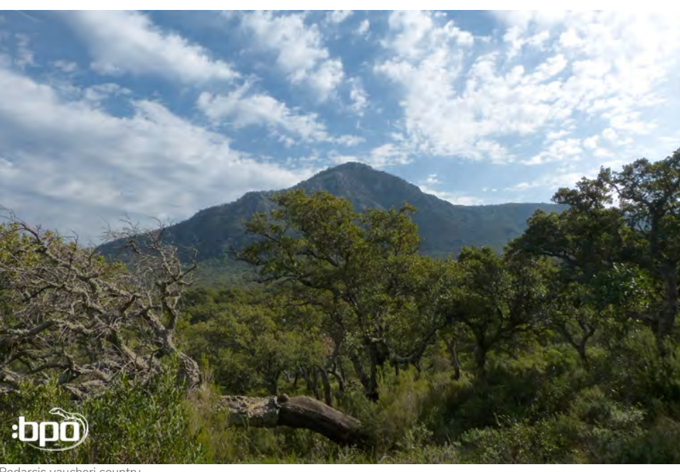
Podarcis vaucheri country

We decided to re-visit the Podarcis vaucheri site in the Alcornocales National Park. There we found numerous Podarcis vaucheri and some other species - this should turn out to be the most successful day of the trip!