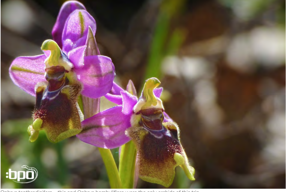
Ophrys tenthredinifera – this and Ophrys bombyliflora were the only orchids of this trip