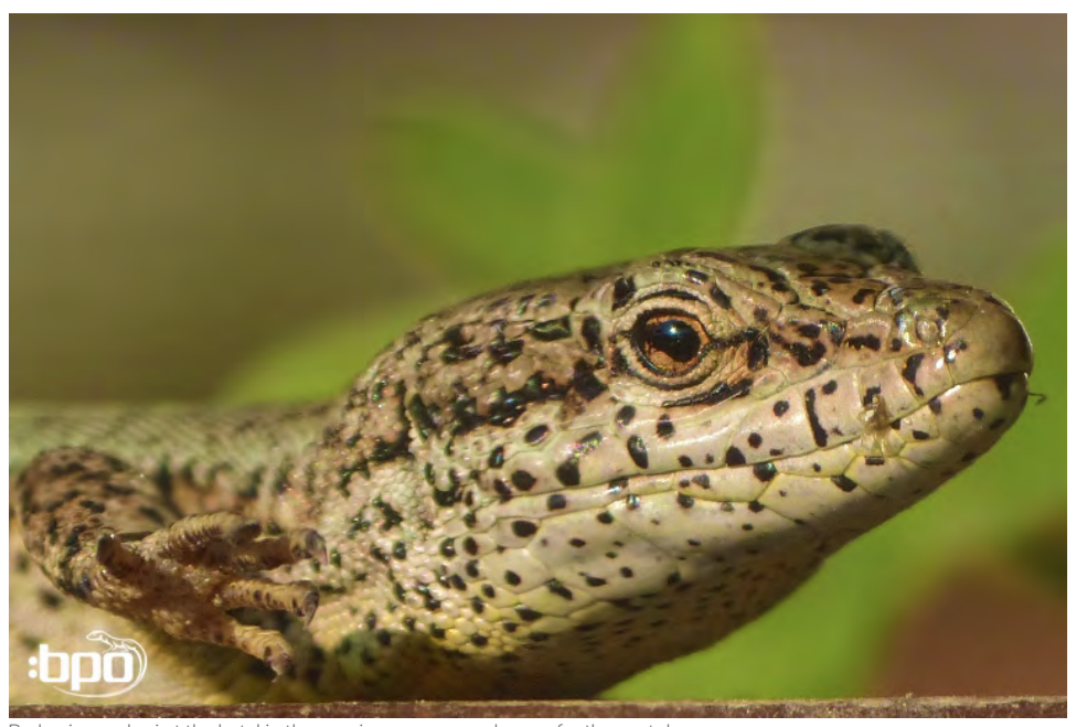
Podarcis vaucheri at the hotel in the evening sun - a good omen for the next day ...

We decided to re-visit the Podarcis vaucheri site in the Alcornocales National Park. There we found numerous Podarcis vaucheri and some other species - this should turn out to be the most successful day of the trip!