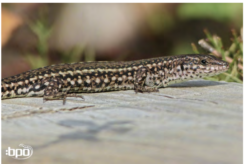
... a juvenile with contrasty pattern