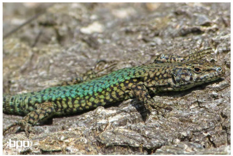
Podarcis vaucheri with remarkable turquoise colored back