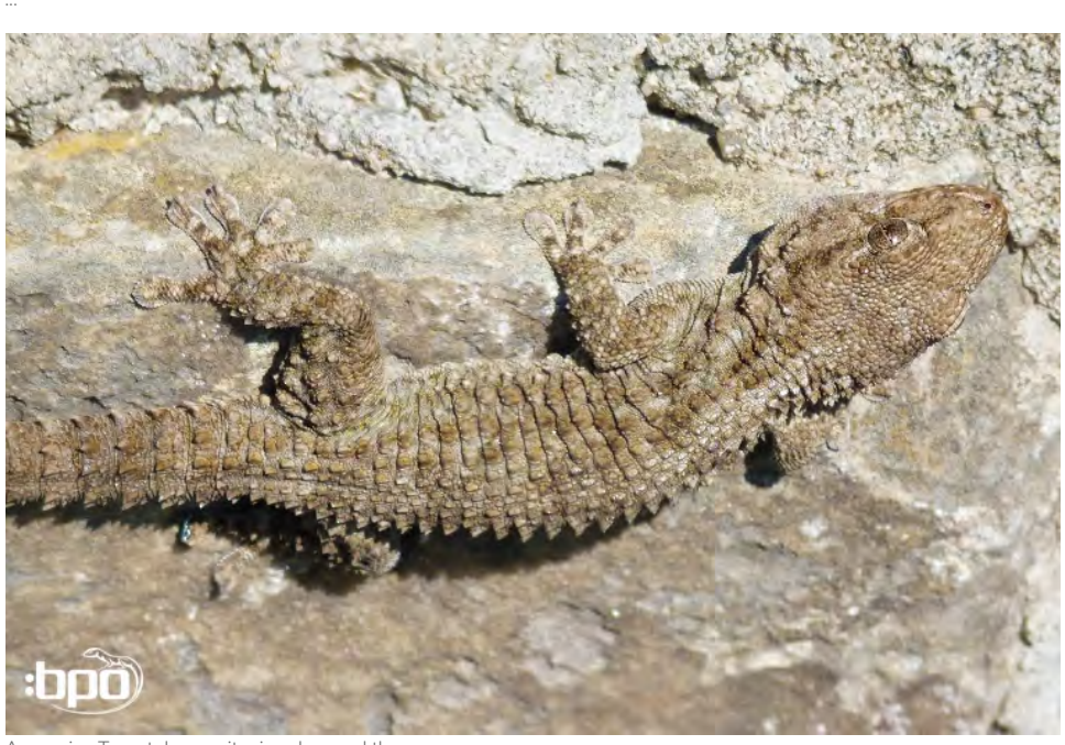
A massive Tarentola mauritanica observed the scene