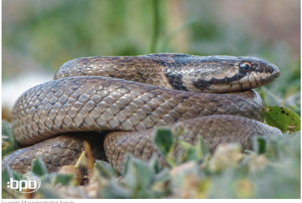
Juvenile Macroprotodon brevis