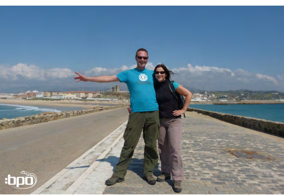
Holiday picture at the southern tip of the European continent: Tarifa