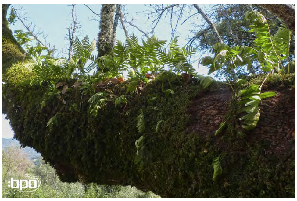
The cork oaks (Quercus suber) of the region are covered with epiphytic ferns - which obviously have suffered from the dry winter