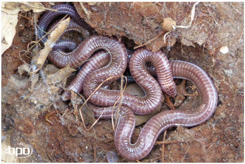
Three in one: Blanus mariae under a stone

Search for Podarcis vaucheri in Los Alcornocales National Park - A few shots of these lizards were made quickly, we also found Blanus mariae and Macroprotodon brevis, Hemorrhois hippocrepis as well as some interesting plants.