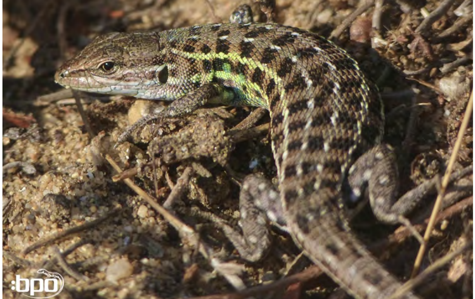
Psammodromus occidentalis - The recently described species previously considered as Psammodromus hispanicus