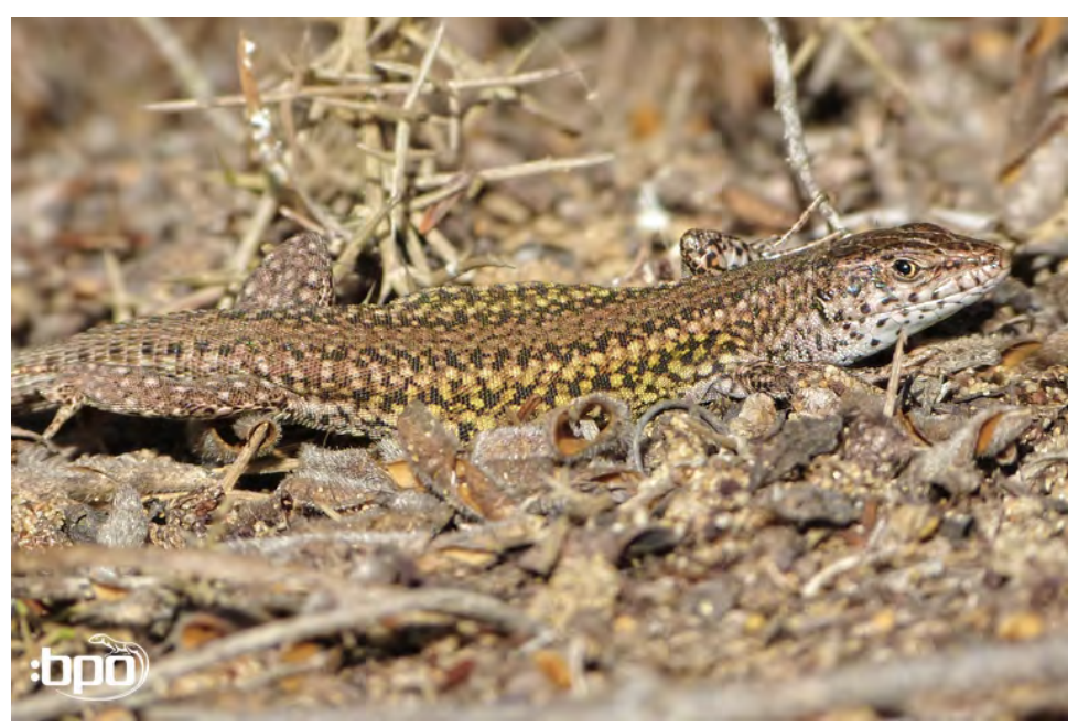
Podarcis carbonelli – second attempt...