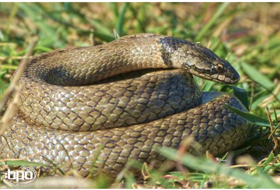
Adult Macroprotodon brevis