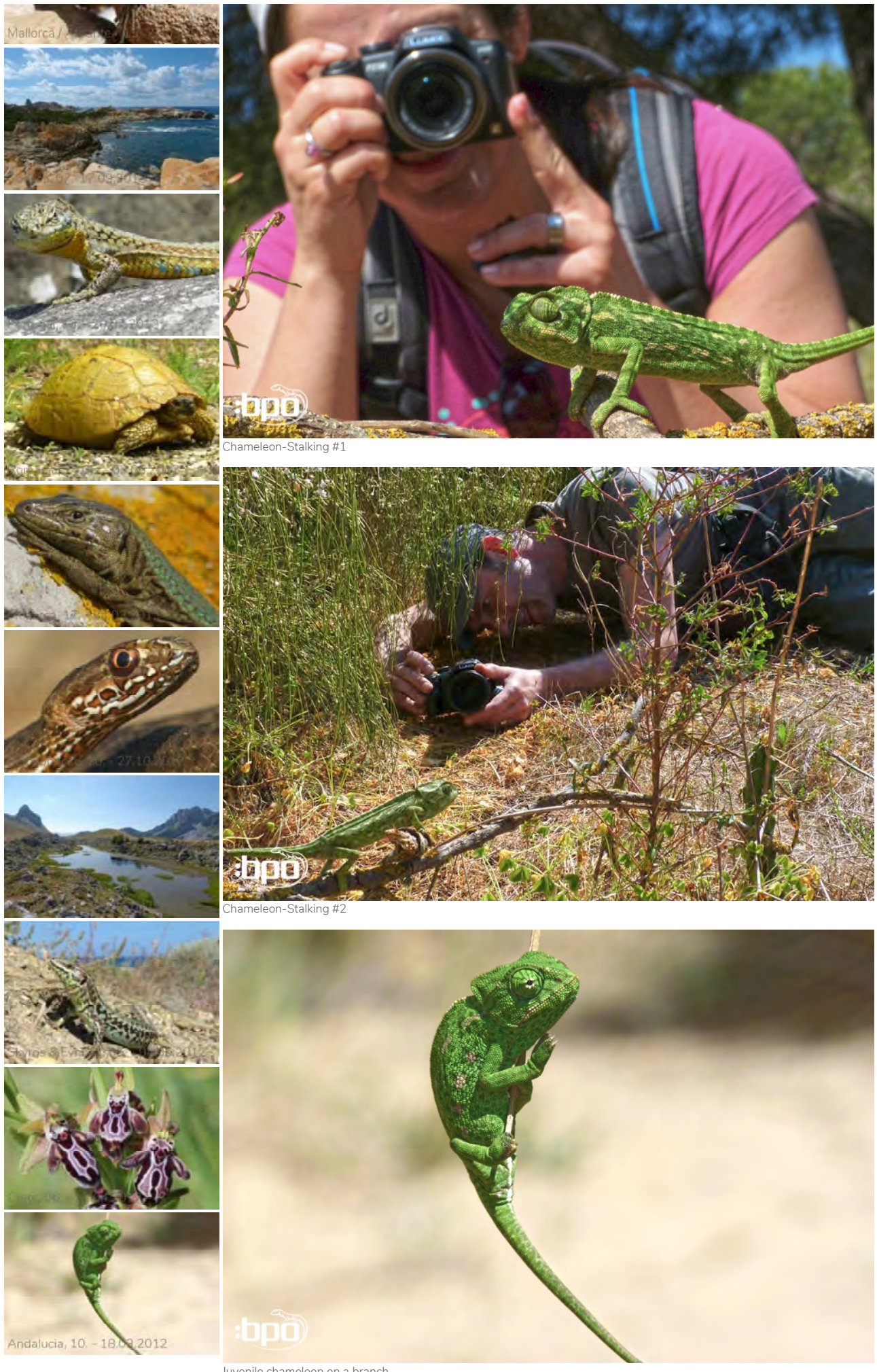
Juvenile chameleon on a branch