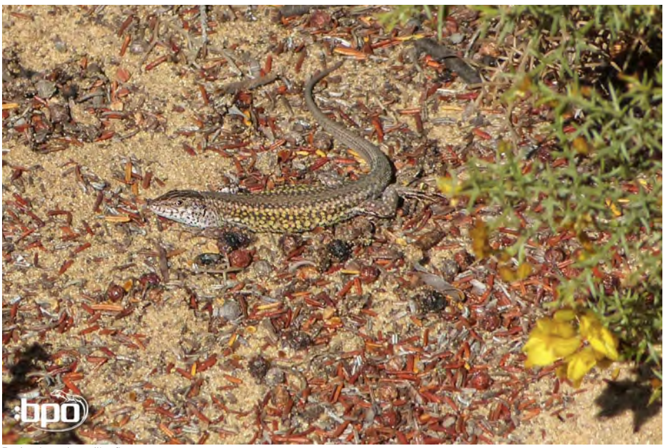
Podarcis carbonelli – first attempt

First attempt to photograph Podarcis carbonelli: When we arrived in the habitat, the lizards were fully warmed up already and very hectic – no good photo results. In the afternoon: Sightseeing in Seville.