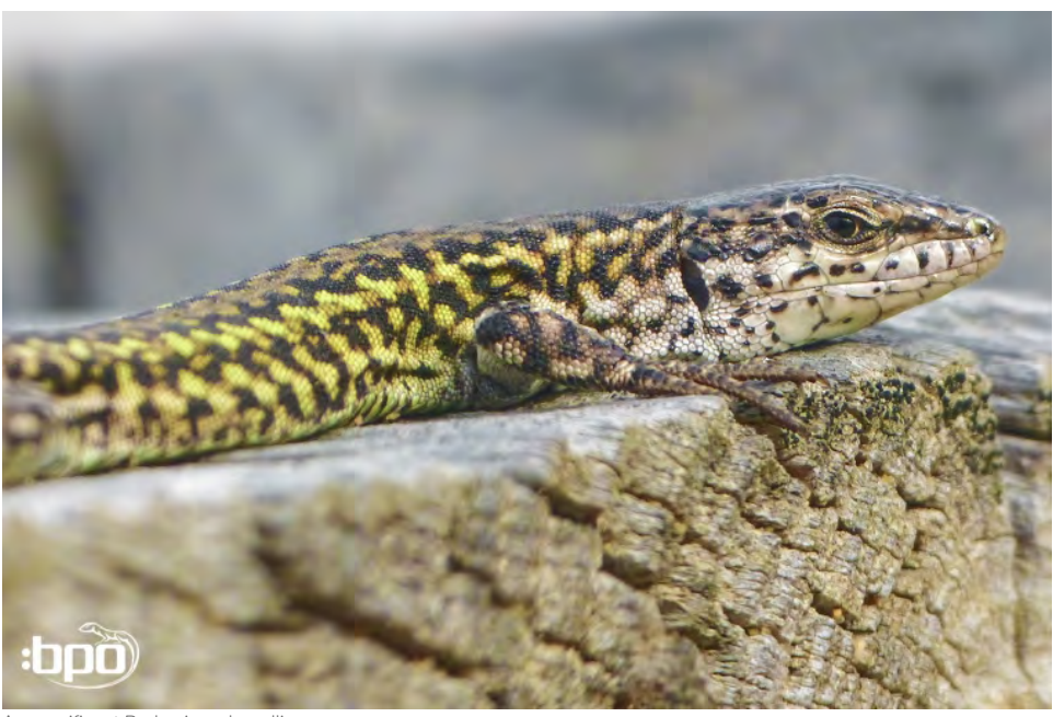
A magnificent Podarcis carbonelli...