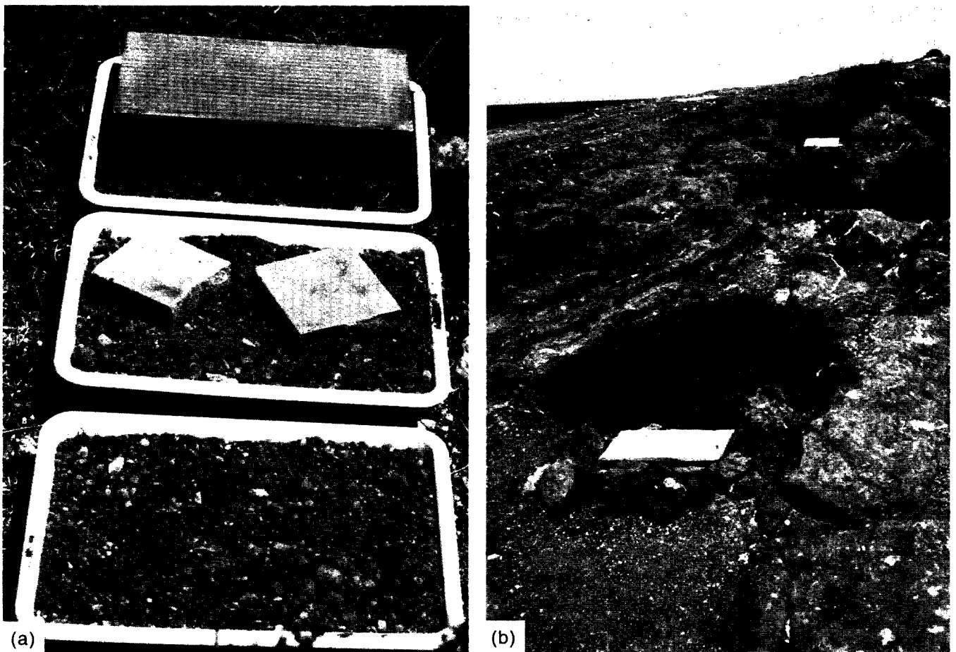
Fig. 1. Different types of artificial nests designed for P. h. atrata (a), and their location on the island of Columbrete Grande (area I) (b).

10 cm in height covering c. 40% of the sand surface. In another five we placed a large stone shingle used for house construction which covered c. 80% of the sand surface. The last five cages had only sand (Fig. 1(a)). All 15 containers were covered with a stone slab allowing ventilation and shading (Fig. 1(b)). About 0.6 l of rain water, collected in cisterns, was added to each container initially, and thereafter 0.1–0.3 l of water was added to each nest every other day, after temporarily removing the rocks and shingle from the nest. The containers were placed in two different areas separated by a distance of about 300 m. Area I was rocky, had little soil and vegetation, and a very low density of lizards (<100 individuals/ha); this area appeared to have a scarcity of suitable natural nesting sites. Area II was near the warden's habitation, had high vegetation cover, abundant soil, a high density of lizards (c. 800/ha, Castilla & Bauwens, 1991b), and apparently a high availability of oviposition sites. All containers were placed on the ground surface in a horizontal position and near a Suaeda vera shrub of c. 50 cm height, from 19 May until 30 July 1993. They were separated from each other by a minimum distance of 5 m and a maximum of 15 m (mean c. 9 m). Small volcanic rocks were placed all around the containers to render them more accessible to lizards, and to hide their white colour.