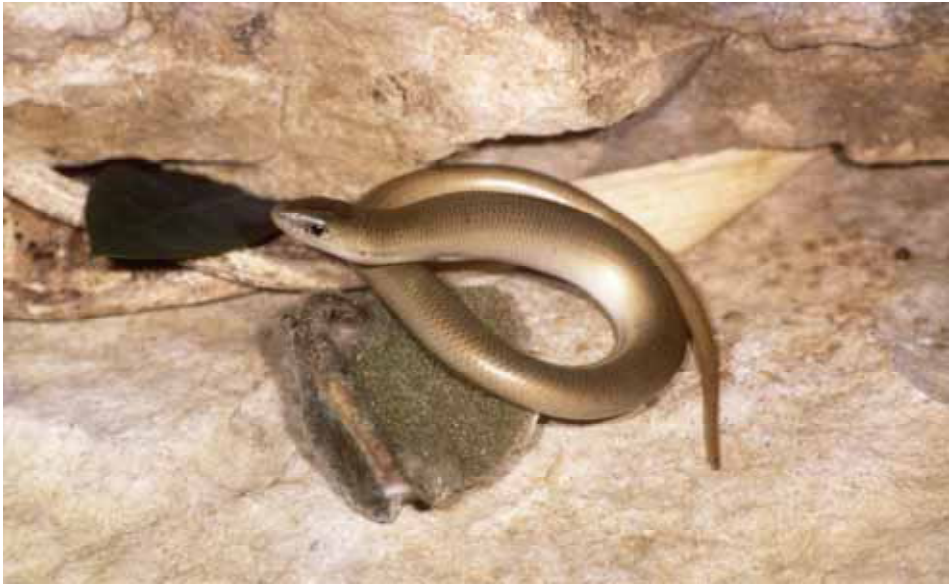
Fig. 4. Chalcides guentheri , King Talal Dam.

In the Badia, each lizard species preferred particular plant species. Moreover, Lacerta laevis is mainly collected from areas dominated by oak trees Quercus sp. (DISI & AMR 1998). While the presence of C. chamaeleon is dependent upon the need for structured vegetation cover.