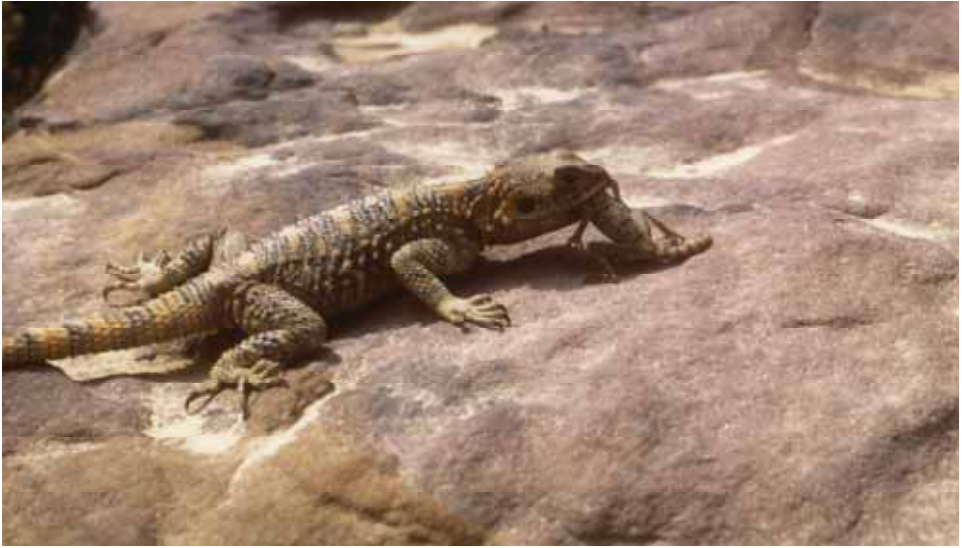
Fig. 5. Laudakia stellio eating subadult Ptyodactylus guttatus .