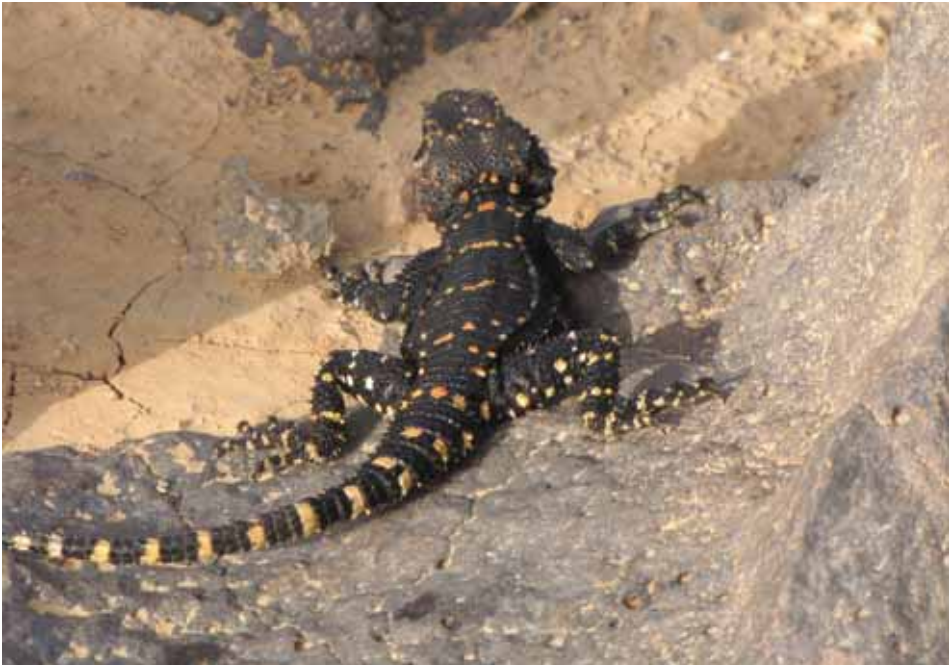
Fig. 2. Laudakia stellio picea .

sensitive tissues. This may explain how minimum temperature as well as vertical temperature gradient may act as a barrier for the distribution of certain herpetofauna species. The first is dependent upon latitude and the second is combined with altitude. This may allow the eastern mountains overlooking Wadi Araba to act as a barrier for certain species to block their way to the eastern plateau.