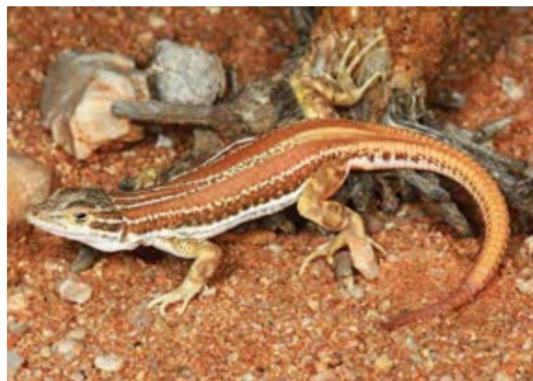
Meroles suborbitalis , Steinkopf, Northern Cape province.