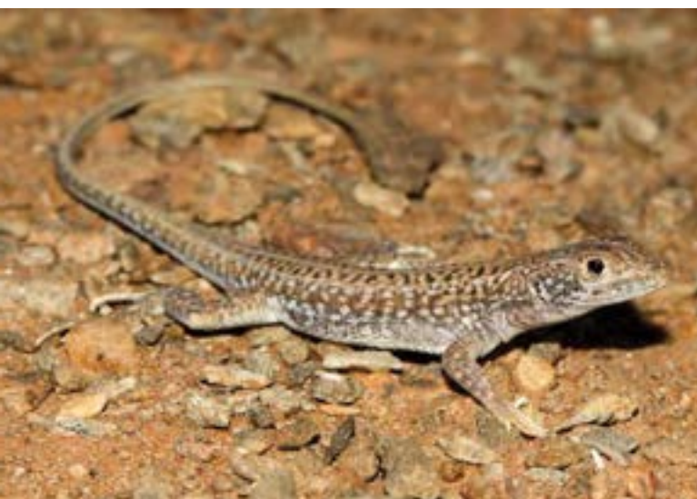
Meroles suborbitalis , Aggeneys, Northern Cape province.

Conservation and research recommendations: The hypothesis that this taxon may be a species complex should be evaluated in a phylogenetic framework.