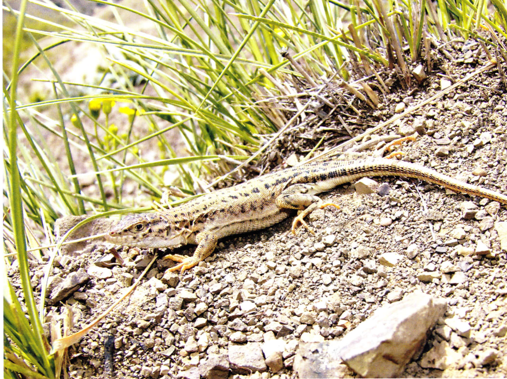
Fig. 233: Eremias papenfussi is characterized by five dark brown or black longitudinal stripes and scattered dark markings. Omid MOZAFFARI