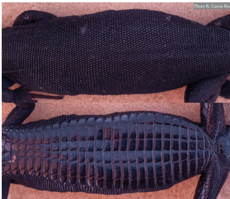
Figura 1: Dorso y vientre de la hembra melánica completa de Podarcis pityusensis de Na Gorra.

2015), which are very different in coloration and the degree of melanization (de la Cruz, personal observation). On the contrary, the individual we found was completely melanic, with no green and blue colors in the dorsum and all the ventral region covered by black (Figure 1). As far as we know, this is the first description of a completely melanic individual for this species.