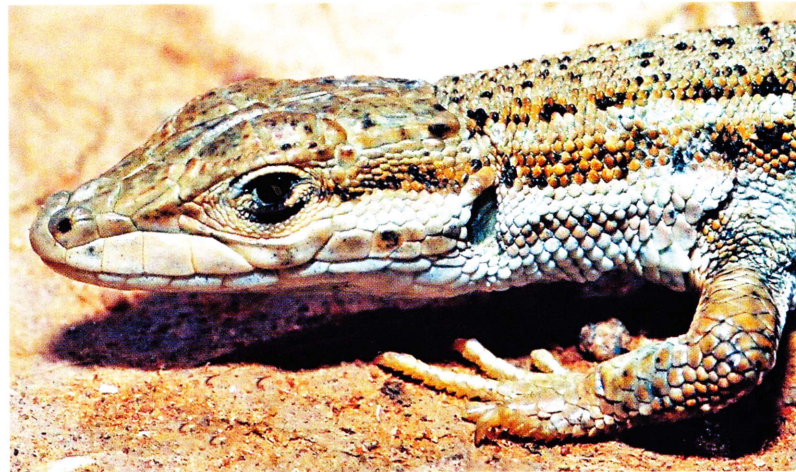
Fig. 512: Portrait of a male Mesalina simoni . 10 km past Chichaoua towards Marrakech. P. GENIEZ

Habitat: Arid, rocky plateaus with sparse vegetation.