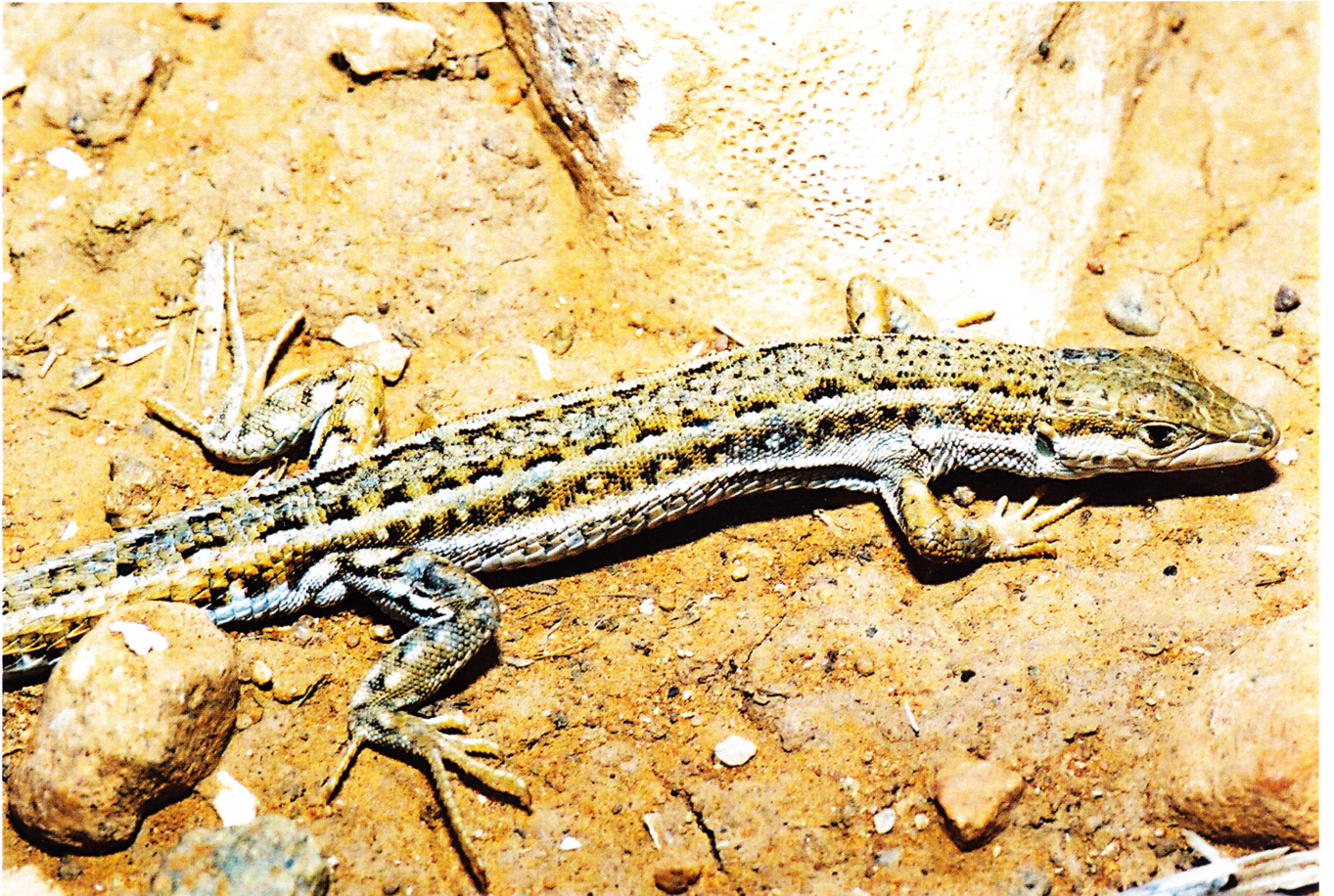
Fig. 513: Mesalina simoni , male. 10 km past Chichaoua towards Marrakech.