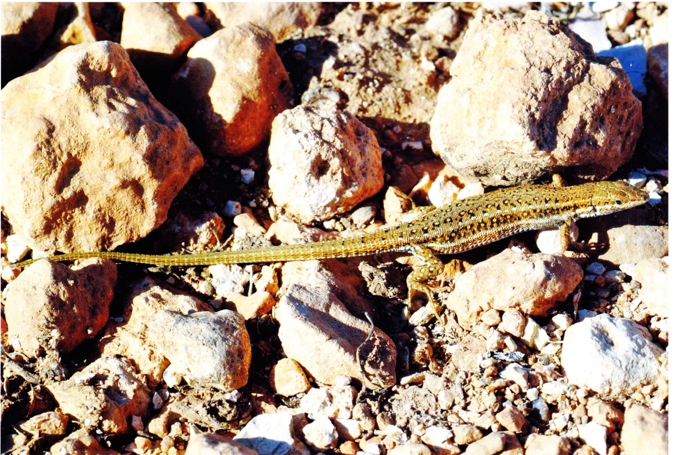
Fig. 514: Mesalina simoni , female. Between Marrakech and Essaouira.