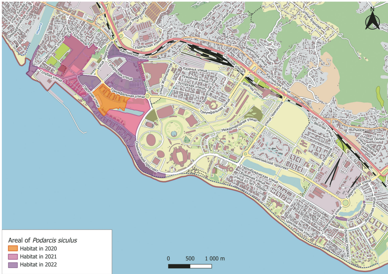
Fig. 3. Monitoring of the range of Podarcis siculus in the Imeretinskaya Lowland of Sochi.

(1.04 km 2 ) (Fig. 3). Lizards were not observed on the area of 65.7 ha of the Imeretinskaya Lowland. An analysis of the expansion of the range in 2021 showed promotion to the east from the Zapovedny Quarter of the “Imeretinsky” Hotel to Olimpiyskiy Avenue and to the south to Parusnaya Street. To the west, the expansion of the distribution is more significant. Having crossed the Morskoy Boulevard, the Italian wall lizard completely mastered the residential quarter adjacent to cluster No. 1 of the Natural Ornithological Park in the Imeretinskaya Lowland. Then it crossed the Perspektivnaya Street settled along the canal, not reaching a short distance from of its confluence with Mzymta River on the street Golubaya. To the northwest, lizards occupied the entire territory of the “Yuzhnye Kultury” park and the surrounding areas up to the Tulpanov Street and Tsvetochhnaya Street. A small isolated cluster occupied in 2021 a narrow strip along Olimpiyskiy Avenue to the Kazachya Street in the northeast. The population density of the species was still high: along the discharge channel, 10 individuals were counted per 100 m of the route; in the “Yuzhnye Kultury”