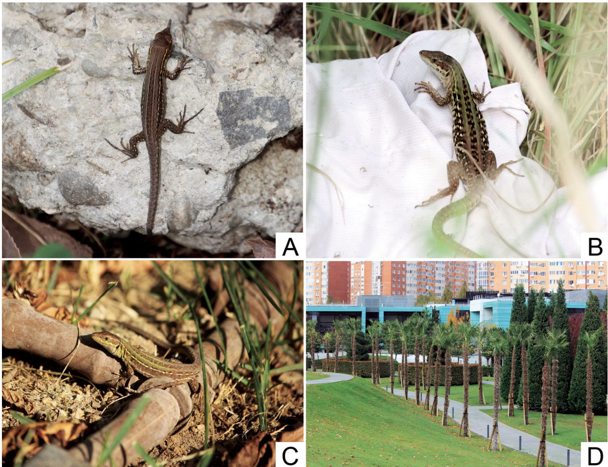
Fig. 4. A, juvenile Podarcis siculus (juvenile coloration) on construction debris — a piece of concrete; B, An adult female P. siculus at a shelter made of household waste; C, P. siculus found for the first time in Krasnodar (juvenile); D, Biotope of P. siculus in Krasnodar — plantations of clipped border of oriental beech near the palm trees and arborvitae in “Krasnodar” park.

The find of P. siculus in city of Krasnodar is of special interest. For the first time, an adult specimen was recorded on April 22, 2022 in the territory of the “Krasnodar” park, in its northern part. Repeated observations on November 5, 2022 allow finding two juveniles, indicating the successful reproduction of the emerging population. Basking of juveniles was recorded on a clear sunny day at an air temperature of about +13°C. Animals were observed near the clipped border of oriental beech ( Fagus orientalis Lipsky) with a drip irrigation system, on the pipes of which they were heated (Fig. 4C). Large cracks were also found under the concrete base of benches and burrows, supposedly wintering places for lizards. Accurate data on the abundance and distribution of P. siculus in the territory of Krasnodar are not yet available due to a recent discovery. However, the presence of juvenils indicates that the lizards have success-