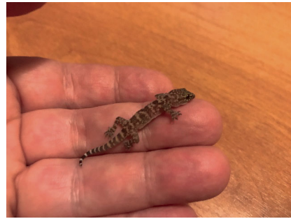
Fig. 2. New find of Hemidactylus turcicus in Sochi (26.11.2021).

At the time of the discovery of Hemidactylus turcicus in Sochi in 2011 at the site of abandoned Turkish warehouses, it was believed that the micropopulation numbered about 45 specimens. The young individuals observed annually until 2017 confirmed the success of reproduction and maintenance of the population. Our new record of a juvenile in the fall of 2021 confirmed the successful existence of this species in Sochi. It also indicates a slight expansion of the range, about 1 km east of the original find site.