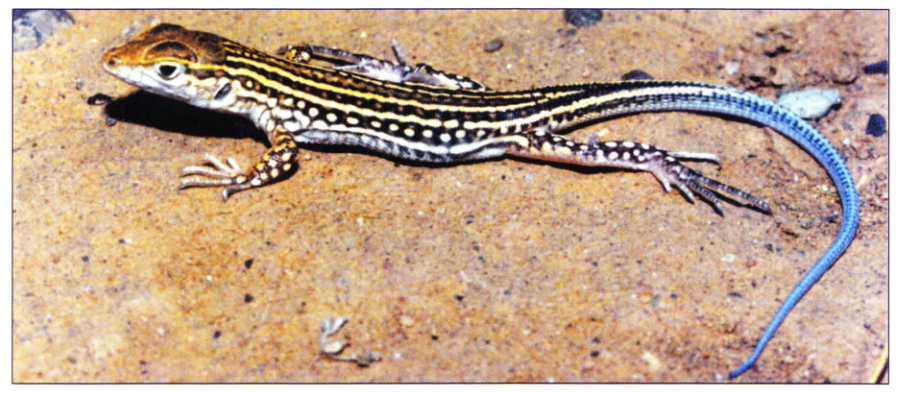
Photo 110: Acanthodactylus busacki hatchling. 16 km from the road Taroudant–Ouarzazate towards Irherm. P. Geniez