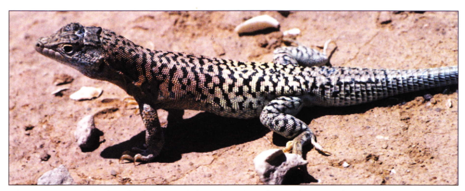
Photo 108: Acanthodactylus busacki adult male in breeding colours. 22 km south-west from Tantan-Plage towards Tarfaya (Morocco). M. Geniez