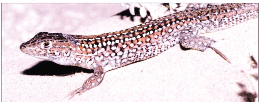
Photo 109: Acanthodactylus busacki adult male. 9 km north of Tamri towards Essaouira (Morocco). This is the northernmost known record for this species. P. Geniez