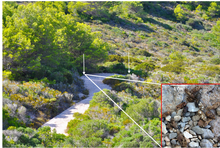
Fig. 2 The scat pile found in Cabrera Island. White arrows indicate the limits of the narrow scat pile (see dimensions in the text). Behind the left turn of the track, we can see a slope densely covered by malacophyllous shrubs, including Juniperus phoenicea . On the lower right corner, a detail of the accumulation of faeces, with 16 scats in a very reduced area

diet description because of the use of small sample sizes and a limited geographical coverage present in previous studies [15].