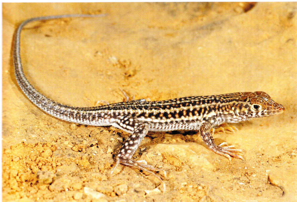
Fig. 207: Acanthodactylus boskianus juvenile, southern Oman.