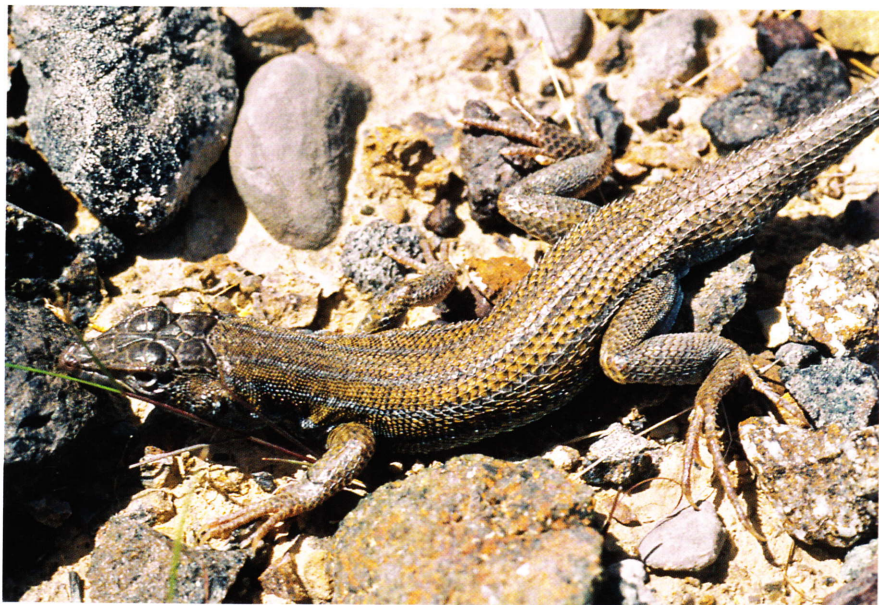
Fig. 208: Acanthodactylus boskianus , Yanqul, Ad Dhahirah, Oman.