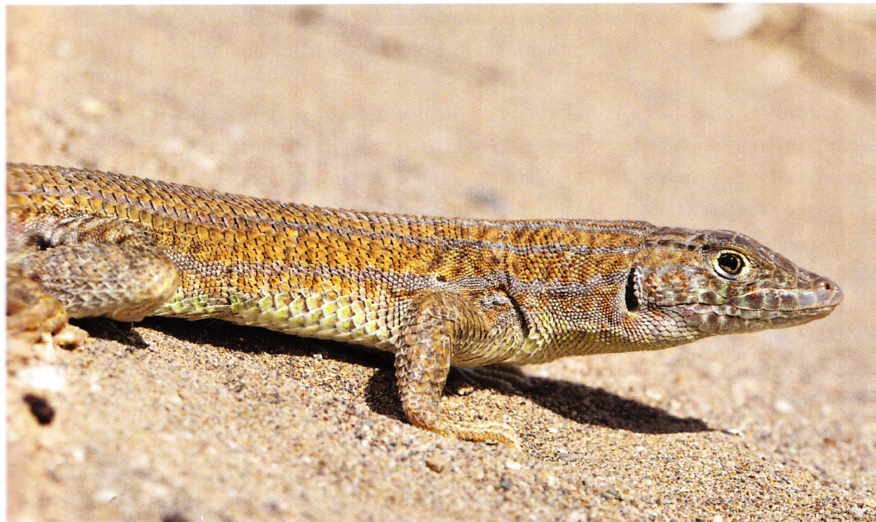
Fig. 206: Acanthodactylus boskianus male, Ad Dakhiliyah, Oman.