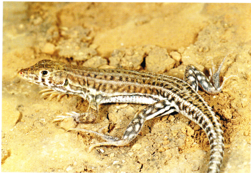
Fig. 209: Acanthodactylus felicis , Dhofar, Oman.