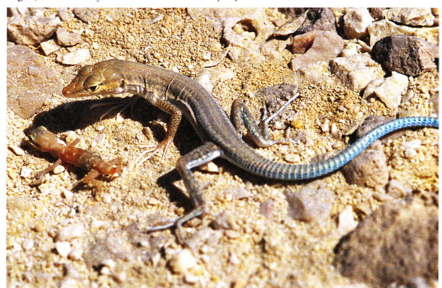
Fig. 232: Mesalina ayunensis from Wadi Ash Shuwaymiyah, Dhofar, Oman predating Tropiocolotes scorteccii.