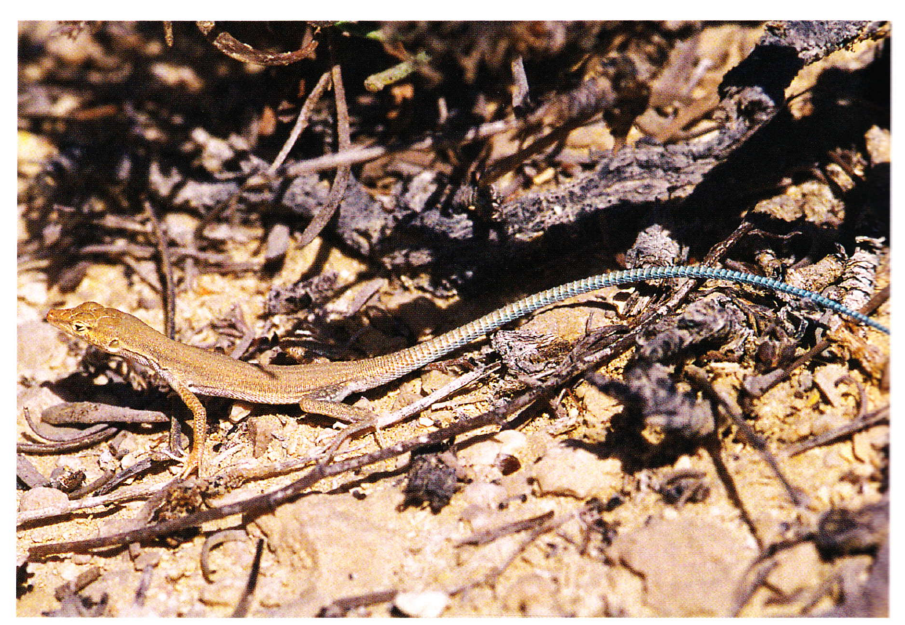
Fig. 231: Mesalina ayunensis, Wadi Ash Shuwaymiyah, Dhofar, Oman.