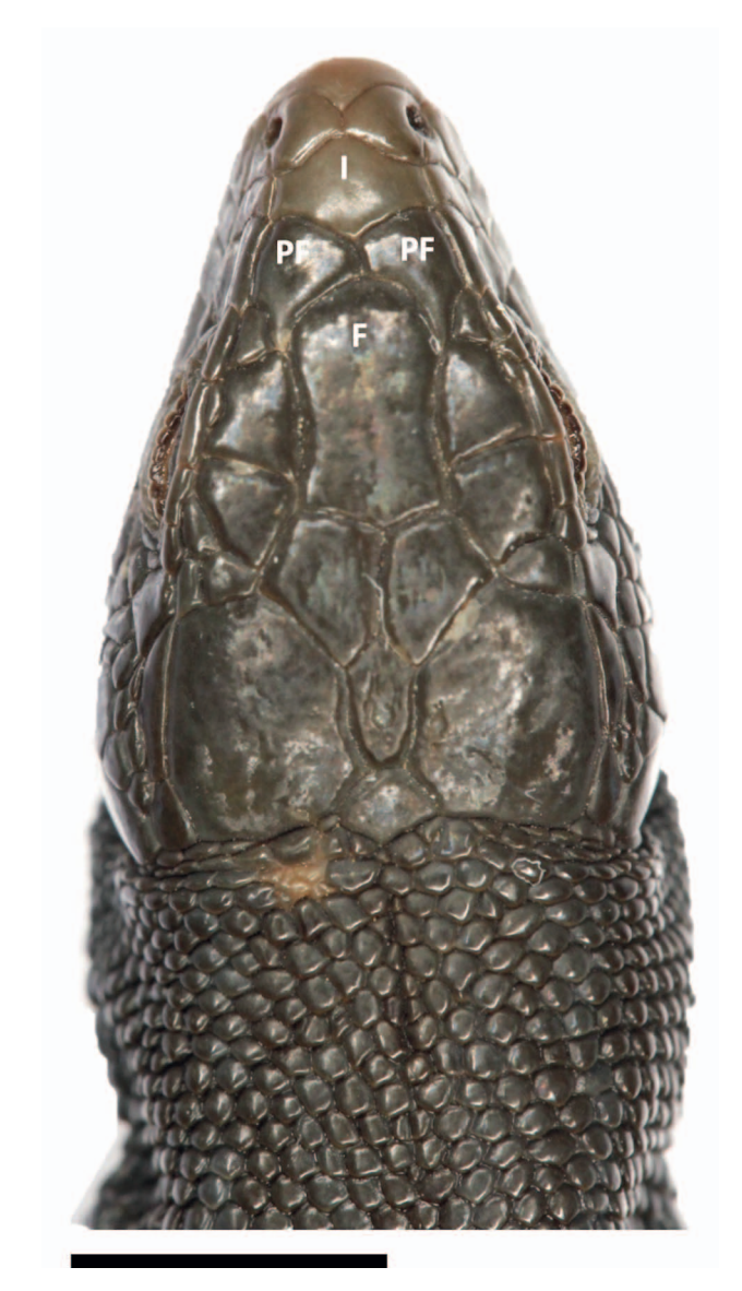
Figure 1. Dorsal view of the head of a melanistic female viviparous lizard, Zootoca vivipara (SMNS 15218), exhibiting pileus scale-type A after VOIPIO (1992). I = internasal, PF = prefrontals, F = frontals. Scale bar: 5 mm.

A total of 48 viviparous lizards Zootoca vivipara were obtained from pitfall traps between April and October at the study site at the Wurzacher Ried. We found a high rate of melanistic lizards (overall proportion of 33%) distributed across all age classes, but mostly among adults (see Table 1). Regardless of their polychromatism all lizards shared pileus scale-type A (after VOIPIO 1992), i.e., the in-