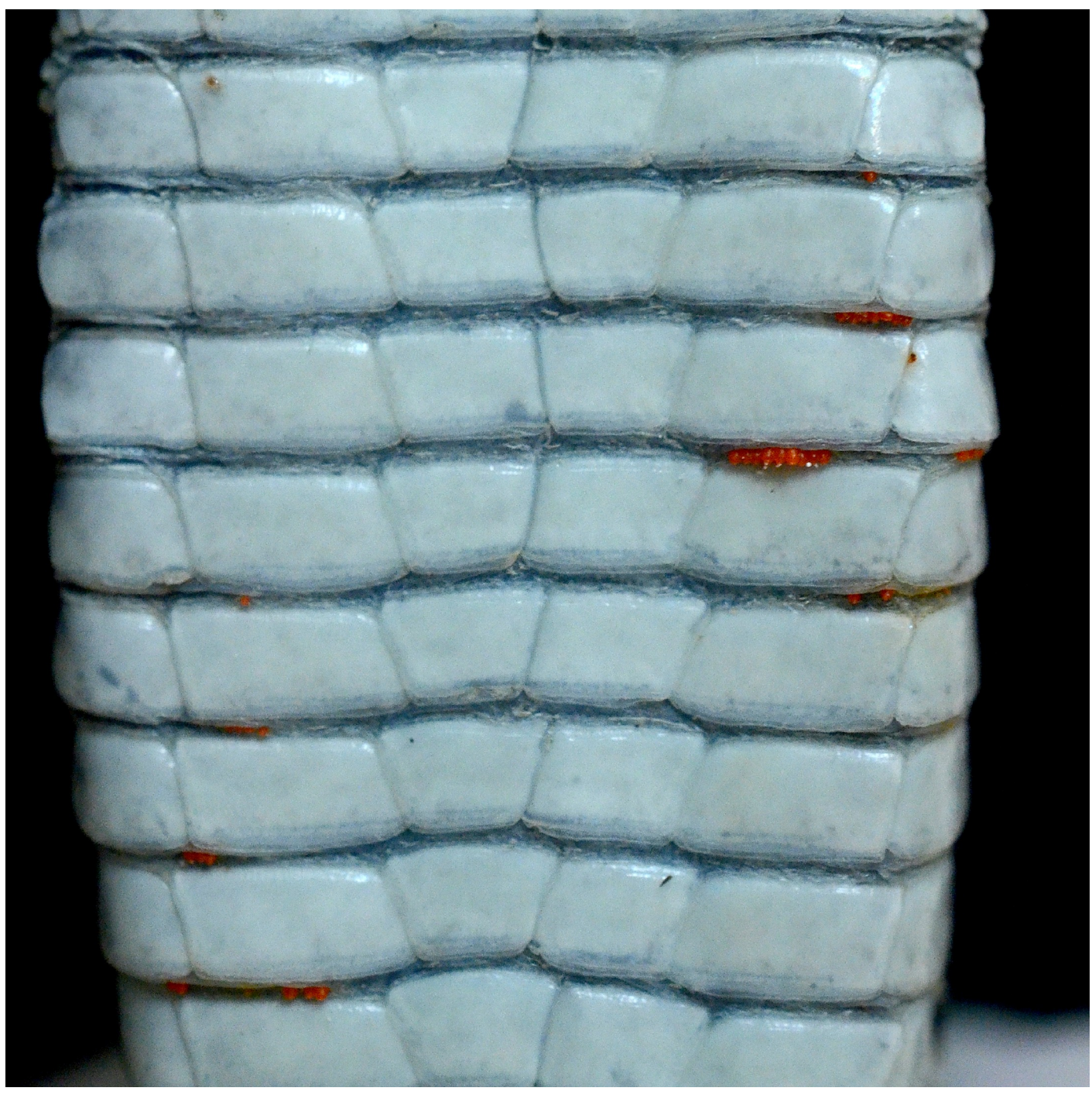
Fig 2. Neotrombicula autumanlis larvae in the ventral region of adult Podarcis siculus.

https://doi.org/10.1371/journal.pntd.0009090.g002