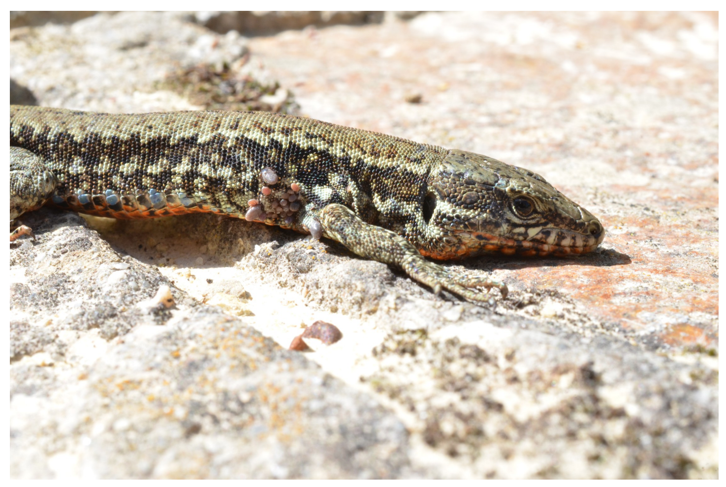
Fig 1. Ixodes ricinus larvae and nymphs in the axillary region of adult Podarcis muralis.

Of the snakes (n = 4; 2 Elaphe quatuorlineata , 1 Hierophis carbonarius , 1 Natrix natrix ) and lizards (n = 128; 5 Lacerta viridis , 15 Podarcis muralis , 106 Podarcis siculus , 2 Tarentola maurita nica ) captured in site 1, 94.7% (125/132) were infested with mites and ticks. In particular, 123 (93.2%) (1 E. quatuorlineata , 5 L. viridis , 15 P. muralis , 102 P. siculus ) reptiles were infested with I. ricinus (Fig 1) and/or N. autumnalis (Fig 2). Only lizards (n = 40; 1 P. muralis , 29 P. siculus , 10 T. mauritanica ) were captured in site 2, with 37 (92.6%) (1 P. muralis , 29 P. siculus , 9 T. mauritanica ) of them being infested with mites and, particularly, 10 P. siculus (25%) by N. autumnalis . The mean intensity (5.5, 95% CI: 5.4–6.2%) and abundance (5, 95% CI: 4.45–5.6%) were calculated on a total of 120 reptiles from site 1, which were infested with I. ricinus .