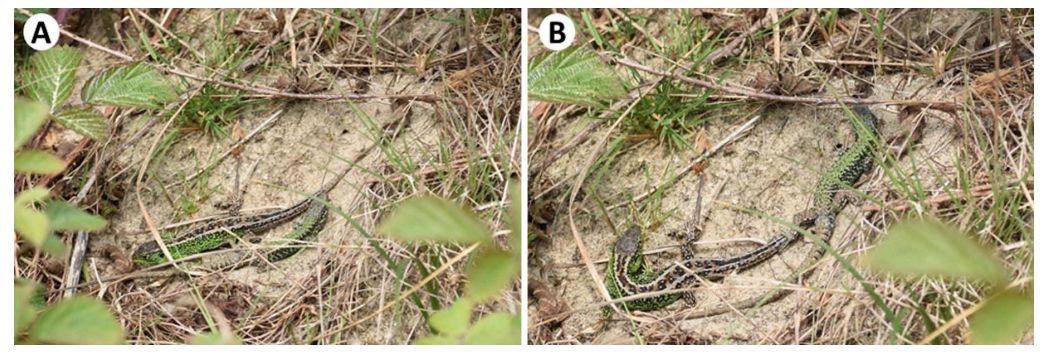
Figures 1A & B. Initial interactions between a male L. agilis and P. muralis - A. The male L. agilis has arrived to lie parallel to the basking P. muralis , B. The male P. muralis begins to move away

The sand lizard then followed after the wall lizard which was moving away slowly. The larger sand lizard then grasped the tail of the other lizard in its jaws, about 3 cm from the tail tip. The wall lizard continued on for another couple of paces and appeared to be dragging the sand lizard along behind it before turning back down the slope to face towards its attacker (Figs. 2A & B).