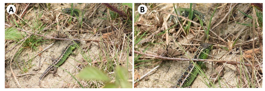
Figures 2A & B. Further interaction between the male L. agilis and P. muralis - A. The male L. agilis chases after the male P. muralis and grasps its tail, B. The male P. muralis turns to face the L. agilis