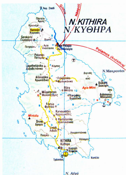
Fig. 1: Map of the Ionian Island of Kythera (Greece).