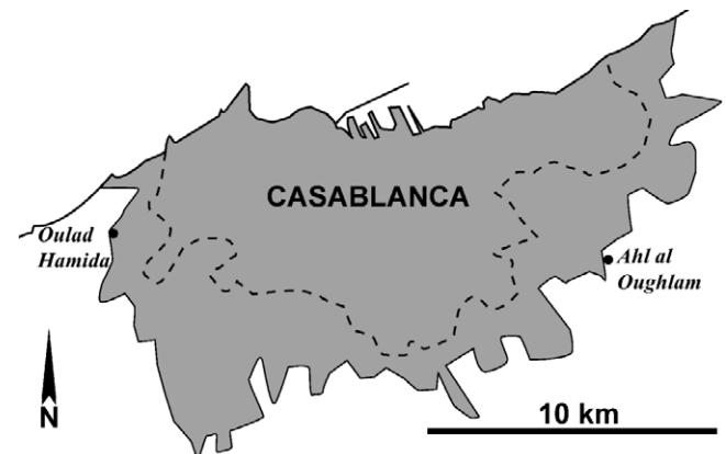
Figure 1. Sketch map of the Casablanca urbanized area (from Google Earth, 2006), with the location of Ahl al Oughlam (33°34'11"N, 07°30'44"W), and Thomas-Oulad Hamida quarries (33°34'06"N, 07°42'00"W). Dashed line = outline of Casablanca around 1985.

Primates: Theropithecus atlanticus was first defined upon a single molar from the Algerian site of Aïn Jourdel. The AaO sample, although consisting mostly of isolated teeth, helps clarify its differences from the East and South African T. darti (Alemseged & Geraads, 1998). Macaca sp. is here shown, for the first time, to coexist with the former genus.