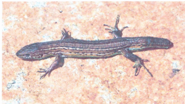
Tropidosaura montana natalensis —Highmoor, Drakensberg, KZN