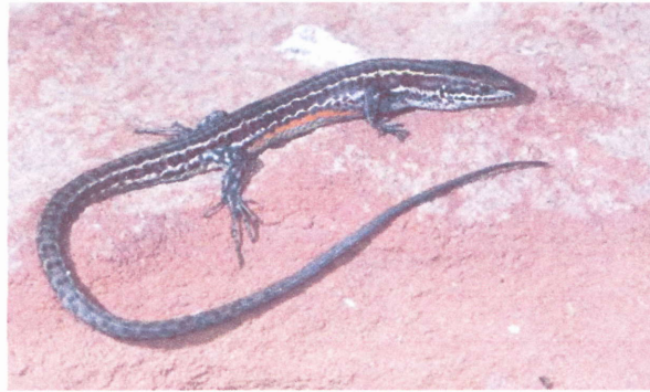
Tropidosaura montana montana —WC

Conservation measures: None recommended.