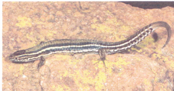
Tropidosaura montana rangeri —Asante Sana GR, EC