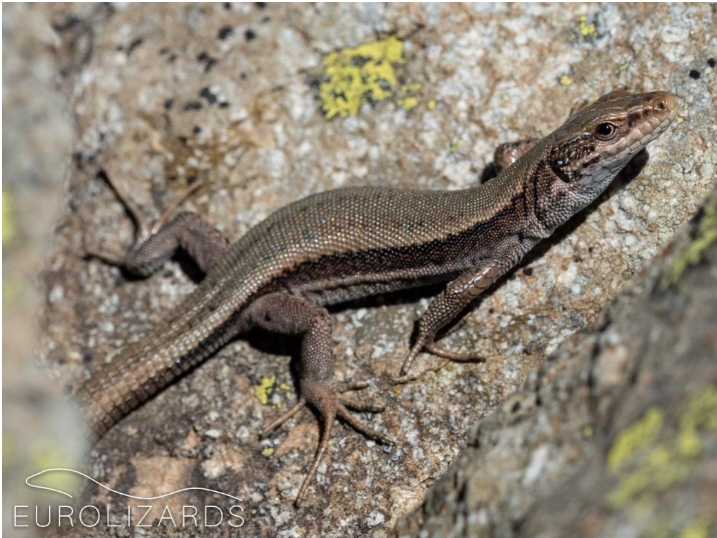
Female: F / Hautes-Pyrénées, 22.08.2016 - Females usually have unspotted labials.