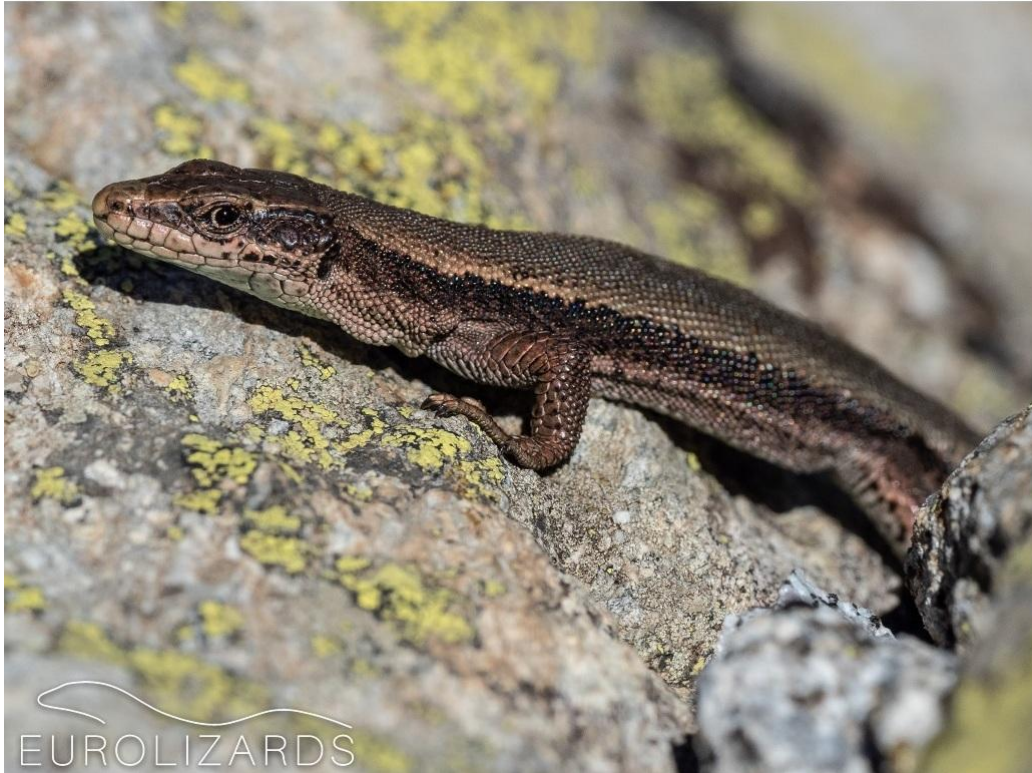
Male: F / Hautes-Pyrénées, 22.08.2016 - Males show bronze-coloured backs.

Iberolacerta bonnali has not the easiest life: As a high altitude mountain lizard it inhabits areas up to 3000 meters which only allow a short activity phase in summer. However, it has to compete against Podarcis muralis , which seems to occupy the habitats with more favorable microclimate. Moreover, it faces potential predation pressure by Vipera aspis which also occurs in its biotopes.