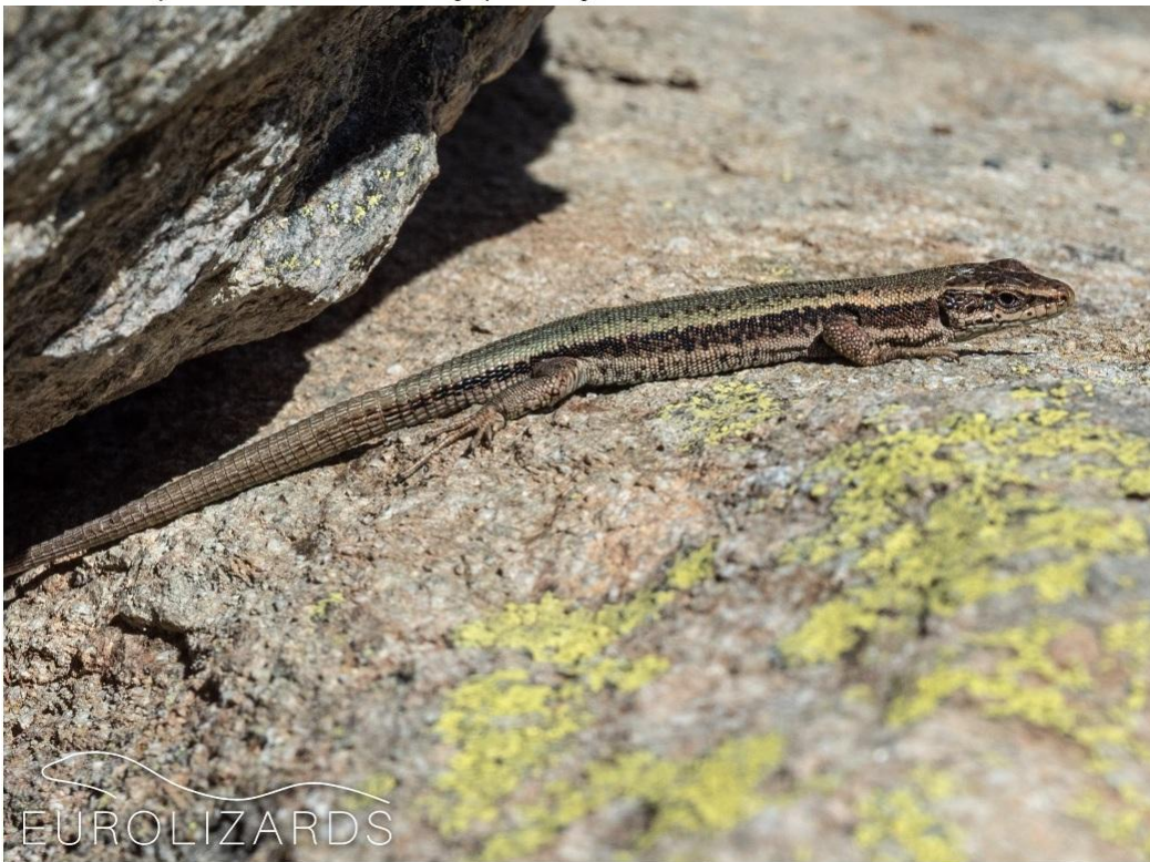
Male: F / Hautes-Pyrénées, 22.08.2016 - Males show slightly reddish legs.