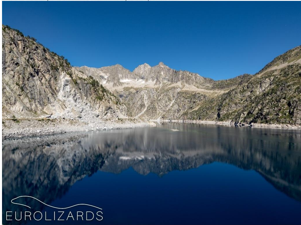
The shores of Lac de Cap de Long (F / Hautes-Pyrénées): Habitat of Iberolacerta bonnali.