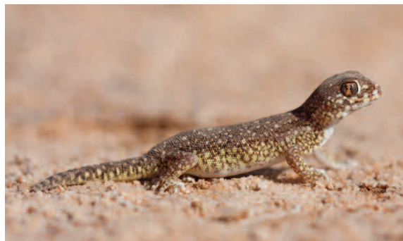
Figure 2. A specimen of Stenodactylus sthenodactylus from El Bessila (Kneiss Archipelago).

Previously recorded for El Gataïa El Bahria by Tlili (2003), although this locality has not been successively mentioned by Tlili et al. (2012b). The species (Fig. 2) has not been detected on the islet during our survey, but several habitats seem to be potentially suitable for this gecko, which is characterized by nocturnal activity and elusive behavior. One specimen was instead found in a diurnal shelter at El Bessila, despite the nocturnal survey we performed. This observation represents the first record of the species for the Kneiss Archipelago. On this islet S. sthenodactylus seems however rare