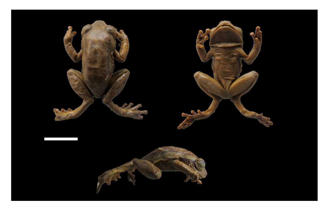
Figure 4. Dorsal and ventral view of the holotype Rappia fasciata Ferreira, 1906 (MHNFCP 017294). Scale bar = 10 mm.

The holotype of Rappia fasciata presents characters that allow it to be identified specifically as the pleurotaenia morph of H. platyceps (Frétey et al. , 2011; Amiet 2012). These characters include its stout body, large head with a rounded snout, and prominent dorsolateral stripes. Amiet (2012) used both the wider head and shorter snout of H. platyceps as diagnostic features relative to H. cinnamomeoventris , and both characteristics are present in the holotype of Rappia fasciata . As also indicated by Amiet (2012), the flattened granulations on the palmar and plantar surfaces also indicate that the holotype is more similar to H. platyceps than H. cinnamomeoventris .