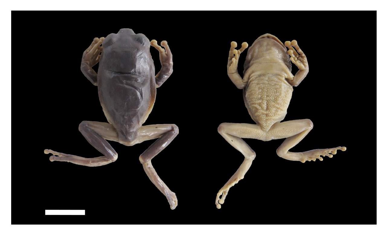
Figure 9. Dorsal and ventral views of the holotype of Hylambates bocagei var. leucopunctata Ferreira, 1906 (MHNFCP 017324). Scale bar = 10 mm.

on our examination, the principal morphological feature suggesting that "var. leucopunctacta " is distinctive is the expansion of the terminal disks of the fingers, as noted by Ferreira (1904). While suggestive given the typically non-expanded digits of Leptopelis bocagii , the absence of interdigital webbing clearly places the remaining syntype with this species. In addition, the geographic distribution of Ferreira's taxon occurs on the northwestern margin of the wide geographic range of L. bocagii . Based on available evidence, we follow Amiet (2012) and Frétey et al. (2011) by suggesting that Hylambates bocagei var. leucopunctata should remain a synonym of L. bocagii .