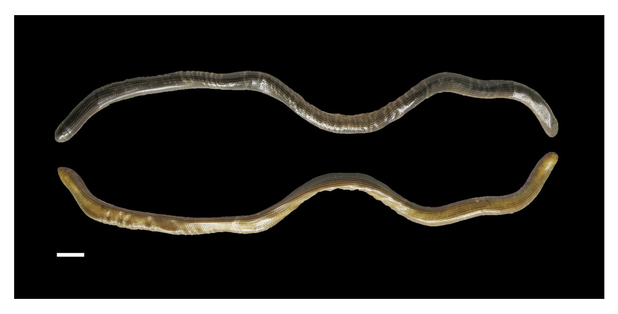
Figure 11. Dorsal and ventral views of the paratype of Typhlops boulengeri Bocage, 1893 (MHNFCP 017434). Scale bar = 10 mm.

Type specimen. A syntype (MHNFCP 017434) from Angola (fig. 11) was donated to the Porto museum from Lisbon. This is supported by the original label on the jar (" Typhlops boulengeri Boc. / Angola off. Mus. Boc.") and the fact that the catalog notes that the specimen MHNFCP 017434 was offered by Museu Bocage (L. Sousa, pers. comm.). In his description of this species, Bocage (1893) noted that he received several specimens of this species from Quindumbo, "dans l'intérieur de Benguella" that were collected by the explorer José de Anchieta.