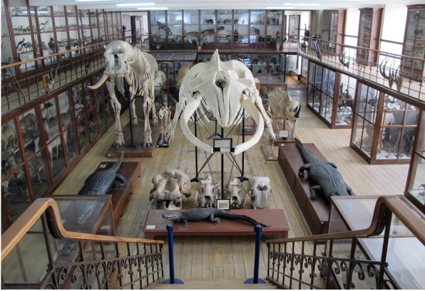
Figure 2. Picture of the General room of the Museu de História Natural da Universidade do Porto at the beginning of the twentieth century (left) and actual picture of the same room (right).