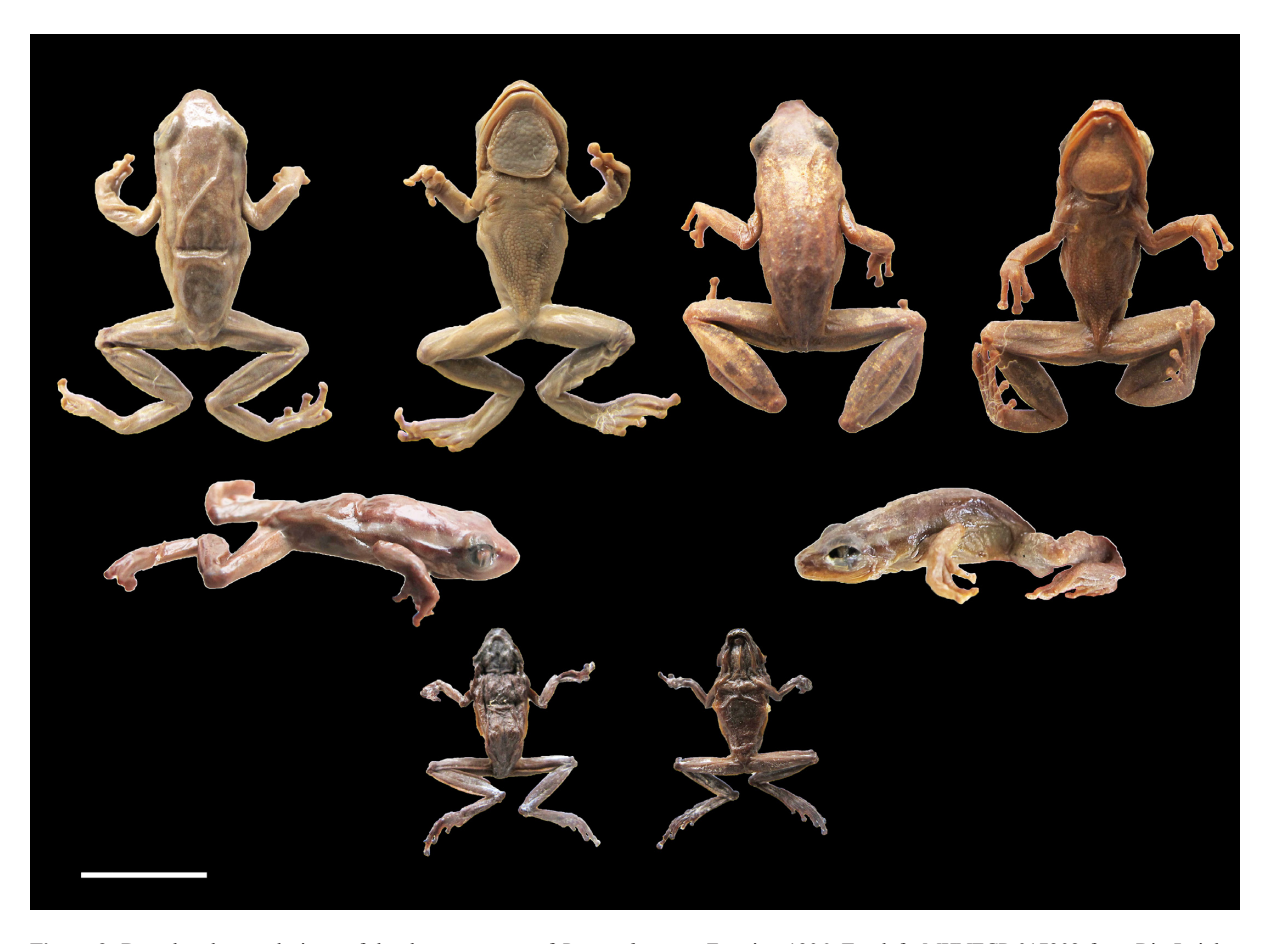
Figure 3 . Dorsal and ventral views of the three syntypes of Rappia bivittata Ferreira, 1906. Top left: MHNFCP 017302 from Rio Luinha, Angola. Top right: dorsal and ventral views of MHNFCP 017291 from N'golla Bumba, Angola. Below: Dorsal and ventral views of MHNFCP 017296, which is in poor condition because of past dehydration, from, Quilombo, Angola. Scale bar = 10 mm.

Present name. Hyperolius platyceps (Boulenger, 1900).