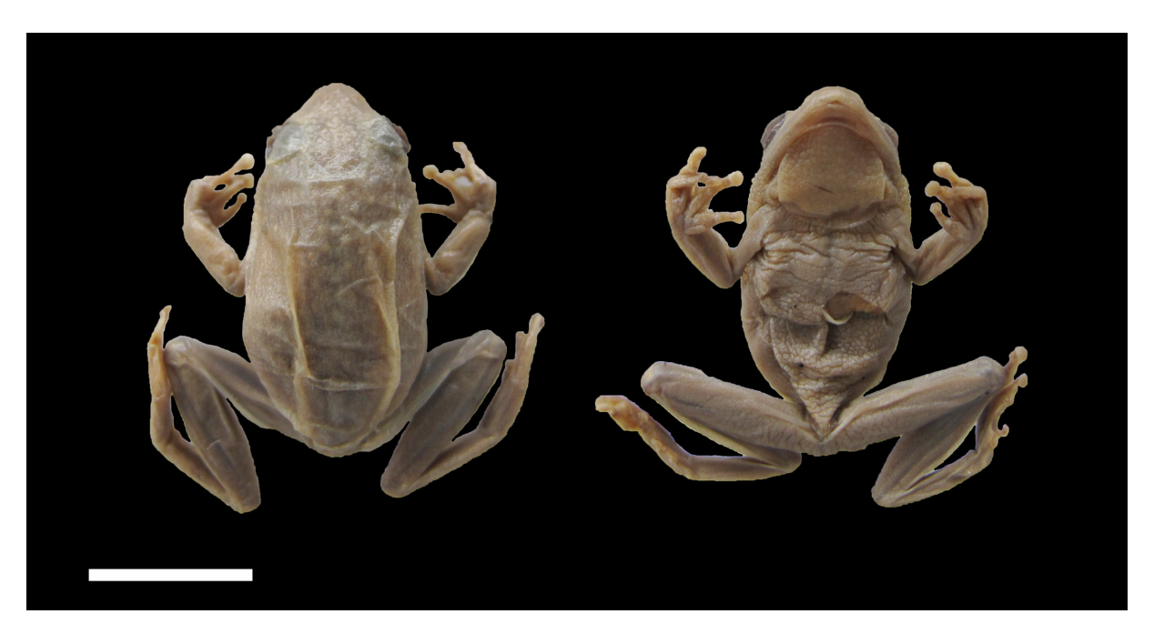
Figure 8. Dorsal and ventral views of the syntype of Rappia seabrai Ferreira, 1906 (MHNFCP 018587). Scale bar = 10 mm.

Present name. Hyperolius bocagei (Steindachner, 1867).