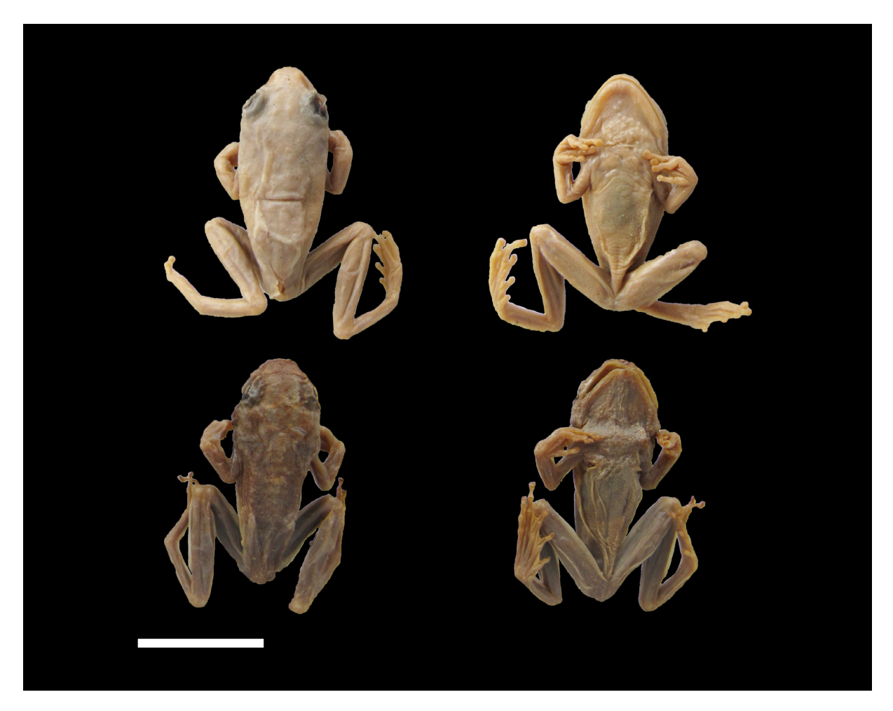
Figure 5 . Dorsal and ventral view of the two syntypes of Rappia nobrei Ferreira, 1904 (Top specimen: MHNFCP 017292; lower specimen: MHNFCP 017298). Scale bar = 10 mm.

Present name. Hyperolius cf. adspersus Peters, 1877.