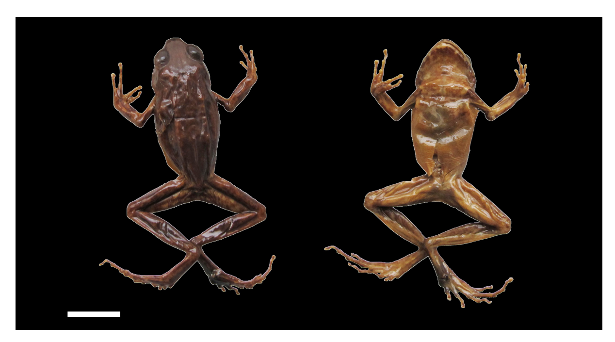
Figure 10. Dorsal and ventral views of the holotype of Arthroleptis carquejai Ferreira, 1906 (MHNFCP 018586). Scale bar = 10 mm.