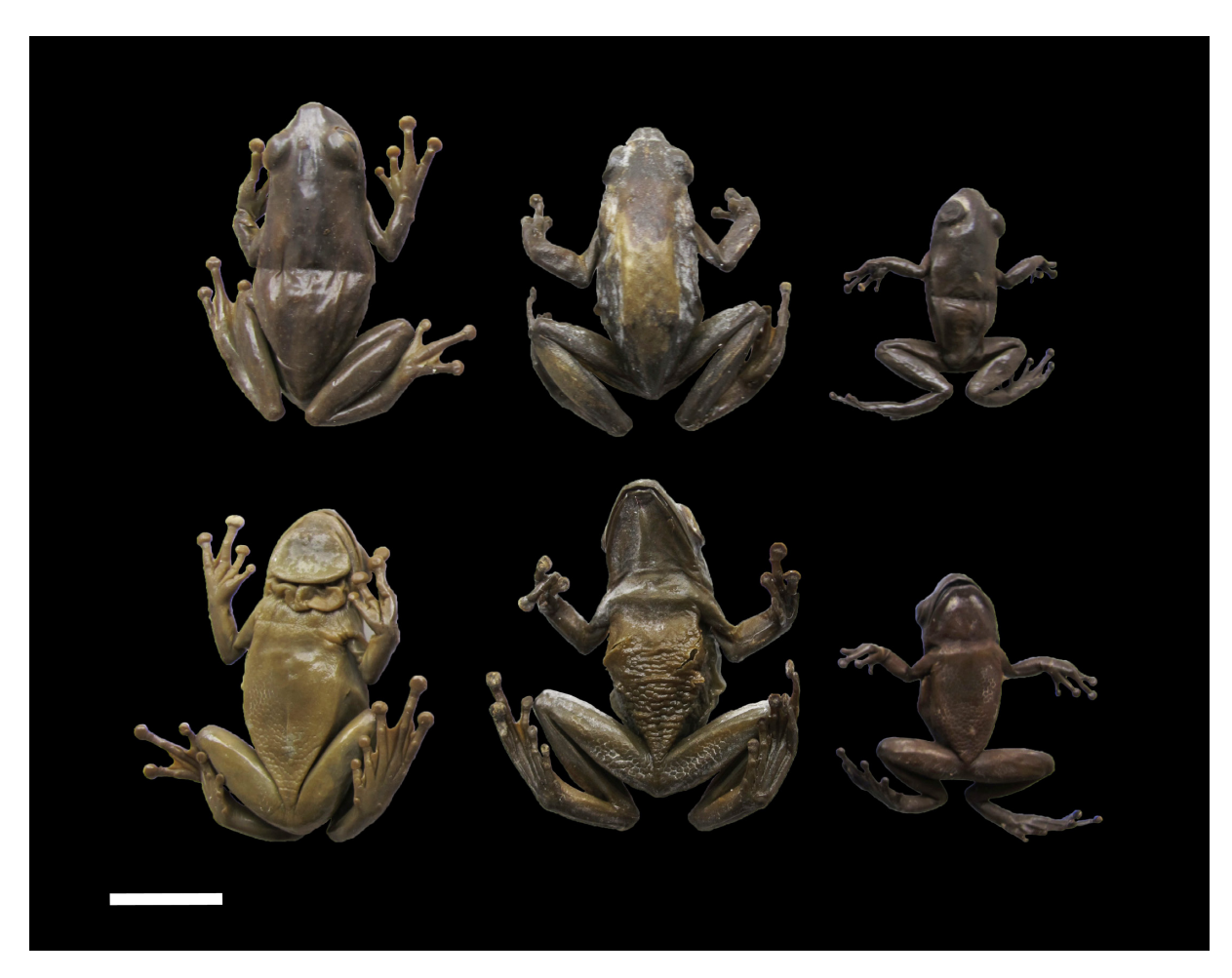
Figure 6 . Dorsal and ventral views of the syntypes of Rappia osorioi Ferreira, 1906 (catalogued as a lot, MHNFCP 017307). Scale bar = 10 mm.