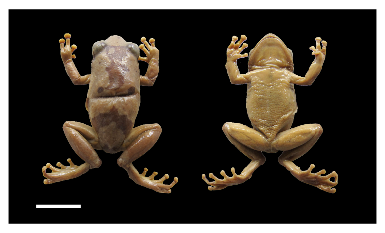
Figure 7. Dorsal and ventral views of the syntype of Rappia platyceps var. angolensis Ferreira, 1906 (MHNFCP 017303). Scale bar = 10 mm.