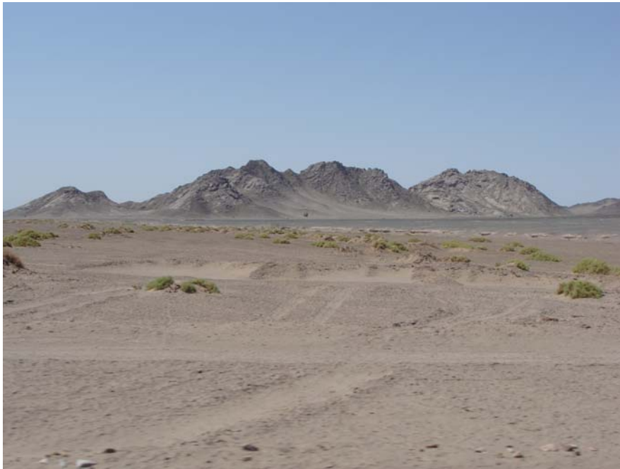
FIGURE 1. Habitat of Lacerta mostoufi in the Deh Salm village, 50 km Southwest of Nehbandan, South Khorasan province, Iran.