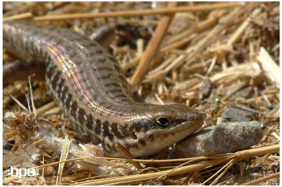
Close and in situ! Trachylepis aurata..