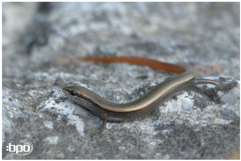
A juvenile Ablepharus kitaibelii with read tail

...und another juvenile on a blade of grass