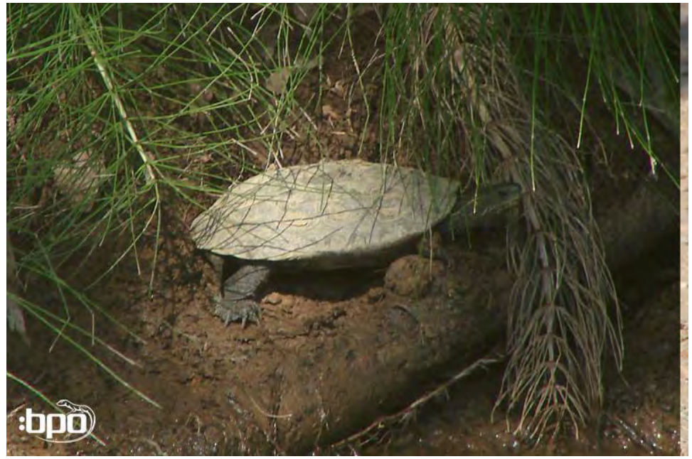
Mauremys rivulata – rapidly disappearing in the water

Lacerta trilineata appeared rather secretive, we saw very few sun-basking specimen