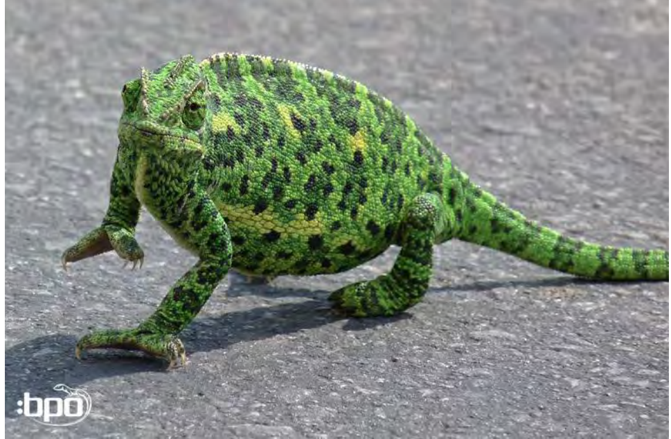
A beautiful Chamaeleo chamaeleon crossing the road...