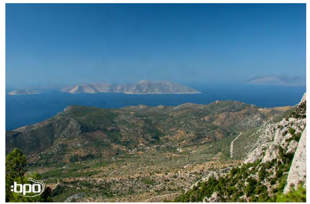
View to the islands of Agios Minas, Fourni und Ikaria (I. to r.)

Searching for chameleons, we went to another location. This excursion was the highlight of our trip! At the very beginning, a chameleon crossed our way. Aside from numerous O. elegans we subsequently photographed– Testudo graeca, Hemidactylus turcicus and Lacerta trilineata. At a few water wholes, we noticed some sun-basking Mauremys rivulata.