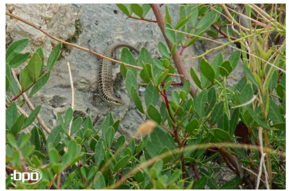
Trachylepis aurata seems to be common on Samos but it is quite secretive in late summer