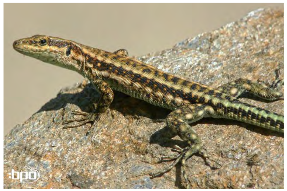
Farewell to Samos: Anatololacerta anatolica