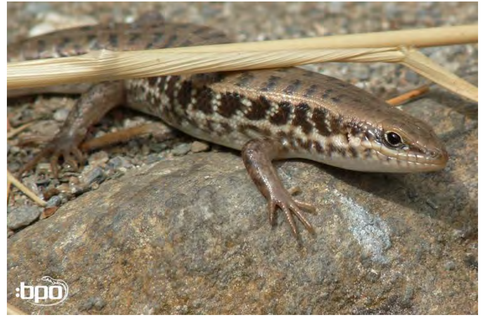
...we could take several pictures...