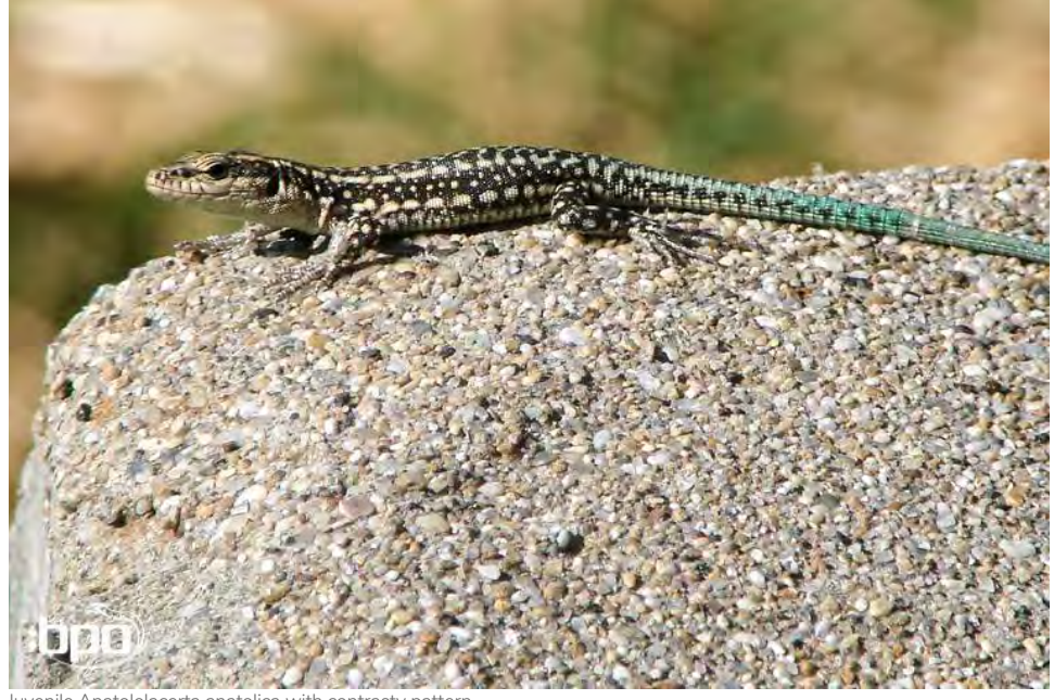
Juvenile Anatololacerta anatolica with contrasty pattern