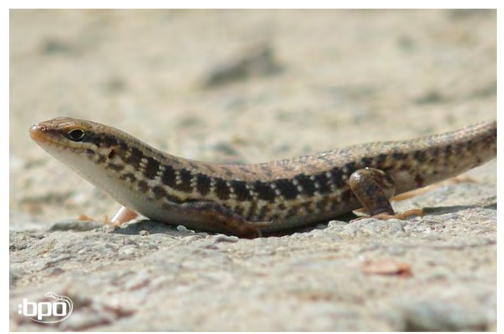
For us, Trachylepis aurata is one of the most beautiful lizards in Europe!