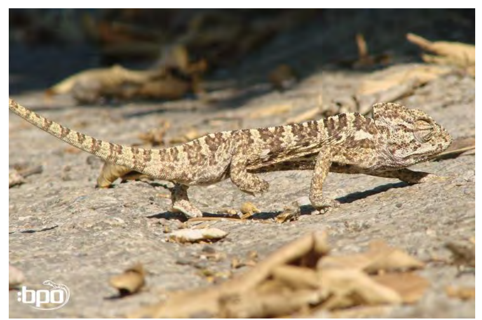
According to the pale, sun-baked landscape, the chameleons showed a greyish colouration