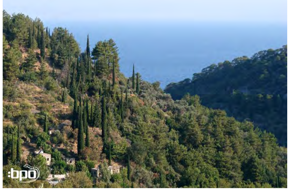
Another trip in the northern part of the island brought success...