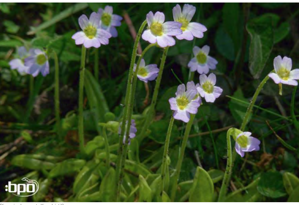
Pinguicula crystallina hirtiflora