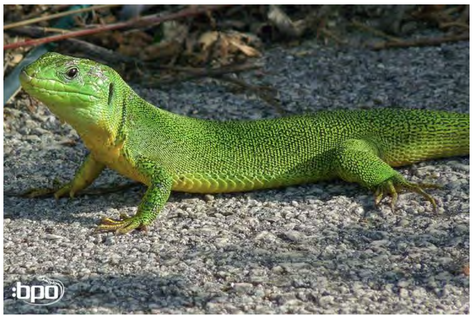
In Greece, Lacerta trilineata major can only be found at the west coast