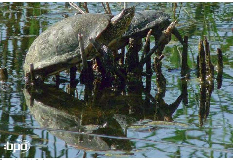
Emys orbicularis hellenic