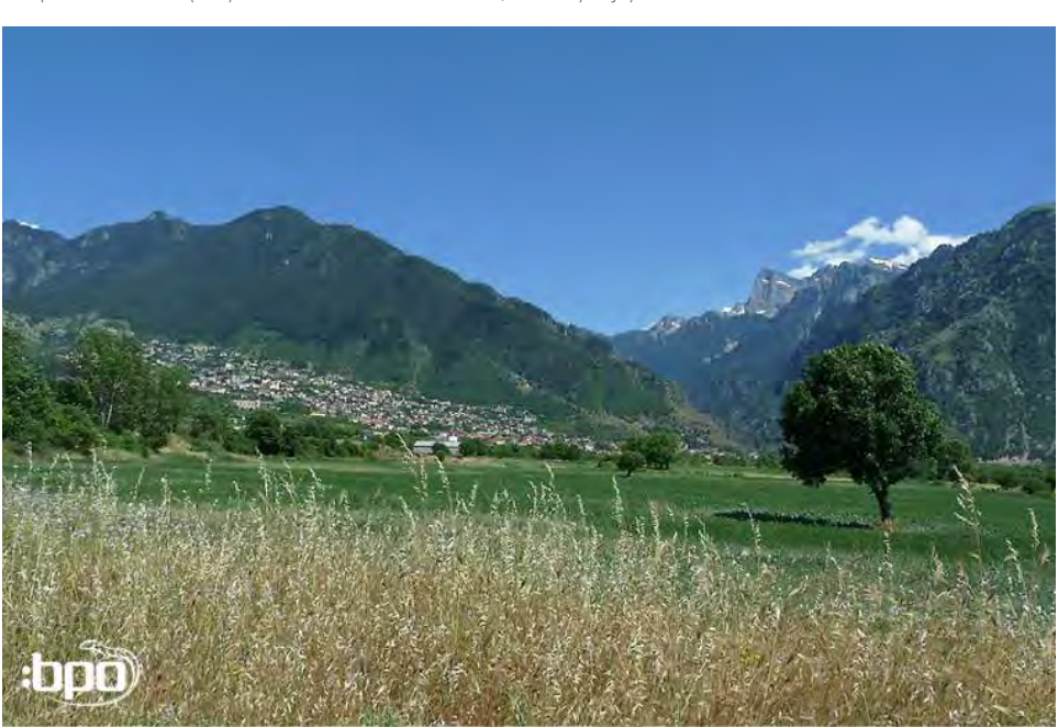
The village of Konitsa at the western foothills of the Smolikas range

Konitsa is a good starting point for trips to the Smolikas: it's a busy place with some hotels and a basic infrastructure with shops and filling stations. The area beyond is sparsely populated with endless forests and mountain ranges – for us this is one of the highlights in Greece. Due to the completion of the motorway across the Pindos, there is now hardly any traffic on the quite scenic route (E90) from Konitsa to Siatista. Hence, we really enjoyed our excursion in that area.