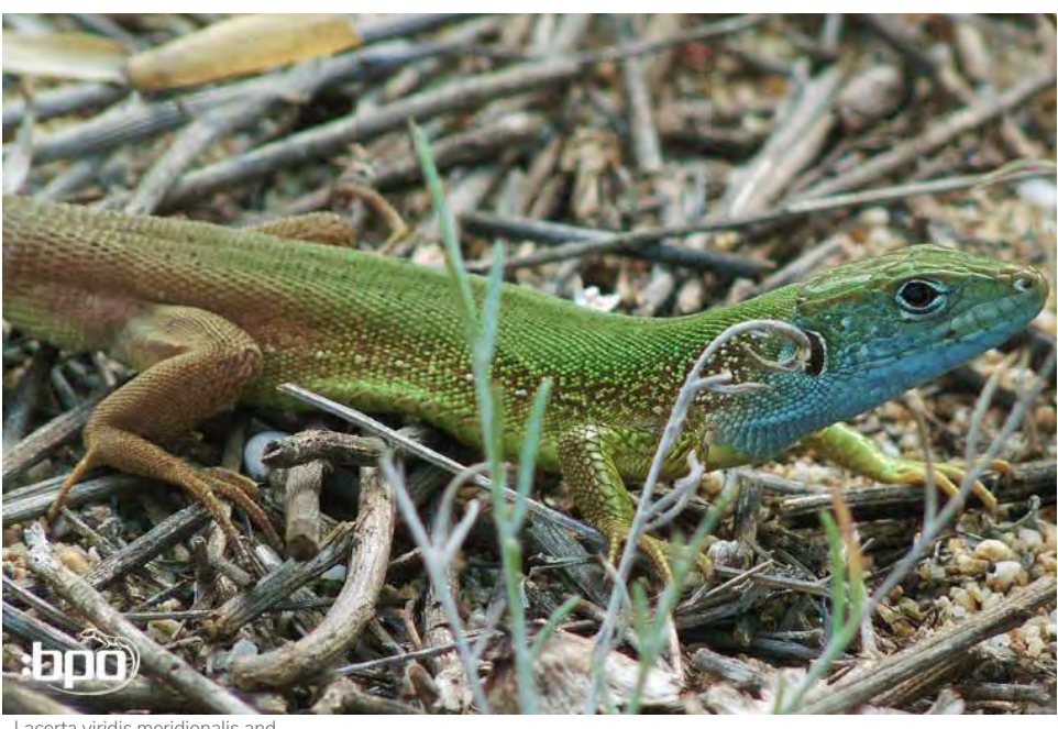
...Lacerta viridis meridionalis and...