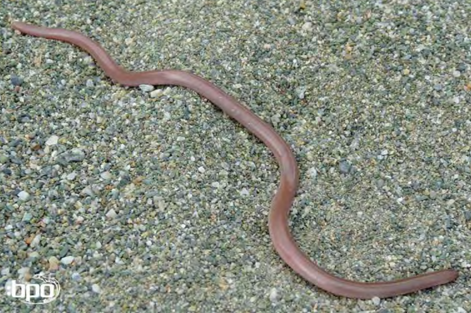
At the seashore we found Typhlops vermicularis and