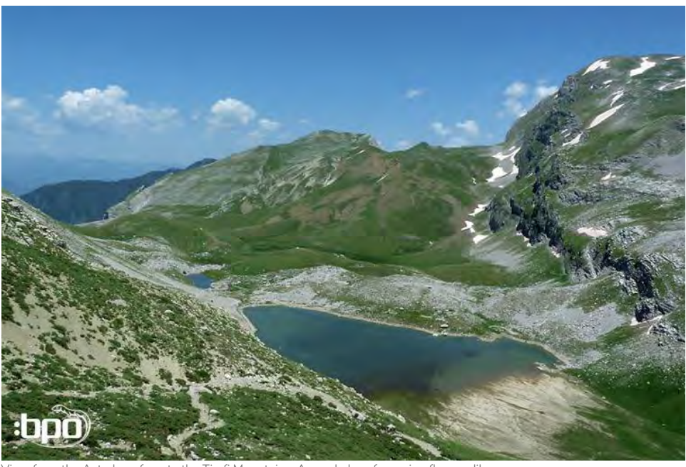
View from the Astraka refuge to the Timfi Mountains: A good place for spring flowers like...