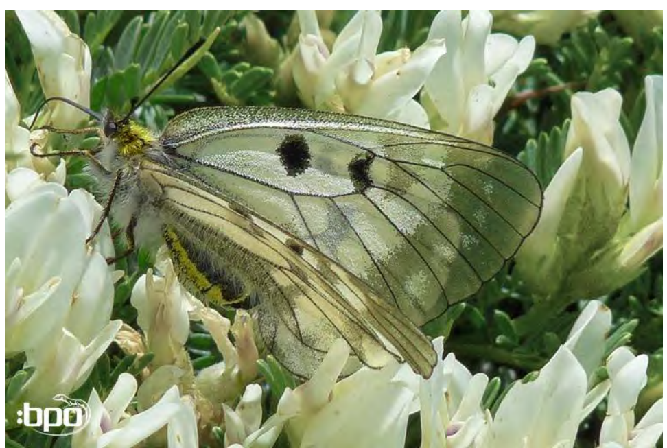
Parnassius mnemosyne on Astragalus angustifolius