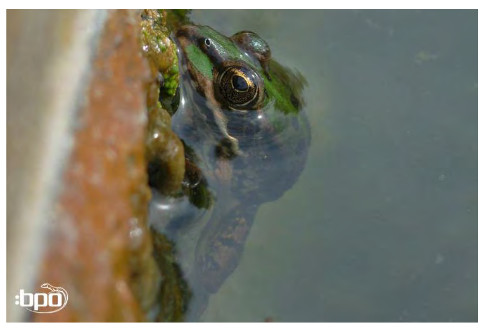
Pelophylax kurtmuelleri in a cattle watering tank