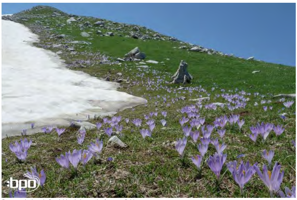
Crocus veluchensis flourishing in beneath of a snowfield