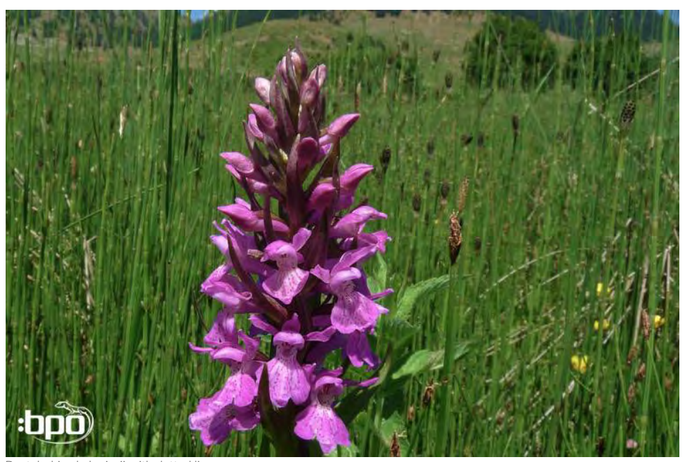
Dactylorhiza kalopissii with dotted lip