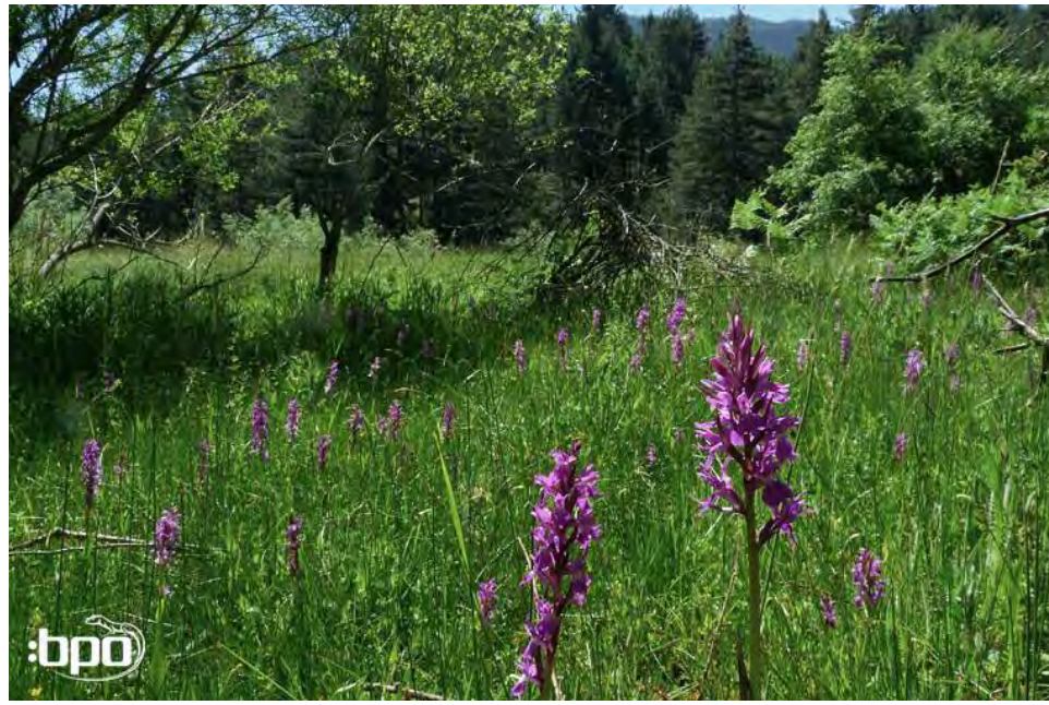
Marshy meadow with Dactylorhiza saccifera and other Dactylorhiza species