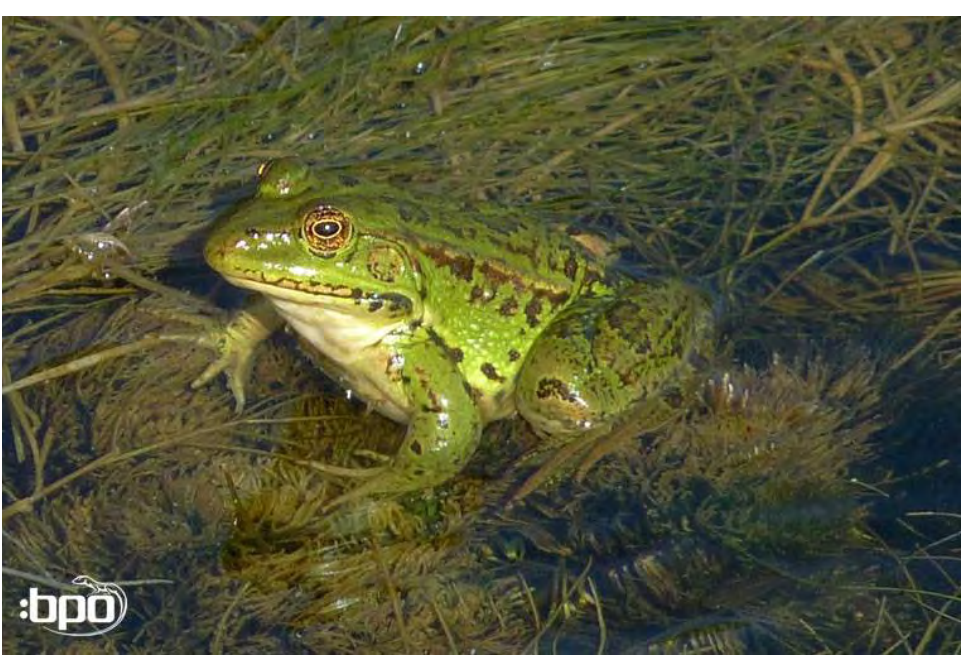
Pelophylax sp (ridibundus or epeiroticus)