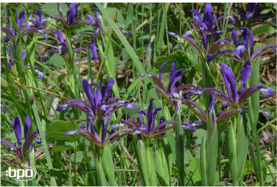
At lower altitudes in the Pindos mountains: Iris sintenisi