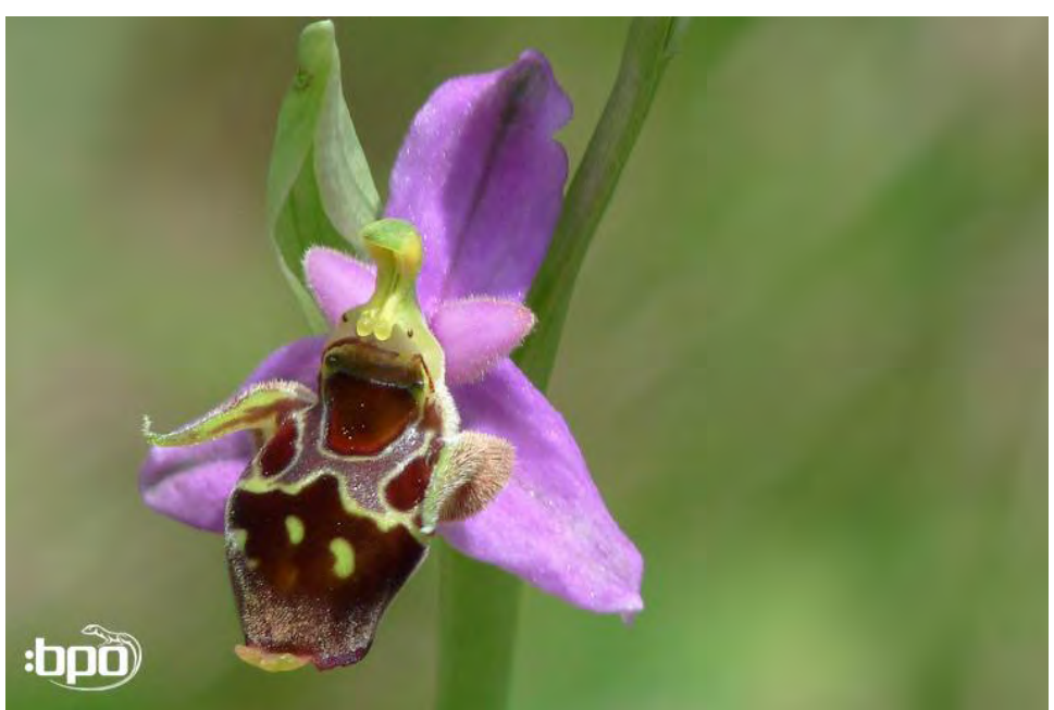
Ophrys cerastes: note the hairless inner sides of the lateral lobes, separating this species from O. oestrifera