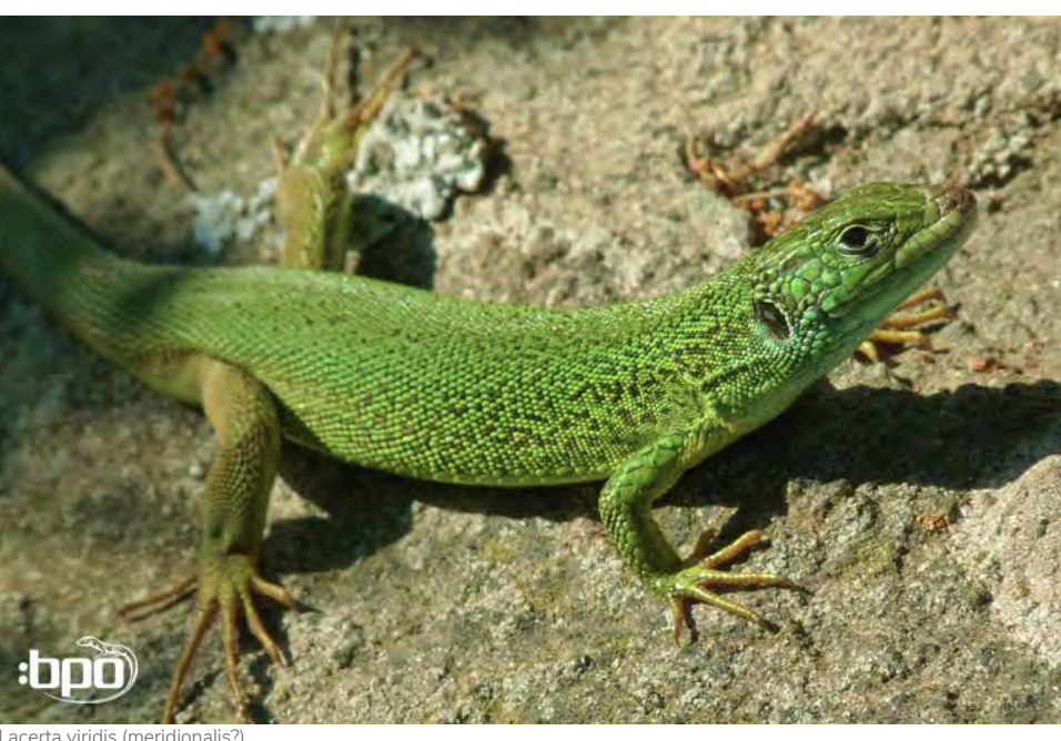
Lacerta viridis (meridionalis?)

With regard to our return flight from Thessaloniki we spent our last day at a beach hotel near Gerakini on the Chalkidiki (40 minutes from the airport): Our last day for herping!