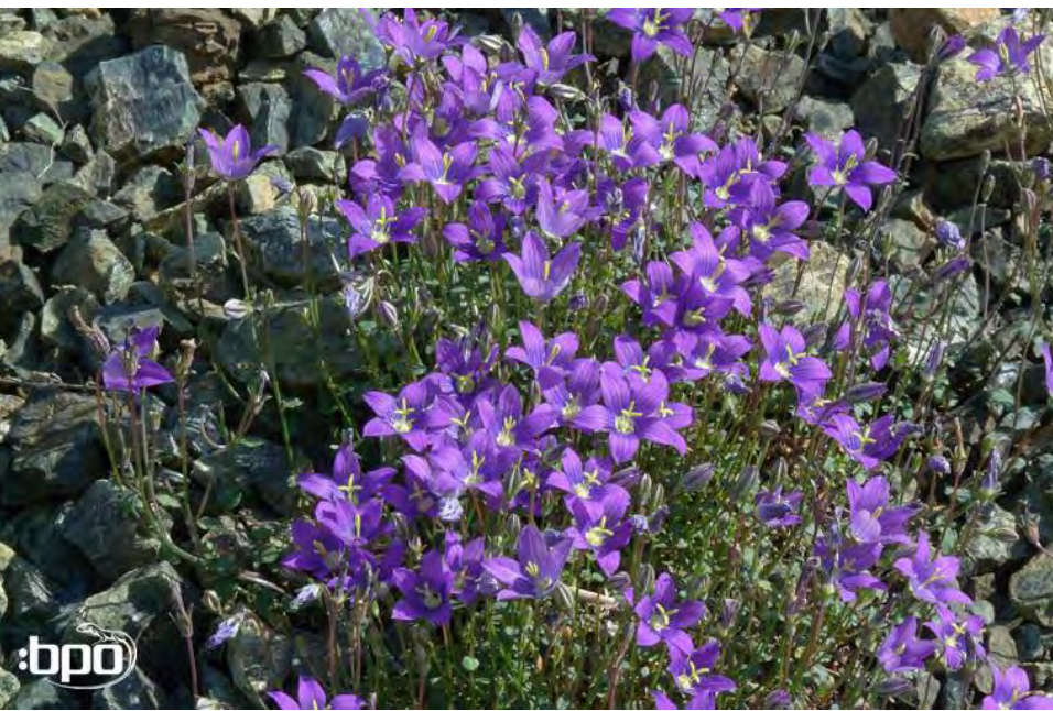
A typical plant of the Katara area: Campanula hawkinsiana