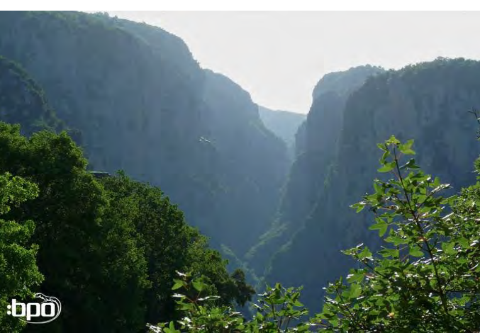
Morning sun in the Vikos gorge

After some hot days at the sea we longed for the moderate climate in the Vikos National Park. But meanwhile, the summer had also started in the mountains. So our hiking tours were not too extensive.