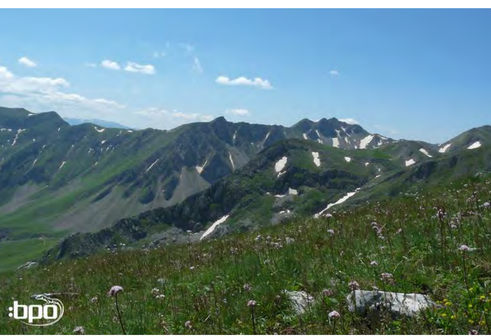
Mount Peristeri – habitat of...

One of our most beautiful hikes led us to the lonely Peristeri mountains. At the high altitudes of that range Lacerta agilis bosnica occurs – after intensive search we finally found those lizards. At lower altitudes Lacerta viridis viridis was common but very shy and difficult to photograph – we finally managed to take a snapshot of a specimen sitting on the road.