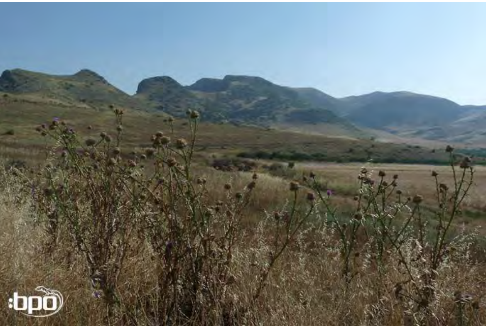
The Western foothills of Ossa – in this dry habitat we found numerous species, e.g.: