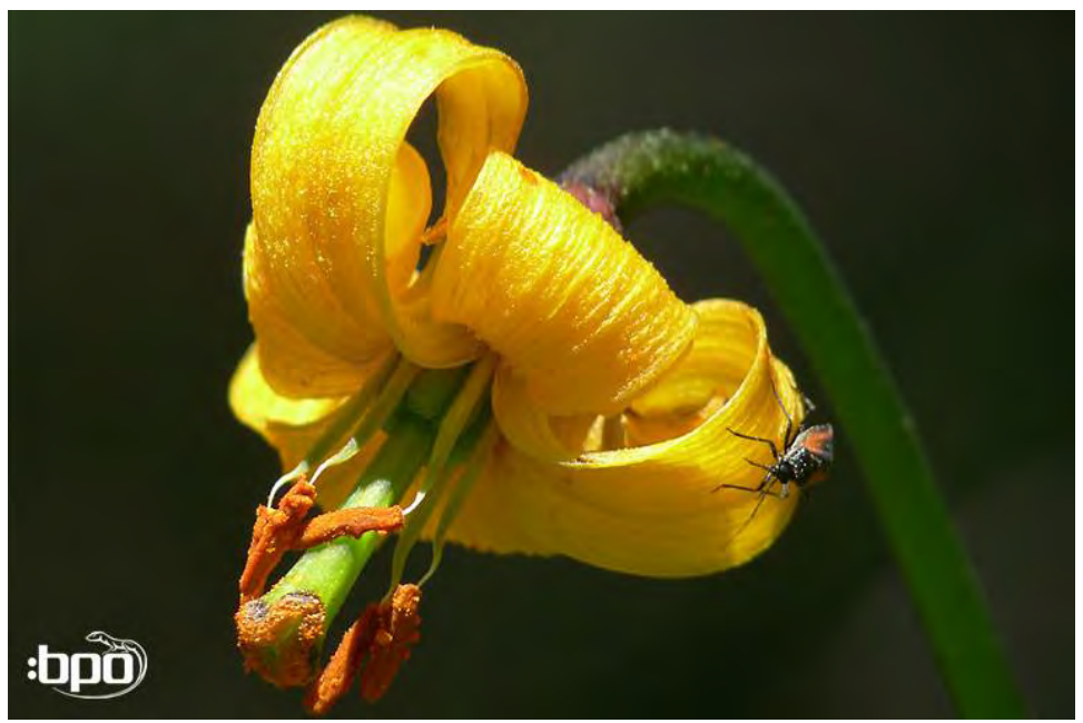
Lilium albanicum: a botanical highlight of that area