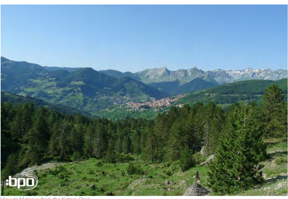
View to Metsovo from the Katara-Pass