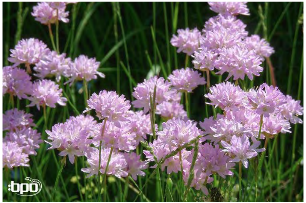
...Armeria rumelica and