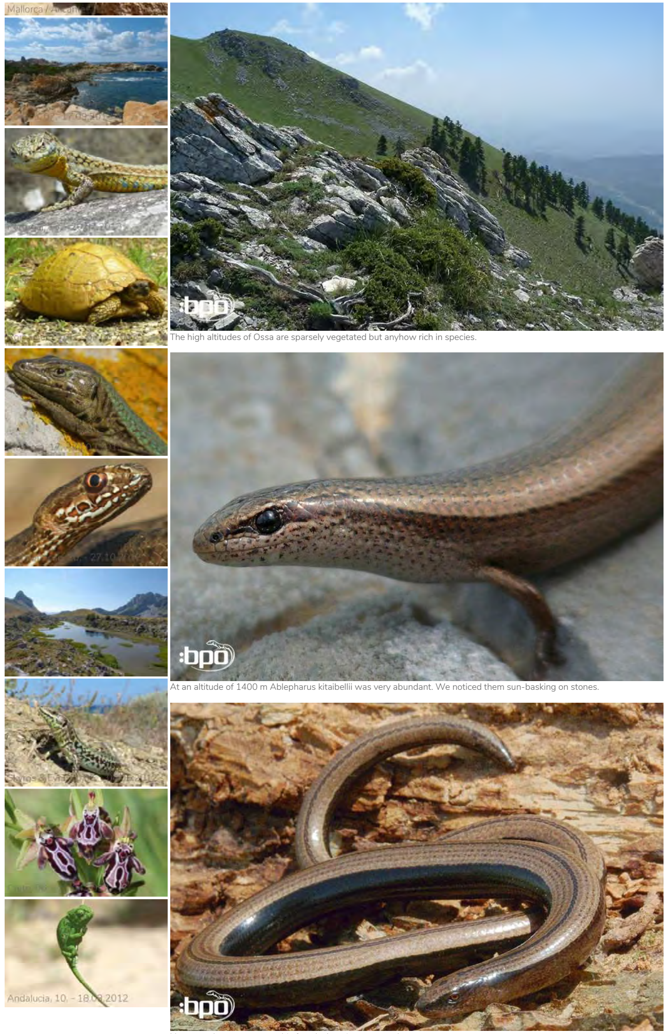
Here, we also came across this female Anguis graeca and...