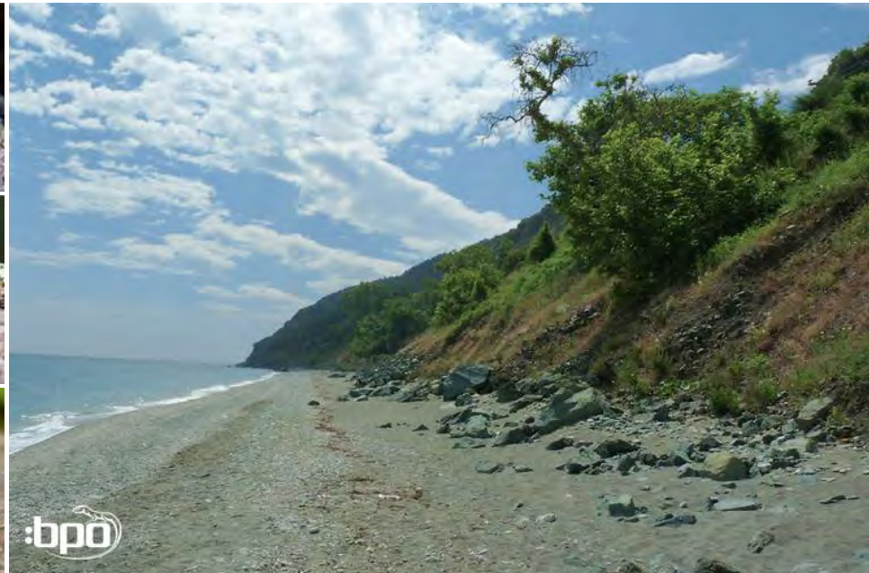
Nice beach at Kokkino Nero at the wooded eastern slopes of Mount Ossa