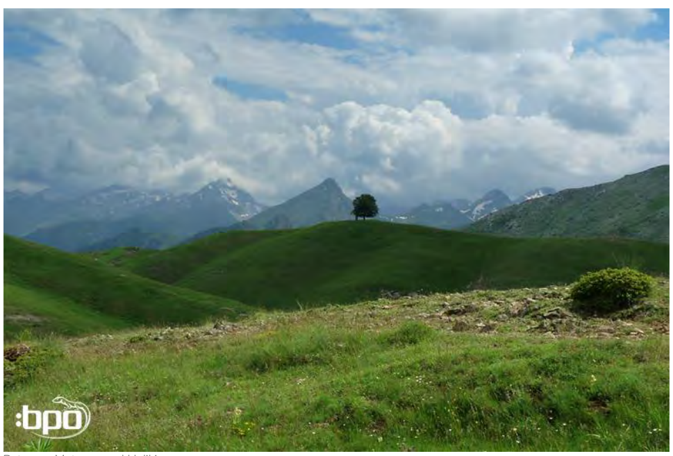
Between Metsovo and Haliki

We took the extremely dangerous – although asphalted – road with numerous rockfalls from Metsovo towards the village of Haliki in the mountains. Up there, we were rewarded by wonderful orchid meadows with Cephalanthera longifolia, Coeloglossum viride, Dactylorhiza sambucina, Orchis pinetorum and Orchis ustulata. At an altitude of 1600 m we found a pond with five amphibian species: Pelophylax sp., Bombina variegata, Hyla arborea, Mesotriton alpestris and probably Triturus macedonikus. Our way home was an adventure, as a thunderstorm turned the road into a muddy torrent.