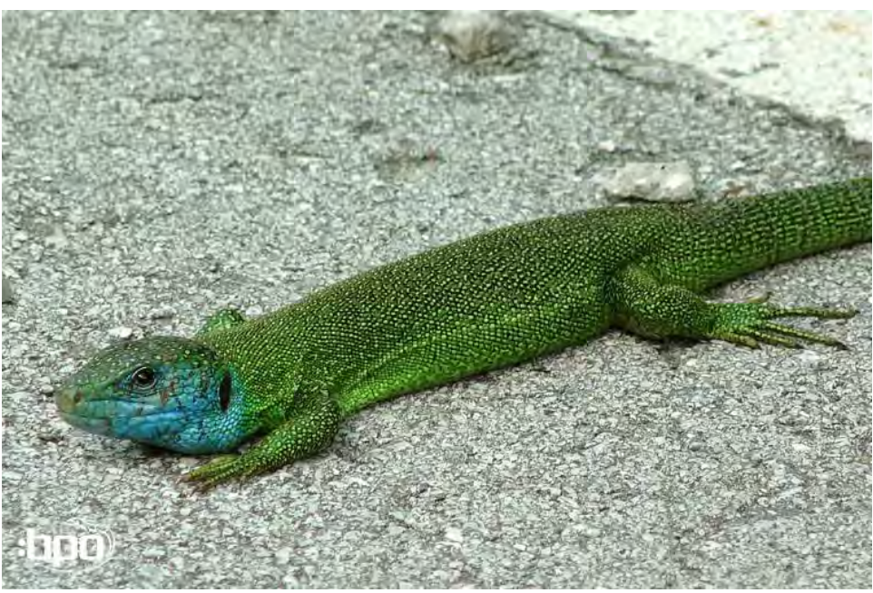
Male Lacerta viridis viridis at Metsovo