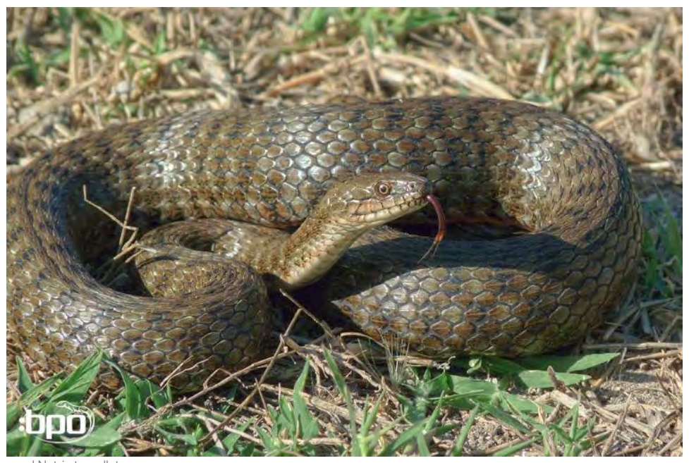
...and Natrix tessellata