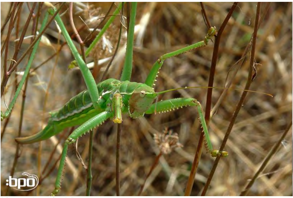
A fierce grasshopper: Saga hellenica