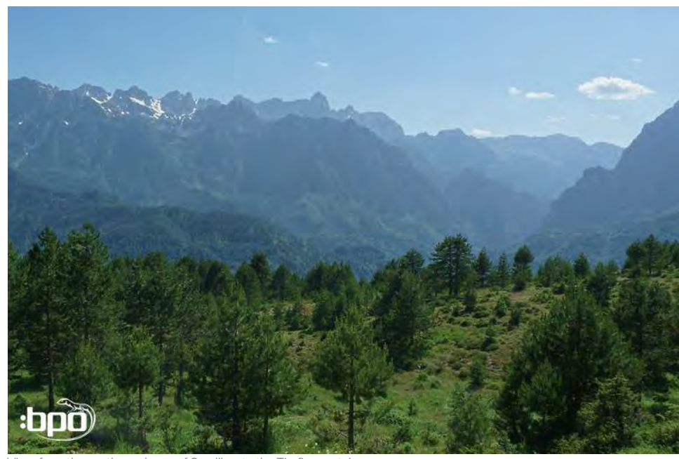
View from the southern slopes of Smolikas to the Timfi mountains