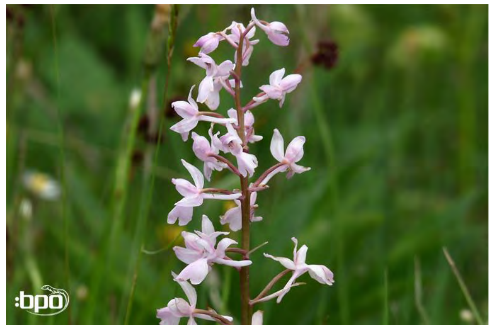
A pale variant of Orchis pinetorum