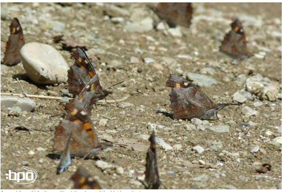
Assembling of Libythea celtis at the shore of the Voidomatis river