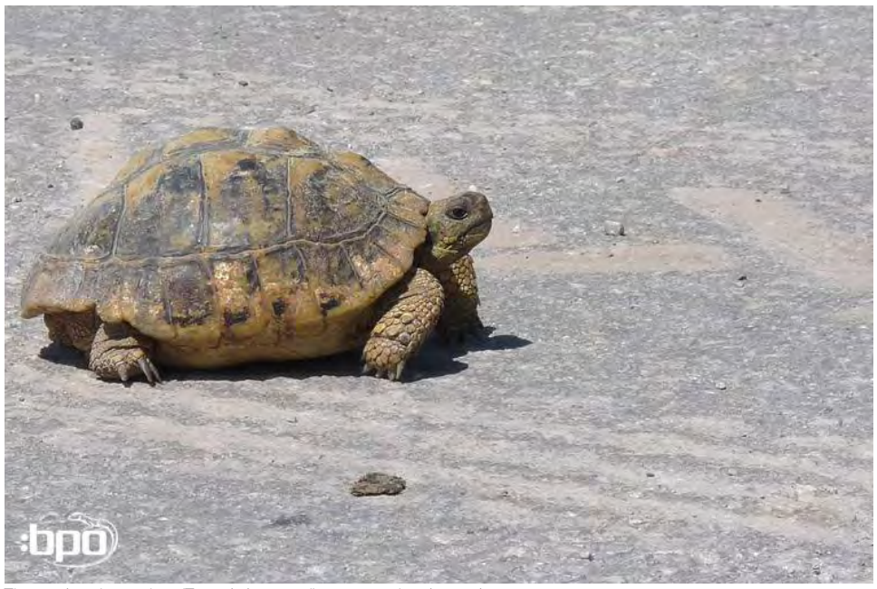
Time and again tortoises (Testudo hermanni) were crossing the roads