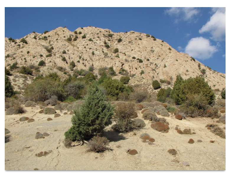
Figure 3: Habitat of Darevskia defilippii in the Qarchaqe ProtectedArea, near Bajgiran.

In this communication we introduce the new easternmost record of Darevskia defilippii from the Central Part of the Kopet Dagh Mountains (Fig. 3), which is situated 100 km to the east from the previous known eastenmost record in Turkmenistan in the western Kopet Dagh territory. Acanthophyllum Mountains and Juniperus sp. are the most common plants in this region. In the area between this new record and the other records in Iran (Golestan province), there are no reports from this taxon. We assume that the Kopet Dagh population is isolated from the populations in Central Elburz by geological events, also some drying seasons in recent years. We propose that this population needs more consideration to biosystematics field and should be compared with Central Elburz populations by molecular methods.