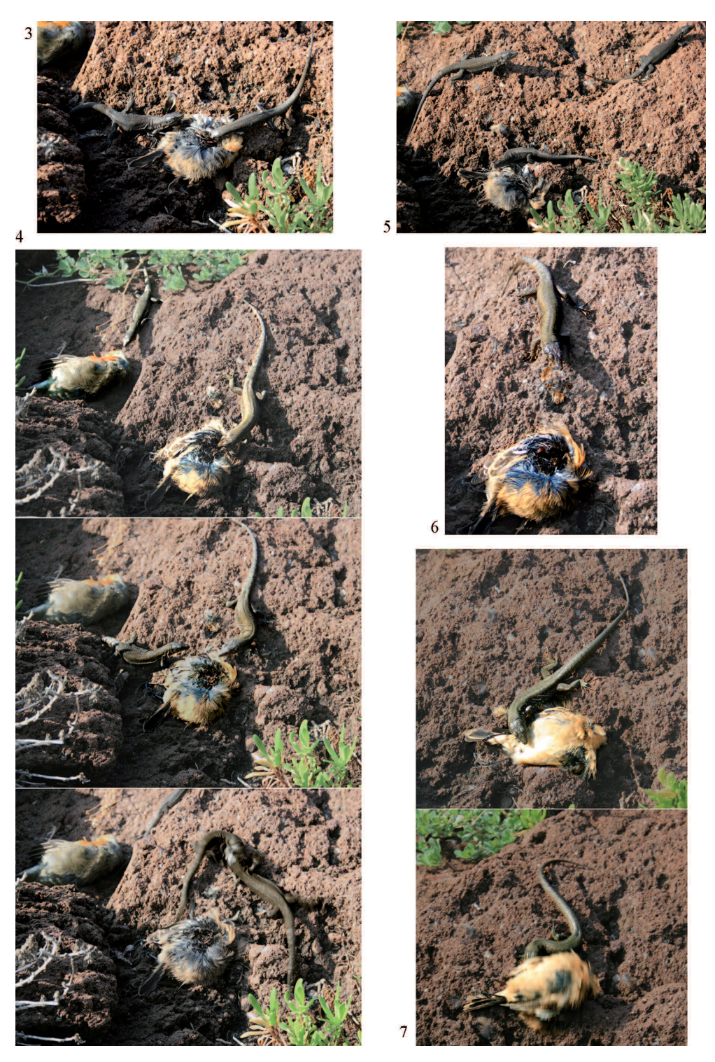
Figure 3. Two Podarcis raffonei on the carcass of a Common Stonechat preyed by Eleonora's Falcon; Scoglio Faraglione Islet, Aeolian Archipelago, October 2011. Figure 4. Intraspecific interactions between two specimens of Podarcis raffonei : above, the first lizard feeds on the carcass of a stonechat while the second (top left) approaching that of a robin; in the middle, the second has neglected the robin and approaches the other one, even if already occupied by the first lizard; below, the first attacks the second, showing a territorial behaviour. Figure 5. Another territorial behaviour: a male (top left) and a female basking near the stonechat's remains while another female is feeding on the carcass. Figure 6. A male eats a feather; to better perform the swallowing, the lizard repeatedly rubs its snout on the rocky soil. Figure 7. During the consumption, the prey is dragged from its original location by a lizard.