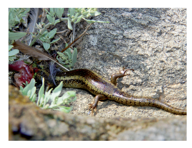
Figure 2. Chalcides ocellatus feeds on remains of passerine in a falcon's nest; Gallo Islet, Galita Archipelago, September 2001.

This foraging activity took place exclusively on ripped preys; only in one case, not directly related to interactions with falcons and observed at La Fauchelle, a skink has attempted to extract a dead but intact nestling from a nest of warblers.