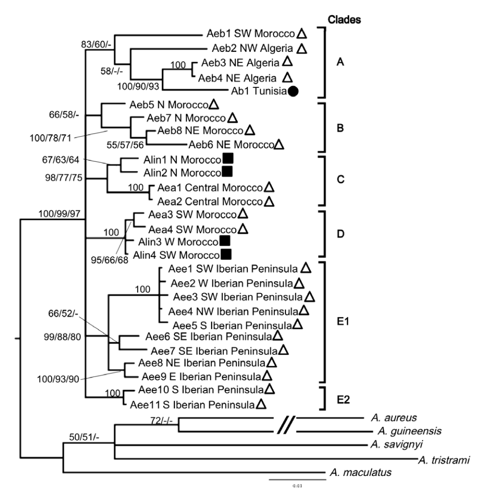
Fig. 3. Tree derived from the Bayesian analysis of the partial 12S and 16S RNA sequences. The tree was rooted using A. maculatus , A. aureus and A. tristrami . Bayesian posterior probabilities and bootstrap values are given above or near the branches (BPP/ML/MP). Values under 50% are represented by "–". Traingles, squares and circles refer to sequences of A. erythrurus , A. lineomaculatus and A. blanci respectively.

All phylogenetic methods inferred similar trees. Fig. 4 shows the tree obtained for the \beta -fibint7 with the BI. However, the phylogeny obtained with the nuclear marker differed significantly from the one obtained with the mtDNA, as shown by the ILD test result (p = 0.001). The main features of the nuclear genomic tree that differ from the mtDNA tree are that (i) the samples of mtDNA clade A did not group together, with A. e. belli from Southwest Morocco (Aeb1) being phylogenetically distant from the others; (ii) the haplotypes from the North and Northeast Morocco and also from the Iberian Peninsula form a strongly supported clade, which includes samples of mtDNA clades B, C and E; (iii) samples of A. e. erythrurus (Aee1, Aee6, Aee9, Aee10 and Aee11) form a monophyletic group in all analyses (BI, ML and MP); (iv) the close relationship between Central and Southwest Moroccan haplotypes (A. e. atlanticus-Aea1, Aea2, Aea3-and A. lineomaculatus-Alin4, but not Aeb1), which includes samples of the mtDNA clades C and D; (v) specimens from North and Northeast Morocco (A. e. belli-Aeb5 and