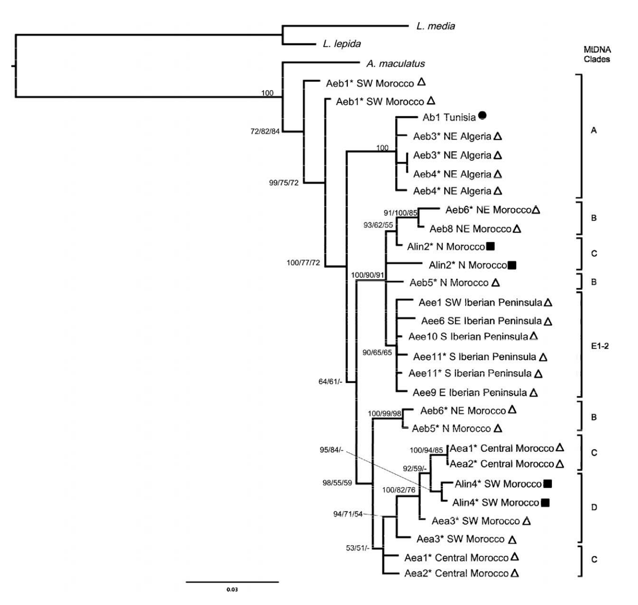
Fig. 4. Tree derived from the Bayesian analysis of the β-fibint7 sequences. The tree was rooted using L. media and L. lepida . Bayesian posterior probabilities and bootstrap values are given above or near the branches (BPP/ML/MP). Values under 50% are represented by "–". Samples followed by an asterisk (*) have different haplotypes of the nDNA marker.

* Indicates p < 0.05 and suggests that the unconstrained and constrained topologies are significantly different.