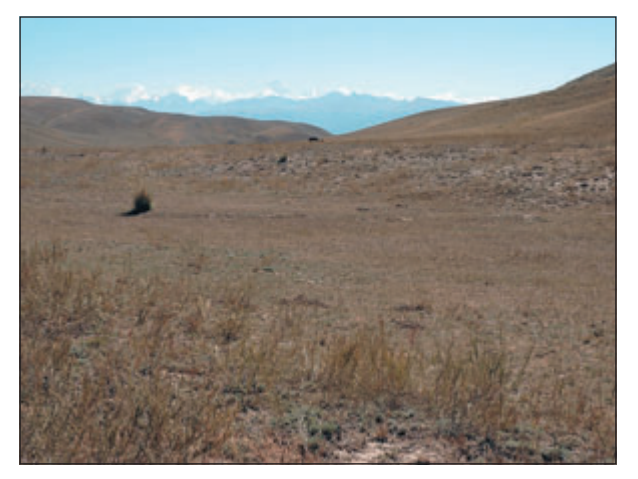
Fig. 3. Biotope of the racerunner of Eremias multiocellata complex in Tekes River Valley (Central Tien-Shan).

titude) and their habitats were shortly described with indication to type of landscape, soil and dominative plants.