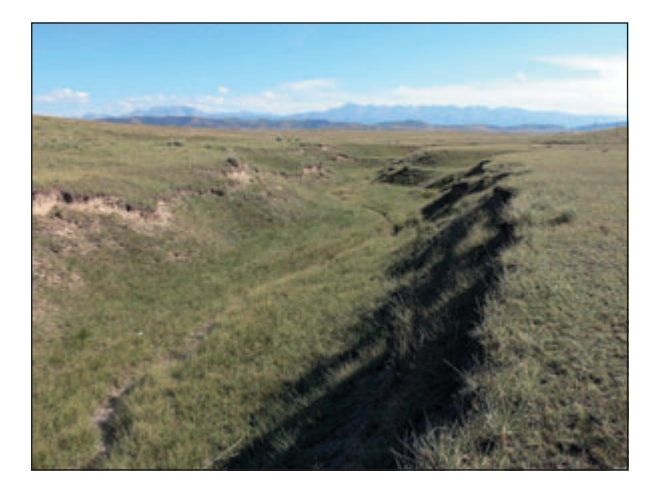
Fig. 2. Biotope of the racerunner of Eremias multiocellata complex in Kegen River Valley (Central Tien-Shan).