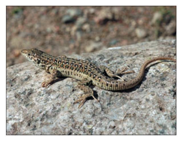
Fig. 4. Male of the racerunner of Eremias multiocellata complex from Kegen River Valley (Central Tien-Shan).