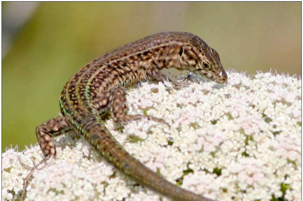
Female Podarcis lilfordi codrellensis (Escull de Binicodrell Gros 01-06-2009)