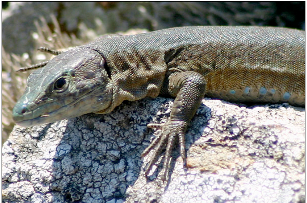
Male Podarcis lilfordi brauni (Illa d'en Colom 02-06-2009)

The fourth day we rented a kayak in Fornells and revisited the three islets in the bay.