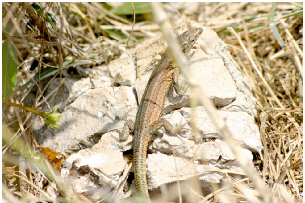
Female Podarcis lilfordi sargantanae (Illot d'en Tosqueta 05-06-2009)