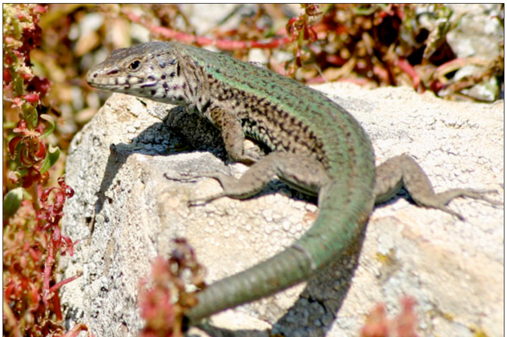
Male Podarcis lilfordi brauni (Illa d'en Colom 02-06-2009)