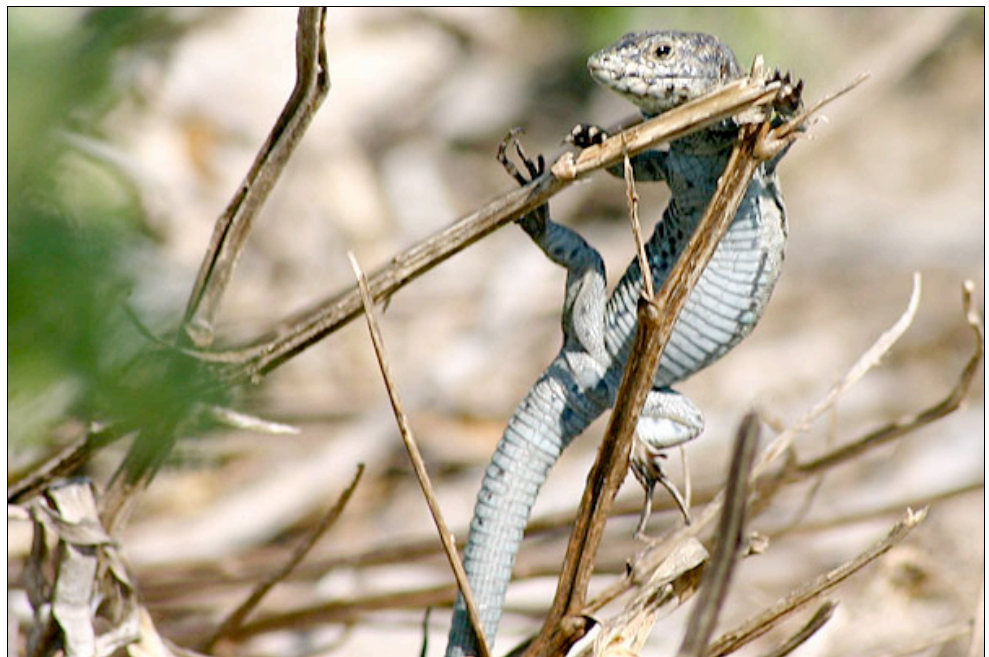
Male Podarcis lilfordi codrellensis (Escull de Binicodrell Gros 01-06-2009)