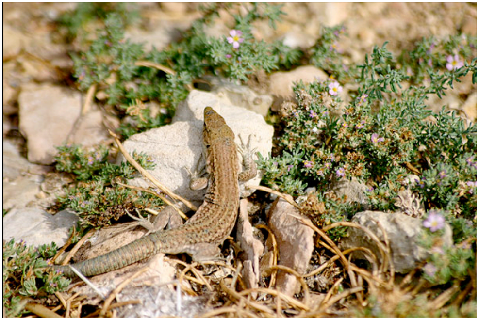
Female Podarcis lilfordi addayae (Illa Petita d'Addaia 09-06-2009)

Last year I promised to take a closer look at the other herps. Well, I didn't.