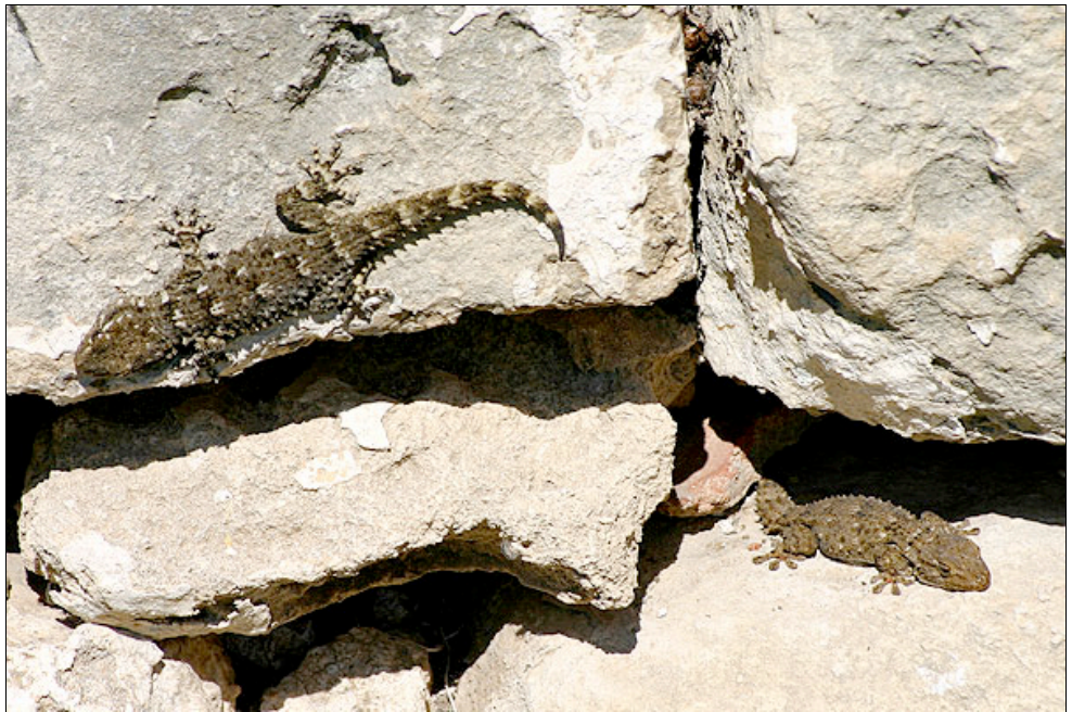
Tarentola mauritanica (Illa del Rei 07-06-2009)

The next day we went to the beach at Cala Algaiarens. In the river, dunes and pine forest there is a lot of herping to do. I wanted to see Emys orbicularis , but the only turtles I've spotted were Trachemys scripta and Testudo hermanni .