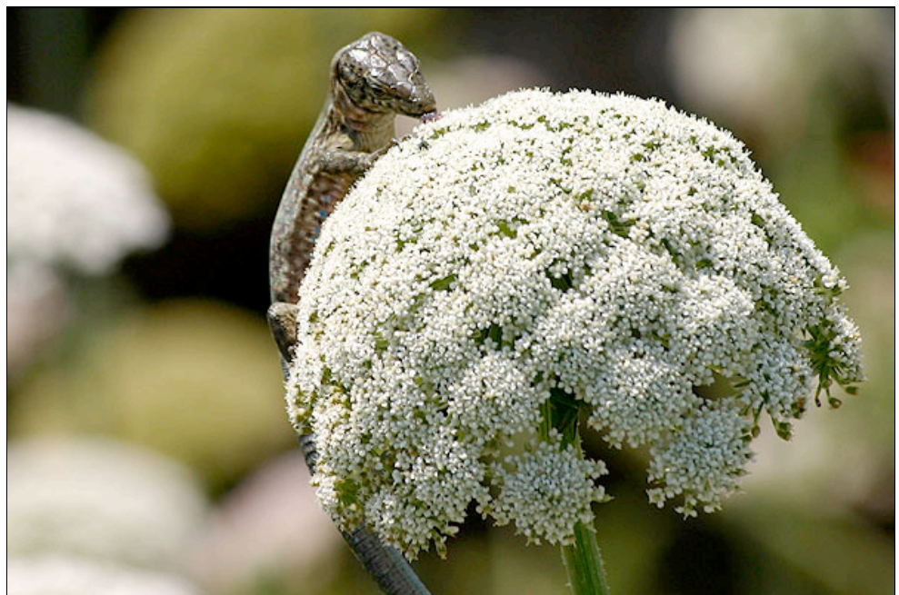
Female Podarcis lilfordi codrellensis (Escull de Binicodrell Gros 01-06-2009)