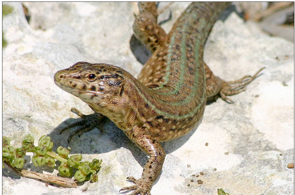
Male Podarcis lilfordi codrellensis (Escull de Binicodrell Petit 01-06-2009)

You have already voted, you gave this report 5/5