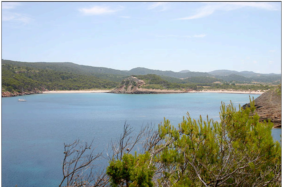
Cala Algaiarens (08-06-2009)

The next day we went to the beach at Cala Algaiarens. In the river, dunes and pine forest there is a lot of herping to do. I wanted to see Emys orbicularis , but the only turtles I've spotted were Trachemys scripta and Testudo hermanni .