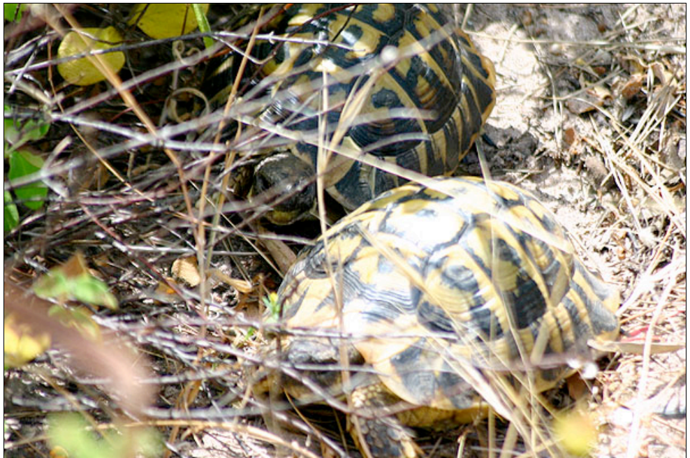
Testudo hermanni (Cala Algairens 08-06-2009)