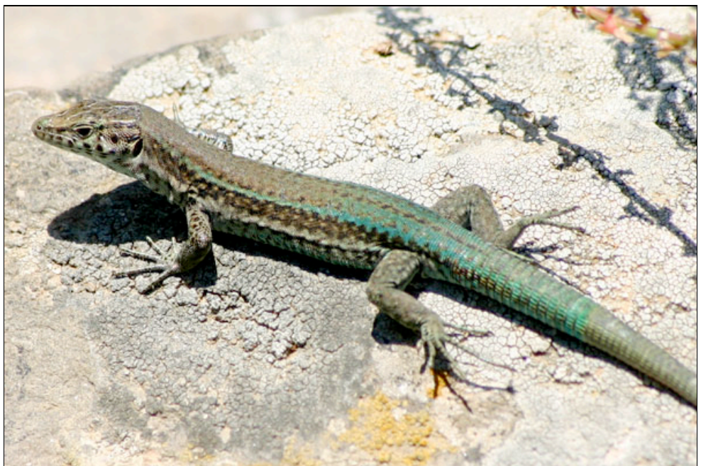
Female Podarcis lilfordi brauni (Illa d'en Colom 02-06-2009)