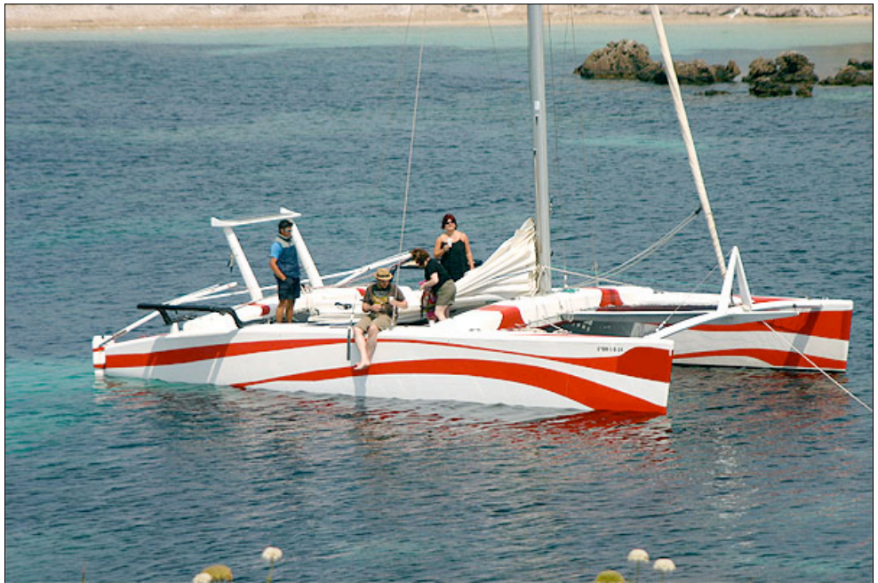
Catamaran with beverages (Illot d'en Tosqueta 05-06-2009)