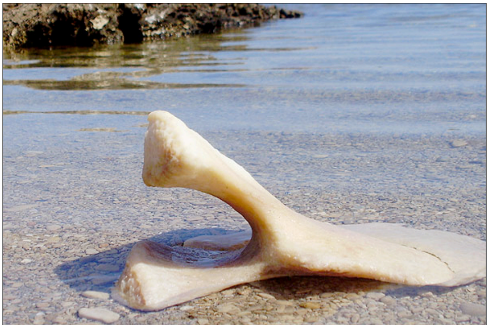
Remains of something larger than a lizard (Illot d'en Carbó 09-06-2009)