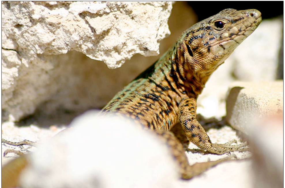
Male Podarcis lilfordi balearicus (Illa del Rei 07-06-2009)