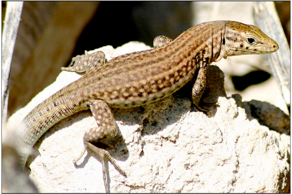
Female Podarcis lilfordi balearicus (Illa del Rei 07-06-2009)

On Sundays you can visit Illa del Rei; all transfers arranged by the volunteers of the foundation restoring the old naval hospital. Actually, I didn't think they would make progress in the restoration, but I was wrong. The departure for the visit is in En Castel at 8:45.