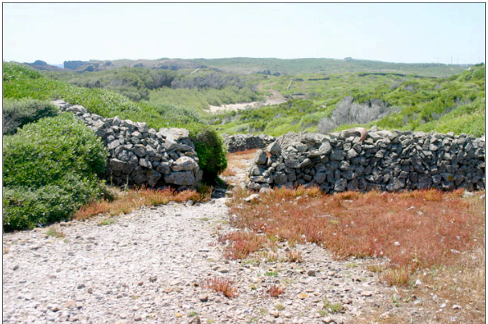
Habitat (Illa d'en Colom 02-06-2009)