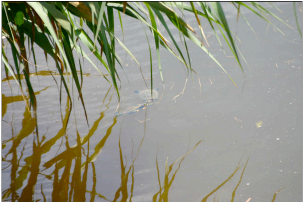
Trachemys scripta (Cala Algairens 08-06-2009)

When I finished hiking, and returned to the beach (after dismantling the camera, because people on the beach don't flee when photographed; they react different, I guess...), I saw a natrix maura specimen in shallow part of the river. When I was up and ready to make some shots, it was speeding away.