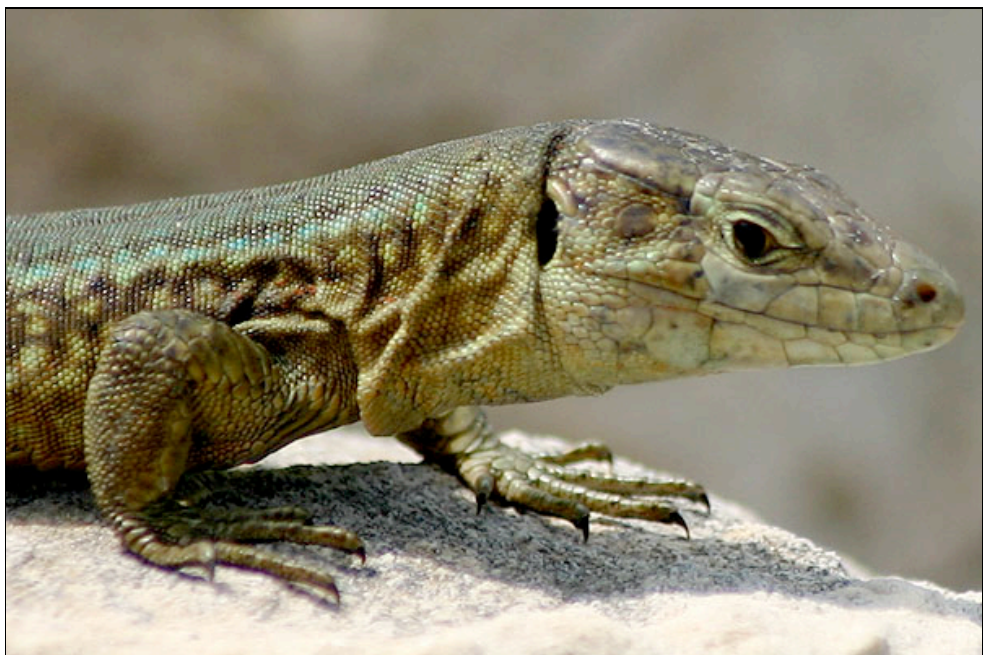
Male Podarcis lilfordi sargantanae (Illot d'en Tosqueta 05-06-2009)