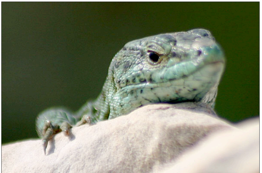
Male Podarcis lilfordi addayae (Illa Petita d'Addaia 09-06-2009)