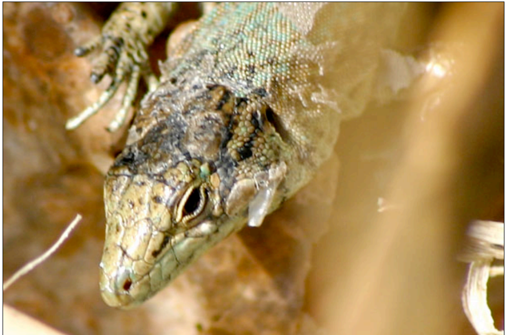
Male Podarcis lilfordi porrosicolus (Illot des Porros 04-06-2009)

The fourth day we rented a kayak in Fornells and revisited the three islets in the bay.