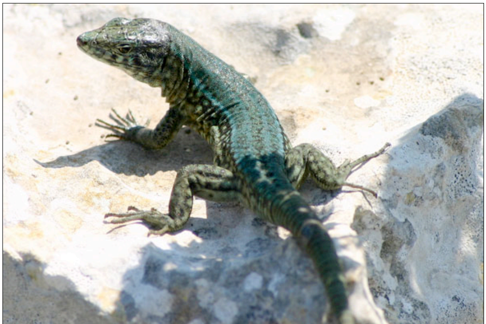
Male Podarcis lilfordi codrellensis (Escull de Binicodrell Gros 01-06-2009)

As you can see on the nectar feeding specimens, most of the Podarcis lilfordi subspecies of Menorca are quite small (SVL 5-6 cm).