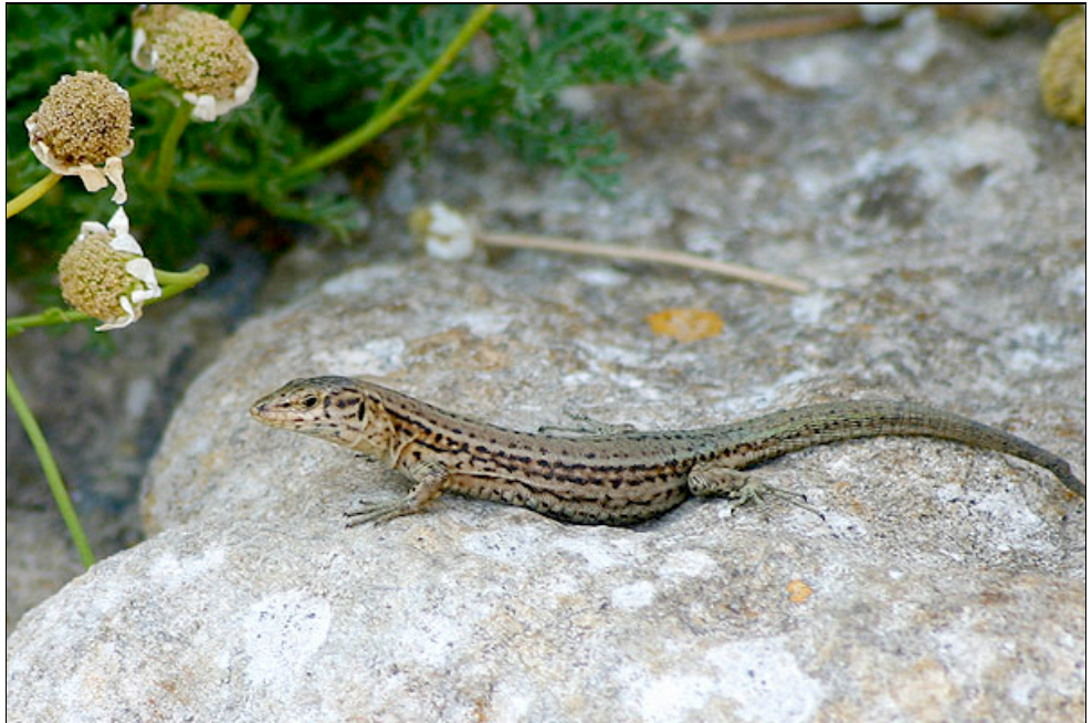
Female Podarcis lilfordi sargantanae (Illa Sargantana 04-06-2009)

The fifth day we went to Illot d'en Tosqueta. It could take a 90 minutes hike through the garigue from Son Parc, but the alternative catamaran trip from Fornells is much more comfortable.