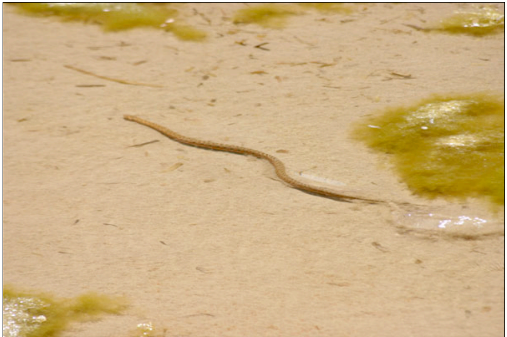
Natrix maura in a blur... (Cala Algairens 08-06-2009)

On Tuesday we rented a kayak in Fornells, put it on the rental-car's roof, and went off to revisit the islets near Na Macaret. The first islet visited was Illot d'en Carbó, which is actually two islets. On the smaller part there is some vegetation, but no lizards. On the bigger part there is a small population. Last year I spotted two complete melanistic specimens, but this year I couldn't retrieve them. The sister islet Illot d'en Carbonet is also without lizards.