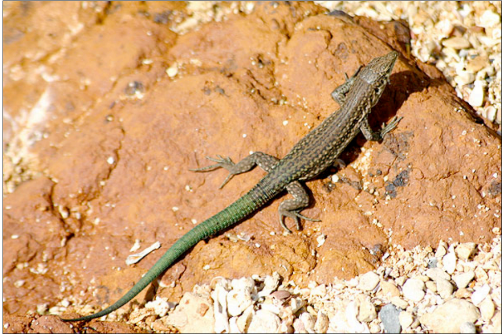
Juvenile (typical for most subspecies) Podarcis lilfordi carbonerae (Illot d'en Carbó 09-06-2009)

On Tuesday we rented a kayak in Fornells, put it on the rental-car's roof, and went off to revisit the islets near Na Macaret. The first islet visited was Illot d'en Carbó, which is actually two islets. On the smaller part there is some vegetation, but no lizards. On the bigger part there is a small population. Last year I spotted two complete melanistic specimens, but this year I couldn't retrieve them. The sister islet Illot d'en Carbonet is also without lizards.