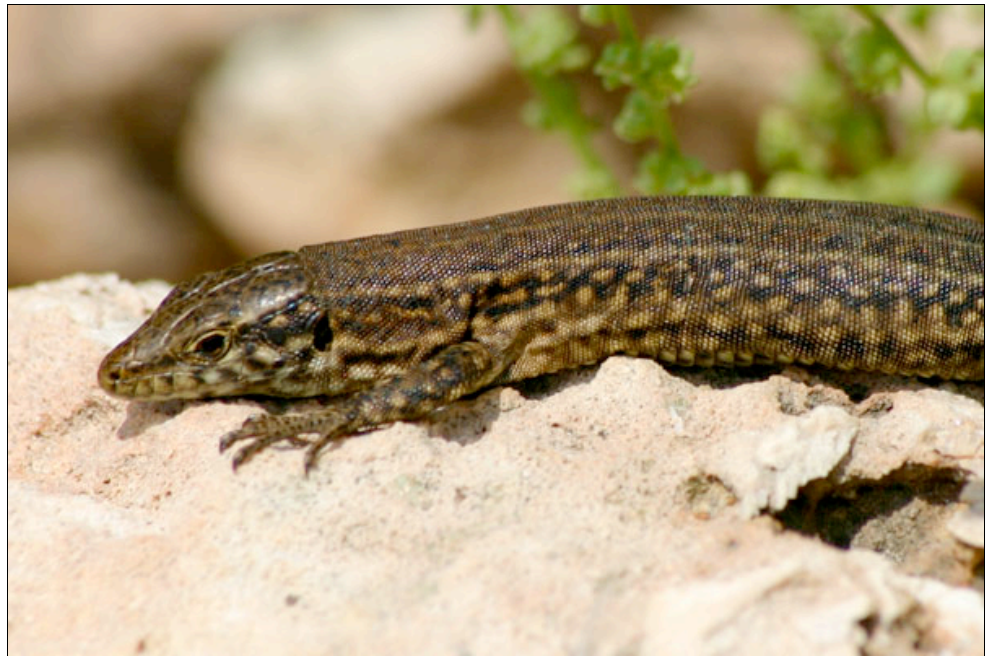
Female Podarcis lilfordi codrellensis (Escull de Binicodrell Petit 01-06-2009)