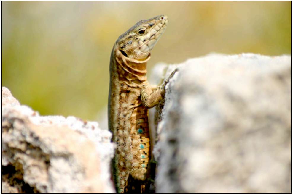
Male Podarcis lilfordi sargantanae (Illa Sargantana 04-06-2009)