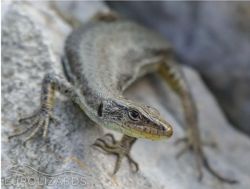
Female: MNE / Prokletije-Massiv, 03.07.2015 - Note the yellowish chin.

The Prokletije Rock Lizard is a rather inconspicuous, greyish species. However, it has chosen one of Europe's most scenic habitats: It only occurs in a few localities of the Prokletije mountain range at the Montenegrinan-Albanian border: a remote but truly magic place with a "Lord-of-the-Rings"-like atmosphere.