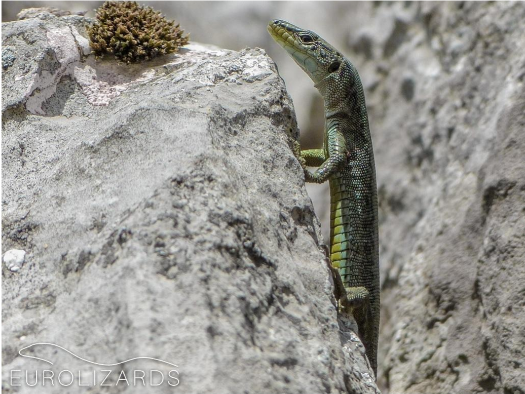
Montenegro / Prokletije mountains, 30.07.2012 - Males may have yellow undersides.