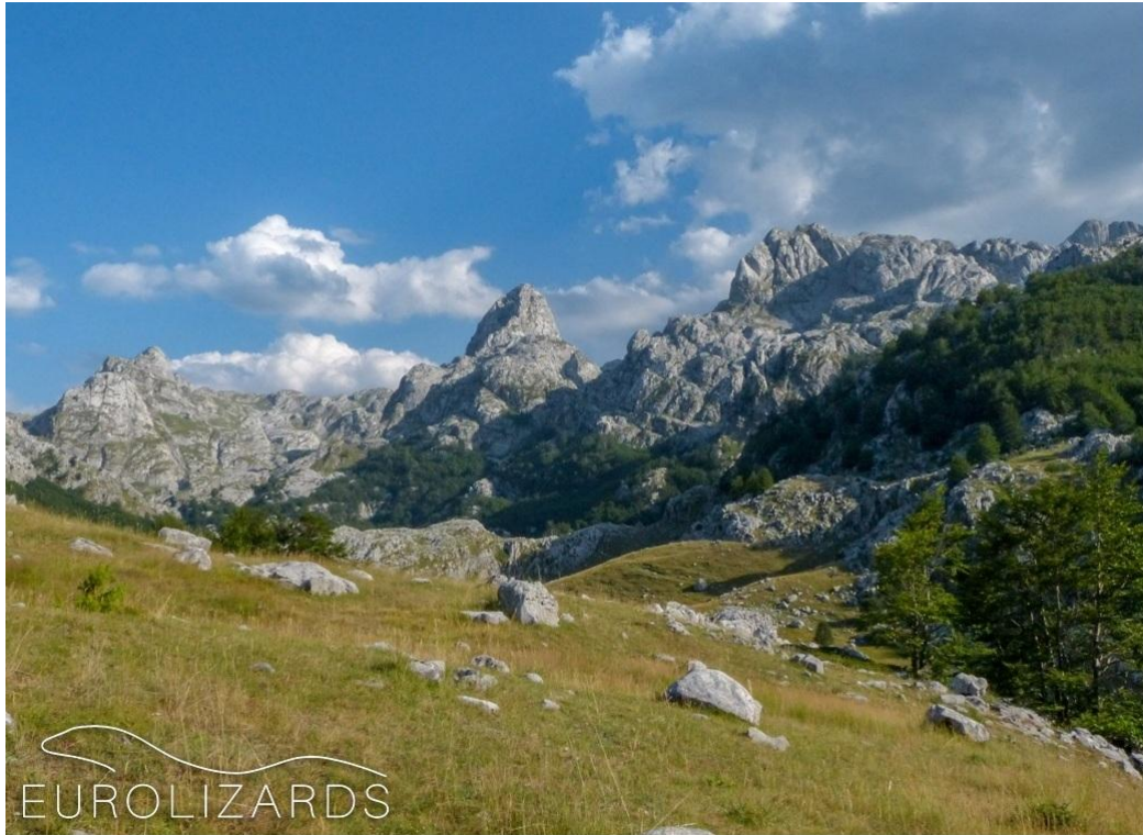
The Prokletije Mountains near Bukumirsko Lake at the Montenegrinan-Albanian boarder: Habitat of Dinarolacerta montegrina and Podarcis muralis .