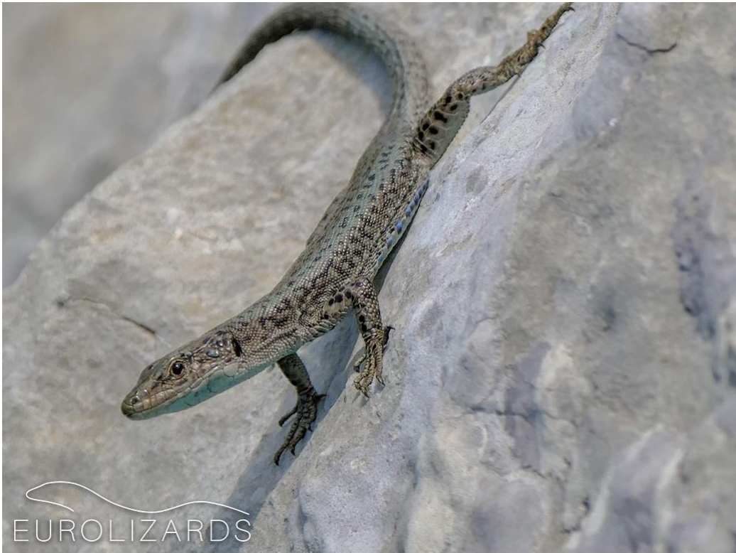
Male; Montenegro / Prokletije mountains, 03.07.2015 - Note the blue outer ventral scales.