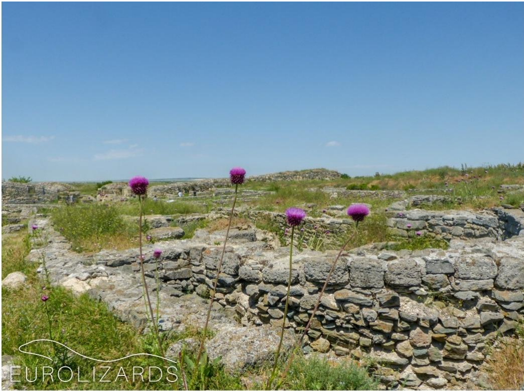
The ruins of ancient Greek Histria at the Romanian Black Sea coast - Habitat of Podarcis tauricus and Lacerta agilis .