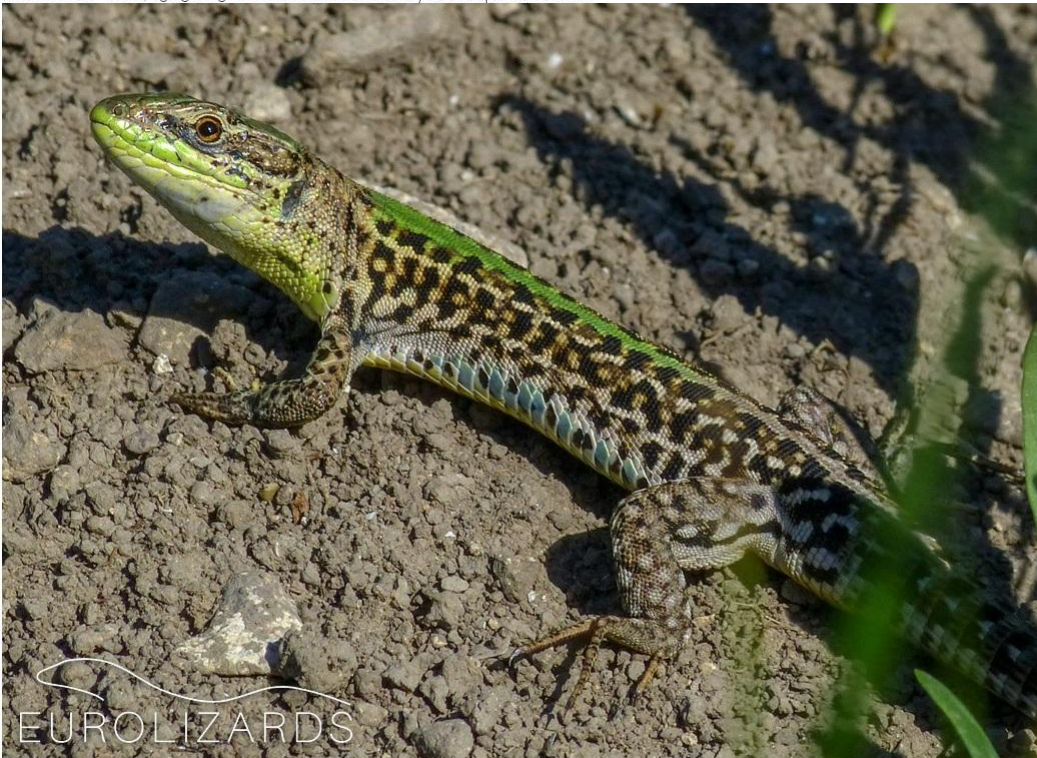
Female: RO / Vadu, 25.05.2013 - Podarcis tauricus usually has unspotted labials.