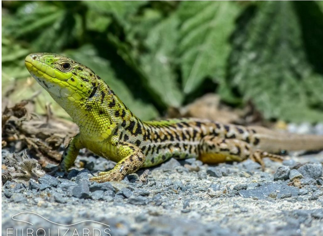
Male: RO / Histria, 27.05.2013 - Males frequently show yellow undersides.

The Balkan Wall Lizard is the easternmost member of the genus Podarcis : Its distribution area reaches from Hungaria over Romania, Bulgaria and Eastern Greece and along the Black Sea coast to Crimea Peninsula in the east (as the scientific name "tauricus" indicates). Being well-adapted to the eastern European steppe, it lives in grassy habitats and climbs less than other Wall Lizards.