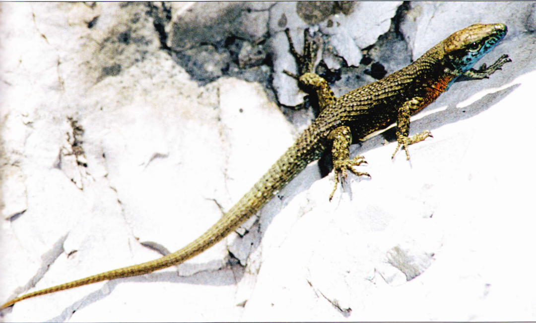
Fig. 35: Algyroides nigropunctatus , Val Rosandra, Trieste.