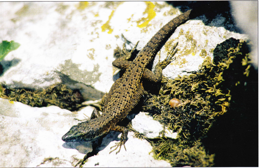
Fig. 33: Algyroides nigropunctatus , Cres Islands, Croatia.