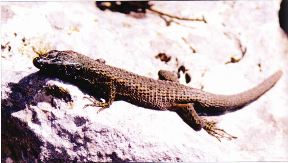
Fig. 34: Algyroides nigropunctatus , Beli, Cres Islands, Croatia.