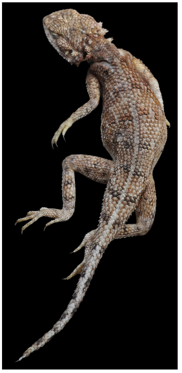
Fig. 12. Agama boueti from Douentza, Mali.

This ground-dwelling Agama was described after two specimens from Gao on the Niger River in Mali and considered to be so rare that even its validity was questioned (Wermuth 1967). But six decades later it was found to be very common close to Dakar, Senegal (Böhme 1979), and subsequently also recorded from the Air Mountains, Republic of Niger (Joger 1981). Today it is known to be continuously distributed in the Sahelian belt from Senegal to Niger (Mediannikov et al. 2012, Trape et al. 2012),