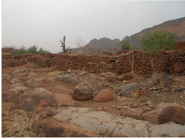
Fig. 3. Pergué village, Mali.

In 2015, J. Heath also visited Burkina Faso and was able to gather some photographic vouchers of herpetolog-