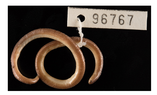
Fig. 10. Leptotyphlops albiventer from Dérégoué, Burkina Faso.

length as well as to its body diameter, the midbody scale count, the number of subcaudals and the color pattern of a brownish dorsal and a whitish ventral side fit the characteristics of this species as described by Hallermann & Rödel (1995) and Trape & Mané (2006). ZFMK 97767 (Fig. 10) documents thus the fourth record from a fourth country, but the first for Burkina Faso.