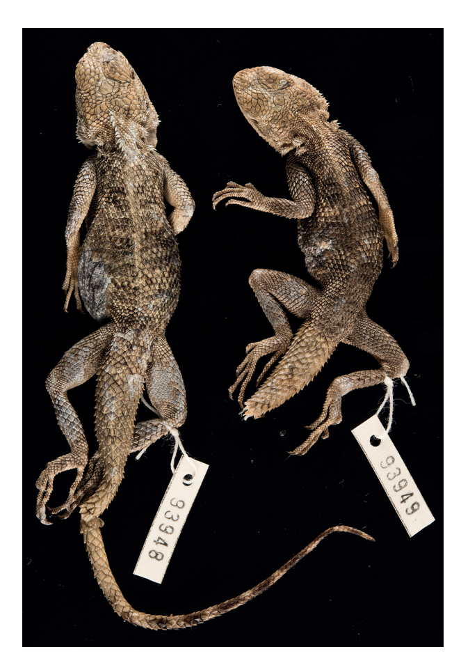
Fig. 9. Agama sp. from Dérégoué, Burkina Faso. Left: male, and right: female.

southeast. Recorded also for the Burkina Faso part of the RBTW in the east of the country (Chirio 2009).