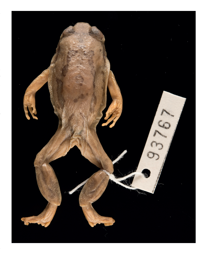
Fig. 4. Leptopelis bufonides from between Douentza and Boni, Mali.

A comment to be made on this widely distributed and common species refers to the generic nomenclature. After the partition of the collective genus Bufo , the Afrotropi-