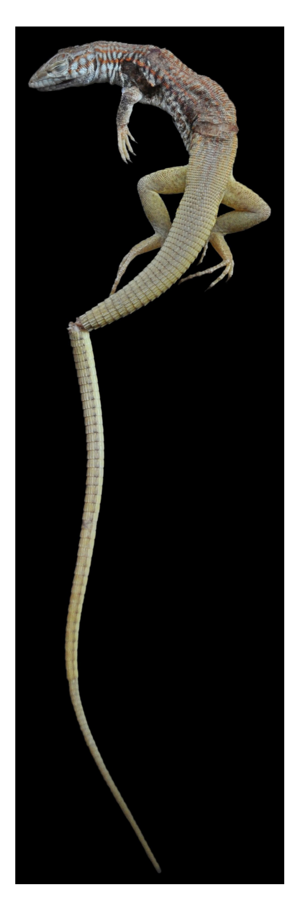
Fig. 13. Latastia longicaudata from Douentza, Mali.