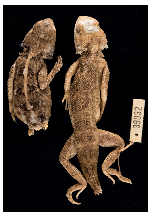
Fig. 8. Agama sankaranica from NE of Dérégoué (left) and from Ouagadougou (right), Burkina Faso. Note the absence of a light vertebral line in the right specimen.