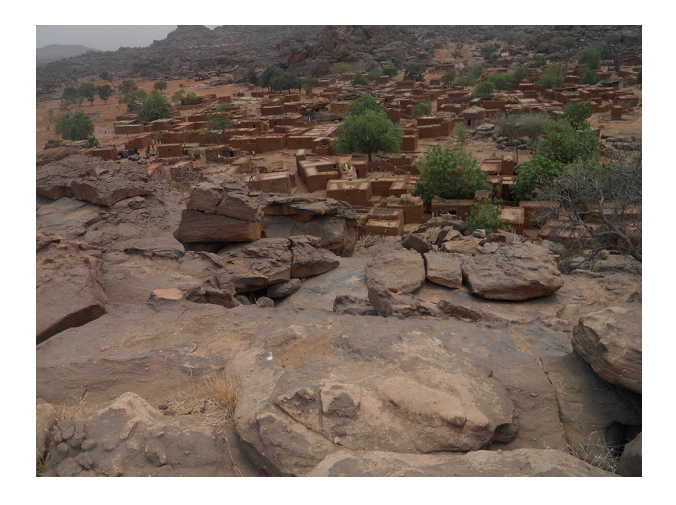
Fig. 2. Anda village, Mali.

The area between Douentza and Bandiagara was visited several times, in 2009 (September), 2010 (July) and in 2011/2012, in the course of Dogon linguistic studies carried out by Jeffrey Heath in the Dogon Province. Some amphibians and reptiles were seen, photographed and – by focal sampling – collected. These voucher specimens are deposited in ZFMK's herpetological collection, as are the photographs in ZFMK's herpetological photo archive.