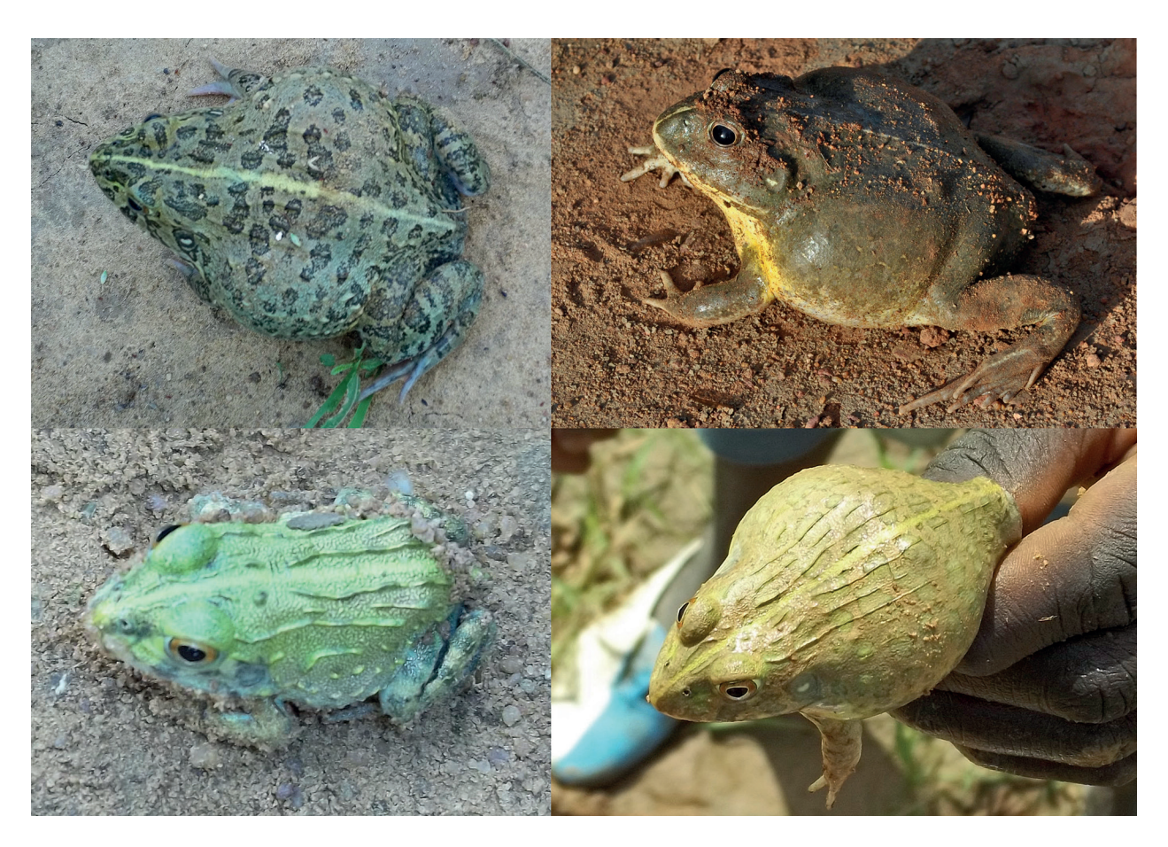
Fig. 7. Four specimens of Pyxicephalus sp. from between Mopti and Sévaré, Mali, to show the variability in color pattern. The specimen on lower left is a juvenile (not on scale).