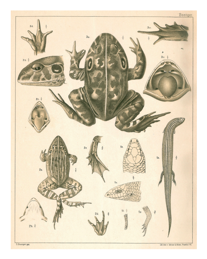
Fig. 6. Plate from Boettger (1881) showing the (presumably lost) type specimens of his Rana (currently Ptychadena ) trinodis (lower left) and Maltzania (currently Pyxicephalus ) bufonia (upper).

Hoplobatrachus occipitalis (Günther, 1859)