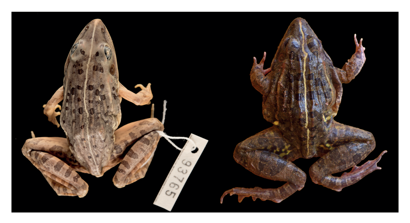
Fig. 5. Ptychadena trinodis from between Douentza and Boni, Mali. Left: ZFMK voucher; right: specimen not collected.