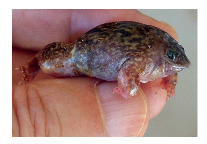
Fig. 11. Hemisus marmoratus from Karankasso-Vigué, Burkina Faso

Tarentola cf. ephippiata O'Shaugnessy, 1857