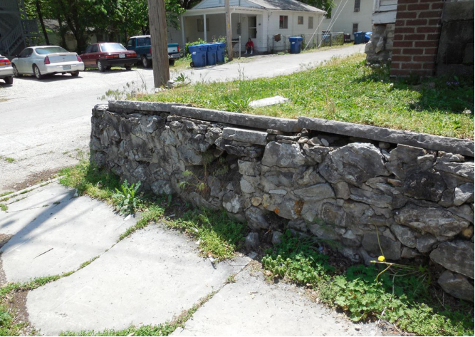
Fig. 3. Rock and concrete walls inhabited by the Northern Italian Wall Lizards ( Podarcis siculus campestris ) in Joplin, Missouri.